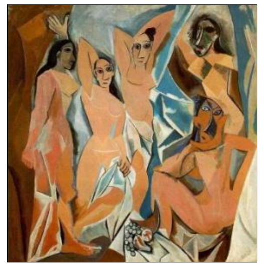
Figure (3) Picasso' painting - Les Demoiselles d'Avignon