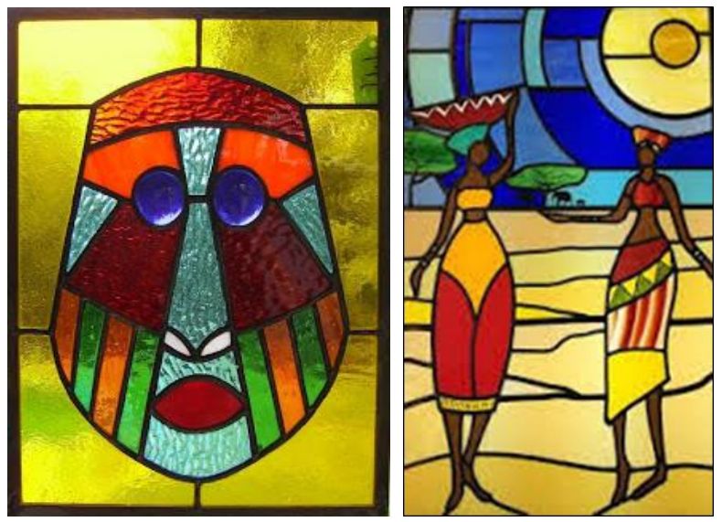
Figure (8) Stained glass - Contemporary African art