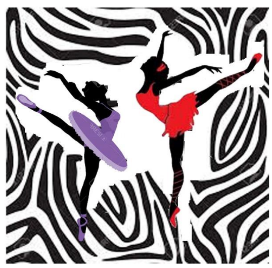
Figure (14) (Colored Ballet) Glass Panel-Glass Mosaic