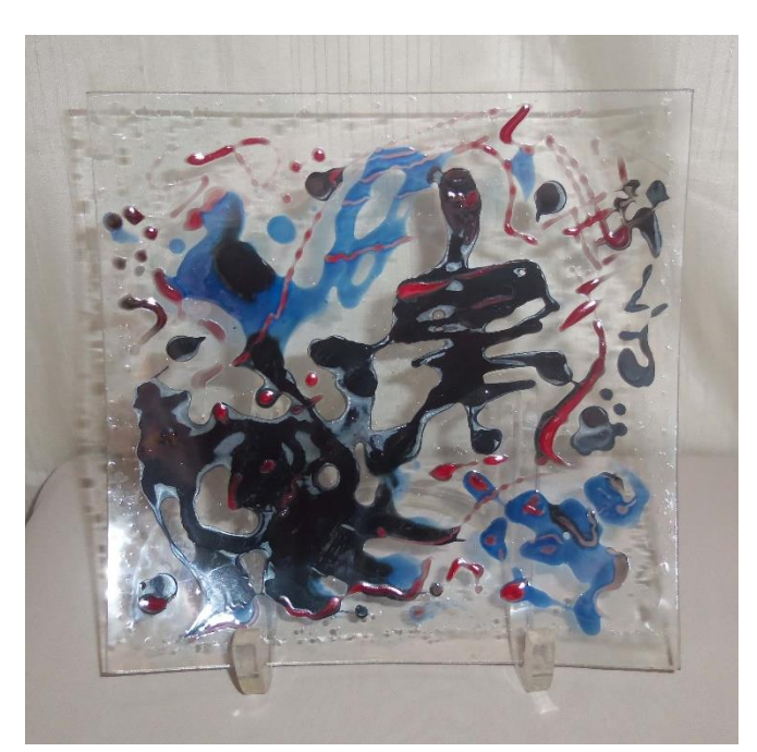
Figure (17) The African movement- glass plate -painting on glass and slumping

Based on the African art philosophy in using elements such as using human in an abstract way, it was executed by using glass painting and slumping to achieve the form of the plate.