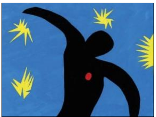
Figure (4) Matisse's painting-influence of African art

Matisse influenced by African art in its aesthetic values, especially Sculptures African art and he was interested in the arts of Northern Africa and the African primitive art and also used the expression in sensory net fees and children's arts. He used color as an essential means to express the elements in a simplified form of spontaneous childlike, Matisse has revolted against the traditions of the art schools and restrictions, and headed directly to express emotions freely using the clear and contrasting colors, in search of the properties of fine art, which overlooked the academic art.