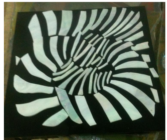
Figure (16) Executing design (n. 15) Reforming glass (fusing)

Based on the African art philosophy in using elements of nature such as zebra and expressing it in an abstract way, it was executed by reforming (fusing) white and black glass to form this panel.