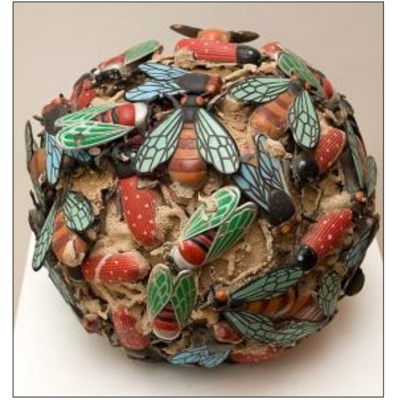
Figure (5)-Ceramic, sand, plastic and toy insects-artist Jorge Dias-2008-'Coisa'- Sculpture

There are a lot of samples of ceramic art which got involved with African art using different techniques and materials to achieve ceramics <u>art ware, tile, sculpture, tableware</u> and pottery.