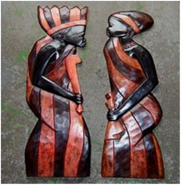
Figure (6) African wall Plaque-Chief and Queen