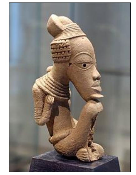
Nok Terracotta, 6th century BC–6th century CE Figure (1)

Most <u>African sculpture</u> was historically in wood and other natural materials that have not survived from earlier than, at most, a few centuries ago; older pottery figures can be found from a number of areas.<sup>[3]</sup> <u>Masks</u> are important elements in the art of many peoples, along with human figures, often highly stylized. There is a vast variety of styles, often varying within the same context of origin depending on the use of the object, but wide regional trends are apparent; sculpture is most common among "groups of settled cultivators in the areas drained by the <u>Niger</u> and <u>Congo rivers</u>" in <u>West Africa</u>.<sup>[4]</sup> Direct images of deities are relatively infrequent, but masks in particular are or were often made for religious ceremonies; today many are made for tourists as "<u>airport art</u>".<sup>[5]</sup> African masks were an influence on European <u>Modernist</u> art, which was inspired by their lack of concern for naturalistic depiction. Since the late 19th century there has been an increasing amount of <u>African art in Western</u> collections, the finest pieces of which are now prominently displayed.