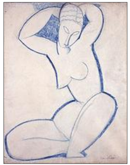
Figure (2): Artist Modigliani Caryatid, now at the New Art Gallery Walsall

At the start of the twentieth century artists like Modigliani became aware of, and inspired by African art, he was an Italian painter and sculptor who worked mainly in France. He is known for portraits and nudes in a <u>modern</u> style characterized by elongation of faces and figures.