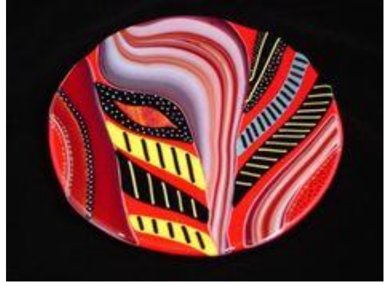
Figure (9) Glass plate- Contemporary African art