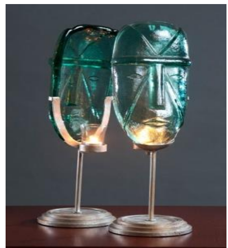
Figure (10) Glass sculpture Masks - Contemporary African art