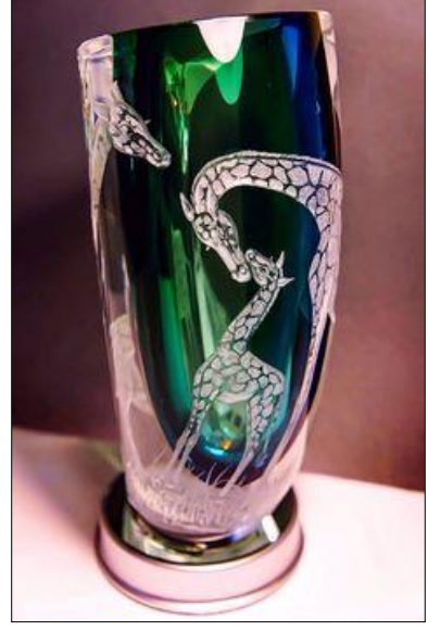
Figure (7) Seduction of Light- Crystal Vase- African Art- Giraffe