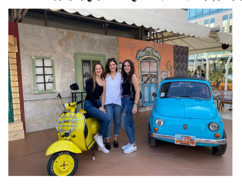
Figures (12,13,14,15,16 pictures of the audience gathering in front of the decoration during the celebrations