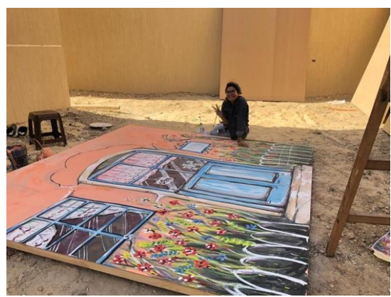
Figures (10), (11)(

In the end, the day of the celebration came, when the goal was achieved by gathering the audience in front of the decoration, which used the techniques of theatrical decoration and photography in front of it, as if they were in one of the alleys in Italy, and the following pictures of some of the scenes after the implementation and on the day of the celebration and the audience took places for photography and forms from the researcher's photography Figure (12, 13,14,15,16).