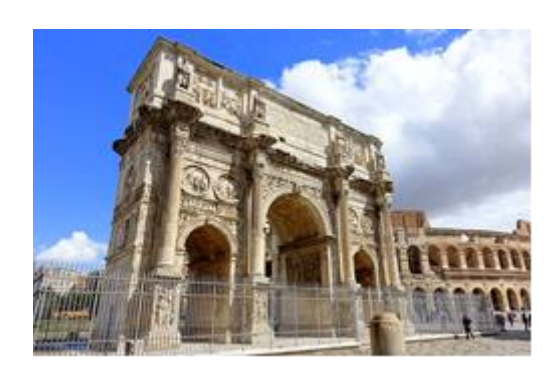
Figure No. (3)

(3), then the researcher determined the sizes as in Figure (4) with Maintaining the same proportions, taking into account the space and proportions of the place and the final shape that was implemented in Figure No. (5)