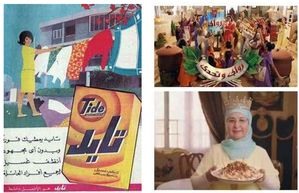
Figure (3): Women as housewives in a domestic context

Women were presented in past times as thin beautiful and shy on one hand or as a mother, wife and less important gender. Women were portrayed as inactive housewives, who only seek to satisfy their husbands and mother-in-law. They were mostly represented as housewives; they depend on men, had secondary roles, and more likely to be set in the domestic sphere (Chuku et al. 2014, Debbagh 2012). Ads presented the female in the position of a housewife.