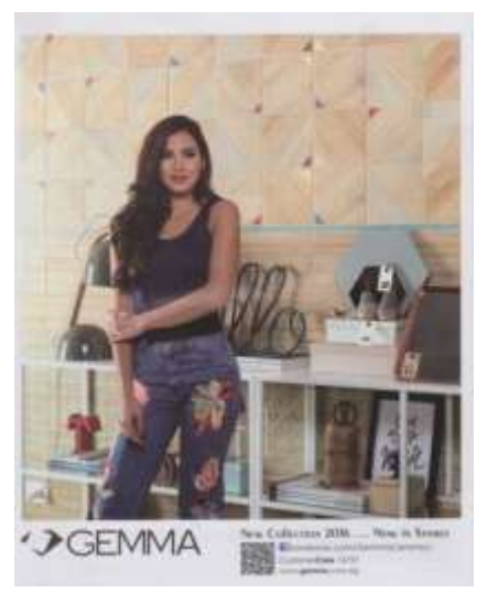
Figure (9): Women as sex tools shown as decorative objects