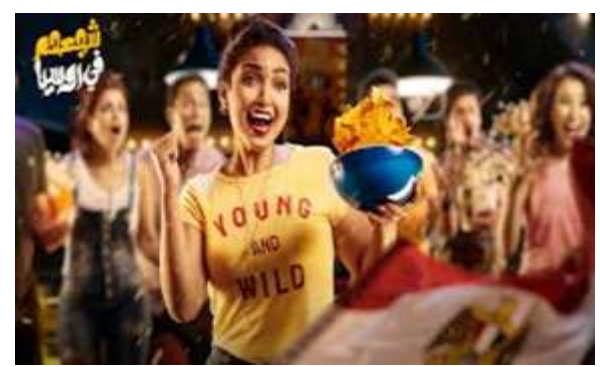
Figure (5): Women in recent sport ad

Contemporary advertising in Egypt represents women as a strong partner in sports events either as spectator or as a player. It is common in recent ads to see Egyptian women in a sportive occupation, unlike past ads that portrayed men as the dominant gender in sports occupations.