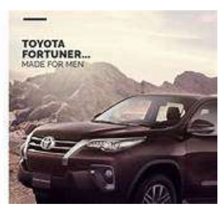
Figure (7): Men in recent ad portrayal

Stankiewicz & Rosselli, (2011) asserted that Exposure to sexually objectifying advertisements of women produces "anti-women attitudes" and negative stereotypes. For example, the belief that females are only precious as tools for the aspirations of males, that a true man has to be sexually violent, that cruelty is "erotic", and that females who are victims of a sexual attack "asked for it". Females' portrayal as sex tools and presenting them as victims of violence emphasizes the belief that obedience and surrender are inherent attributes in females.