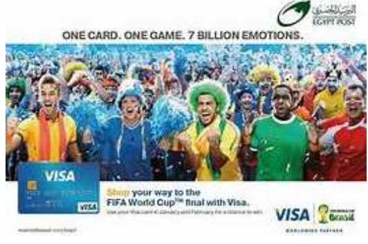
Figure (4): Men dominance in sport ad

For a long time, discouragement of women's accomplishments especially in sports dominated the advertising scene. That is, advertisements in Egypt emphasize the notion that a number of sports, such as soccer, are only 'male-dominated'. For this reason, the majority of advertisements that utilize eminent soccer or athletic players are performed by male athletes, not females. See figure (4).