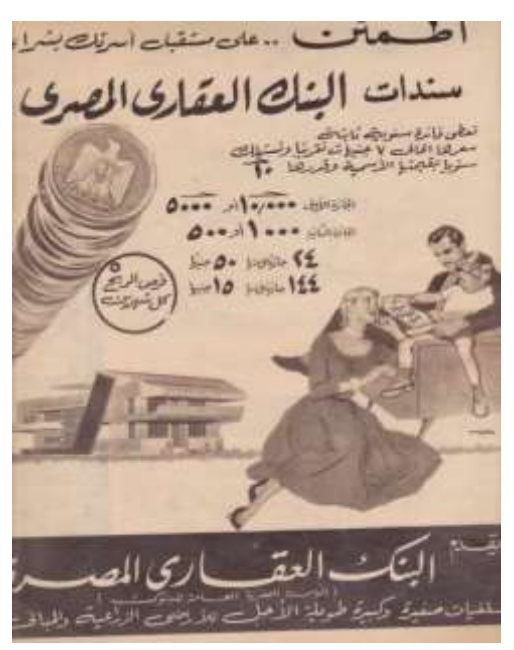
Figure (1) women are represented as in a less status than men

It is common through history of advertising in Egypt that women and men are represented in an unequal manner. Knowing that people who receive ads perceive it as if they are real without being critical, in addition to the impact of gender portrayal in advertising on the Egyptian audiences. Although Egypt for long time has been regarded as one of the most liberal countries of the middle east, advertising in Egypt has portrayed women in a stereotypical manner; where women are presented "as psychologically and physically defenseless, while males are overwhelming them (Stankiewicz & Rosselli, 2008)."