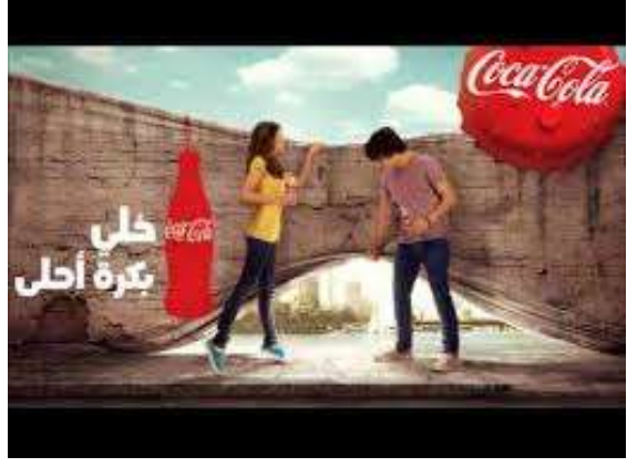
Figure (2) women and men are represented equally

Recent years especially after the 25<sup>th</sup> of January revolution, gender representation has shown significant change in the stereotype of portrayal of women particularly in digital advertising. The revolution has contributed to a social and cultural shift in the role of gender and its stereotypical presentation in social media as a digital platform of digital advertising. The availability of the technology and the great contribution of Egyptian women in the up rise, led to an evolutionary representation of gender stereotype.