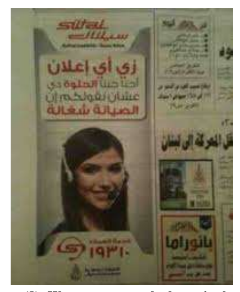
Figure (8): Women as sex tools shown in the text

Stankiewicz & Rosselli, (2011) asserted that Exposure to sexually objectifying advertisements of women produces "anti-women attitudes" and negative stereotypes. For example, the belief that females are only precious as tools for the aspirations of males, that a true man has to be sexually violent, that cruelty is "erotic", and that females who are victims of a sexual attack "asked for it". Females' portrayal as sex tools and presenting them as victims of violence emphasizes the belief that obedience and surrender are inherent attributes in females.