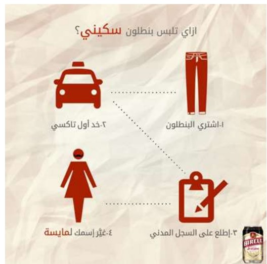
Figure (10) Birell Ad Man Up (be a man) 2009