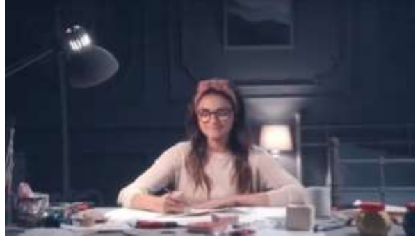
Figure (6): Women in recent occupations