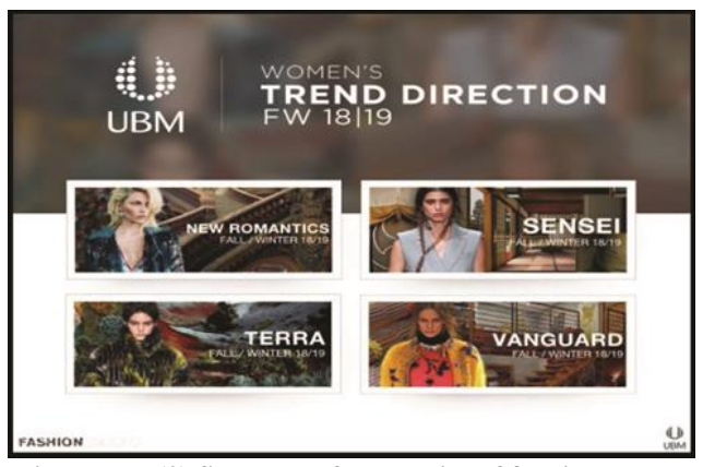
Figure No. (2) Shows the four stories of fashion trends