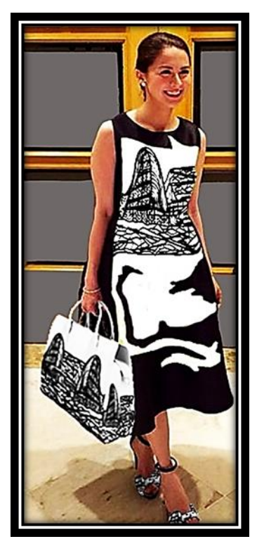
Employment (1- C) Women's clothing with Employment Outfit Supplements