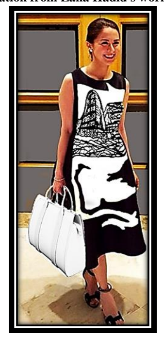
Employment (1- A) Women's Clothing