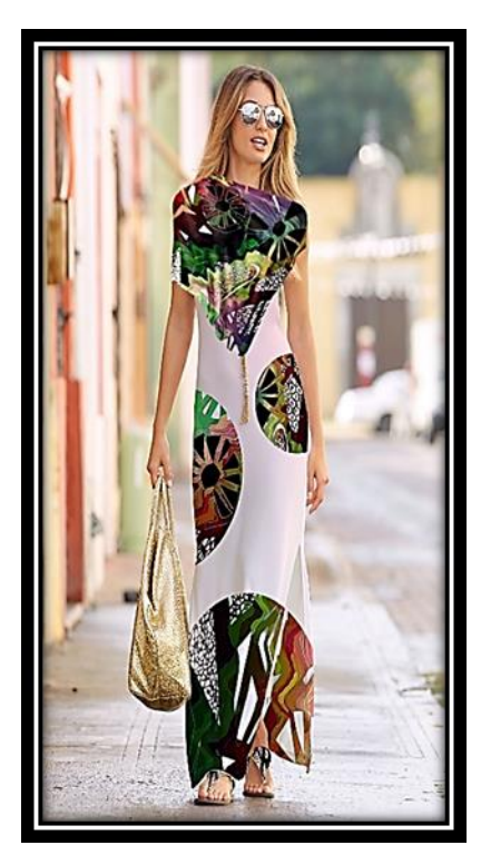
Employment (2- C) Women's clothing with Employment Outfit Supplements