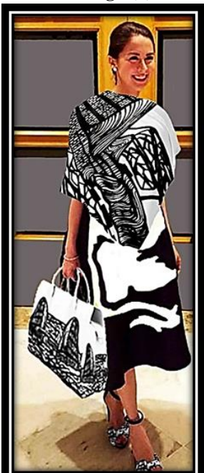
Employment (1- B) Outfit Supplements