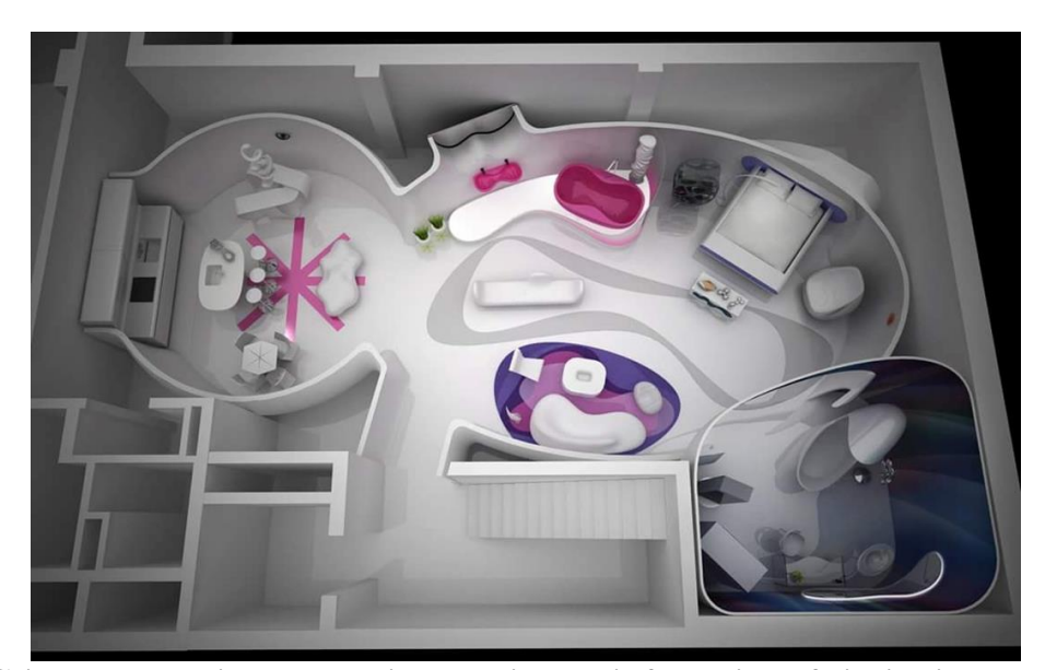
Picture 3) illustrates a design by the designer Karim Rashid for the idea of distributing the brushes in a studio with a streamlined idea and furniture in harmony with the architectural line of design