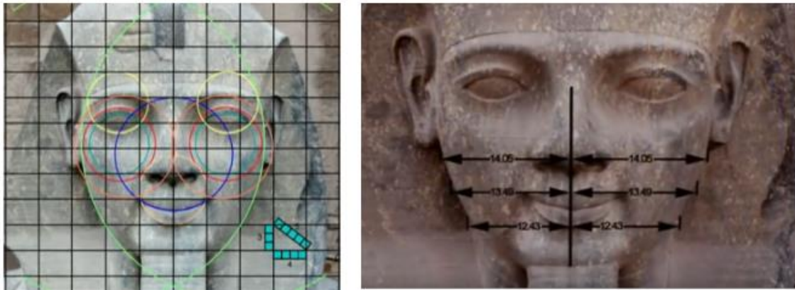
Pic5 - symmetry of statues in Egypt, (Dunn 2010)

Christopher Dunn re-examined other statues of Ramses II in Memphis and the British Museum to come to the same conclusion, the perfect symmetry between the two halves of the face. [5] Ancient inscriptions show the great relationship between humans and the universe through the sun, moon, stars, cosmic energy paths and everything they knew about astronomy at that time. [15]