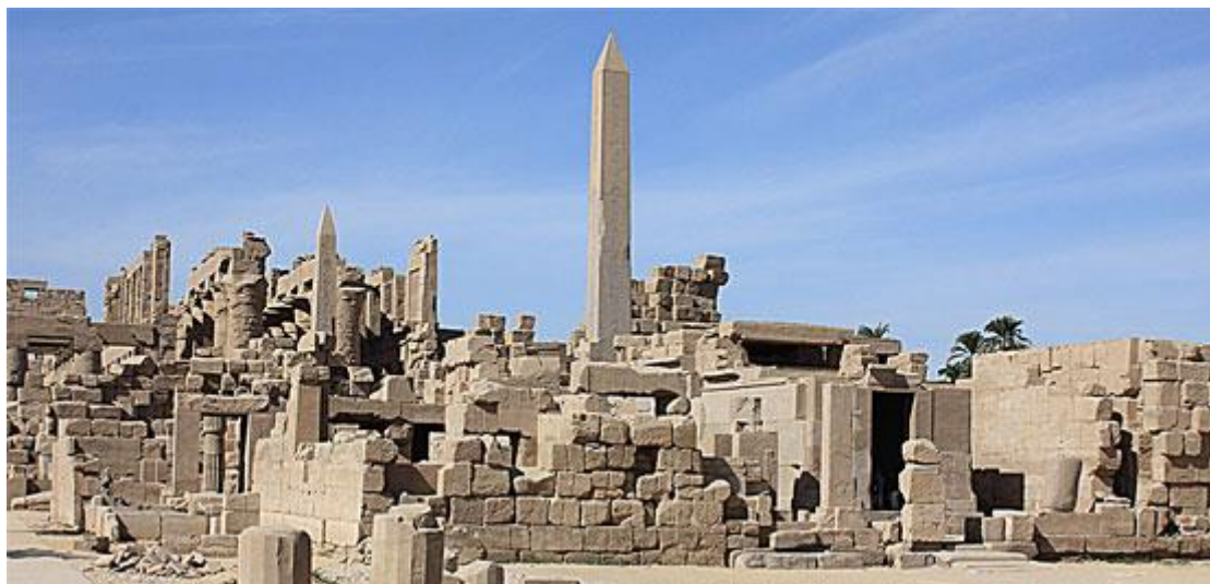
Pic1- Temple of Karnak, https://en.wikipedia.org/wiki/Karnak

Due to the availability of materials, the Egyptians have reached advanced methods of exploration of stones and minerals, transporting, lifting, cutting and polishing, which led to the advantage of Egyptian architecture by the giant scale. The Pharaonic large forms, whether a pylon or an entrance, are huge in their details because they are relatively weak sandstone in the formation. [11]