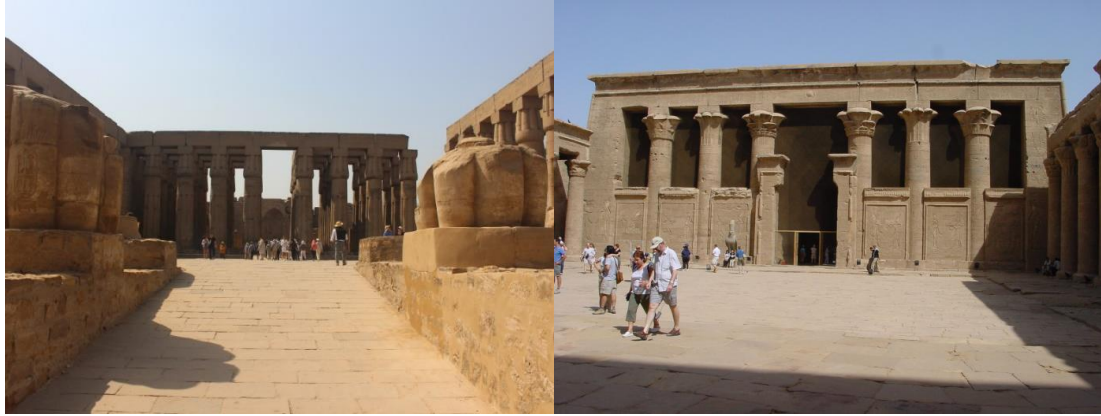
Pic2,3- Luxor temple https://en.wikipedia.org/wiki/Luxor_Temple

As the effect of winds and their direction appeared on the shape of the building plans, the wind catchers appeared to exploit the desired winds. The ancient Egyptian also took care of providing stone barriers in the cooking areas in residential buildings.