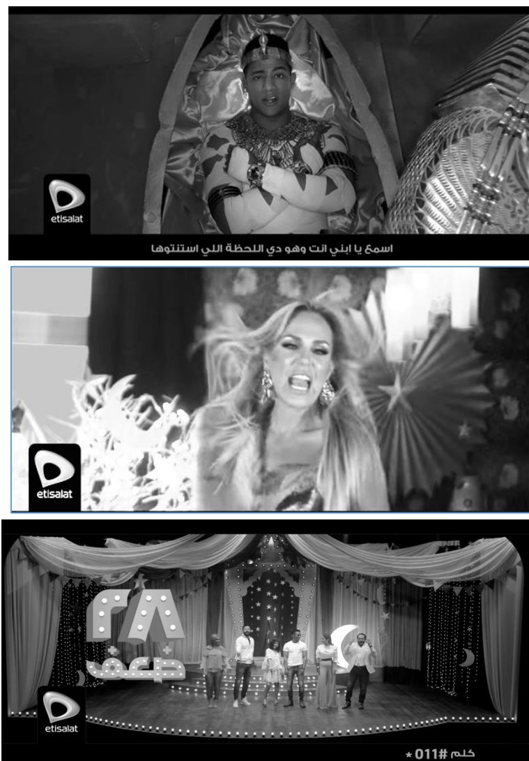
Figure (3) Second Model Advertising Campaign of "Etisalat" Egypt, Etisalat (2018)