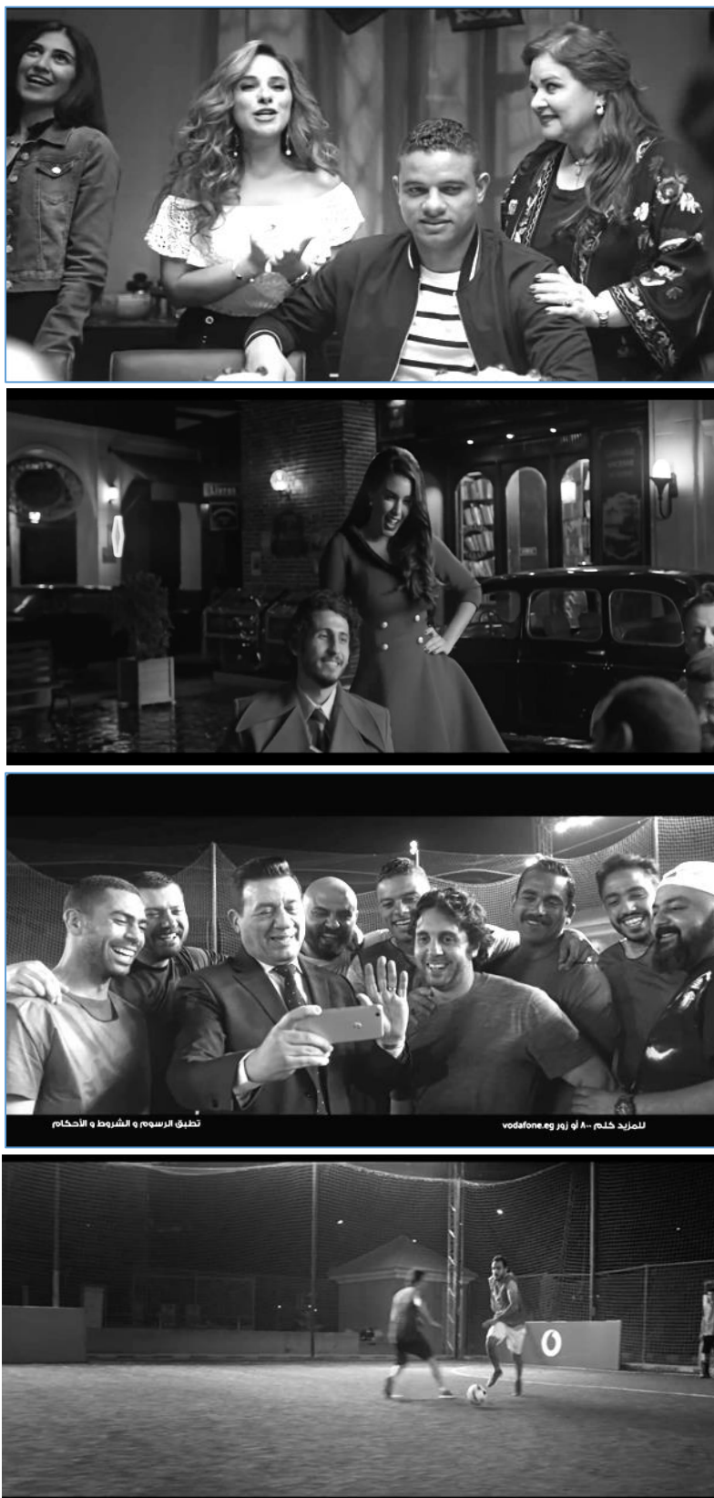
Figure (2) The First Model Advertising Campaign of "Vodafone" Egypt, Vodafone (2018).