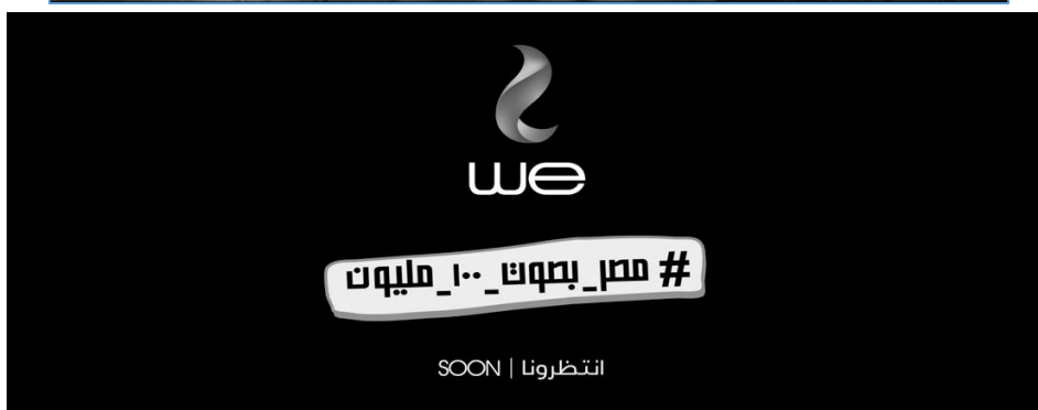
Figure (5) Fourth Model Advertising Campaign of "WE" Egypt, We (2018)