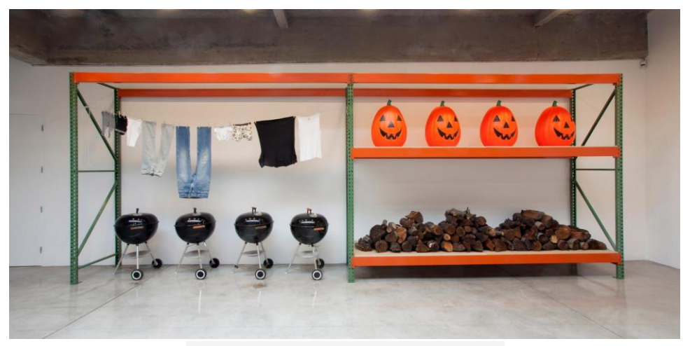
Haim Steinbach, Backyard Story (1997)

Other artists, like <u>Haim Steinbach</u><sup>9</sup>, have crafted visual languages that place everyday goods in arrangements that use repetition and formal contrast to push even further the idea that artist's role is to select items and serve them up in unexpected or meaningful juxtapositions. Steinbach is an American artist known for his precise arrangements of found objects on shelves. Working within the tradition of <u>Marcel Duchamp</u>, Steinbach explores the role of the artist as a collector and curator of cultural artifacts. Over the decades, Steinbach's project has grown to explore collecting as a psychological state of mind, while also acting as a barometer of consumer culture.