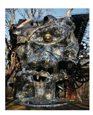
Le Cyclop, 22.5. m tall made of recycled materials