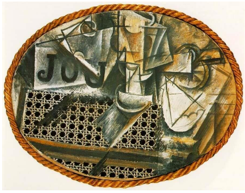
Still-Life with Chair Caning, 1912 by Pablo Picasso

In the 1900s that artists began to incorporate found objects into sculptural works as an artistic gesture. For example, Pablo Picasso 's Still Life With Chair Caning from 1912<sup>6</sup>, for example, the artist collaged a piece of woven chair backing onto a two-dimensional canvas, and before that Degas clothed his Little Dancer of Fourteen Years (1881)<sup>7</sup> in a real tutu. The term "found object" is a literal translation from the French objet trouvé . In art, this meant objects or products with no artistic functions that are placed into an art context and made part of an artwork. The readymade artworks represent an updated version of that idea.