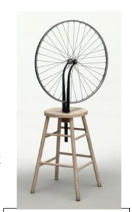
Duchamp Bicycle wheel 2013

Readymade sculpture was inaugurated by Marcel Duchamp. His earliest readymade works included Bicycle Wheel of 1913<sup>1</sup>, a wheel mounted on a wooden stool, and in Advance of the Broken Arm of 1915, a snow shovel inscribed with that title. Four years later in New York, Duchamp shocked the art world with his most celebrated readymade, Fountain , a men's urinal exhibited placed on its back<sup>2</sup>. It was signed by the artist with a false name. For his readymade sculpture, Duchamp deliberately chose ordinary, everyday objects. He invented the term "readymade" for his own art, a term that recently has become more generally applied to artworks made from manufactured objects.