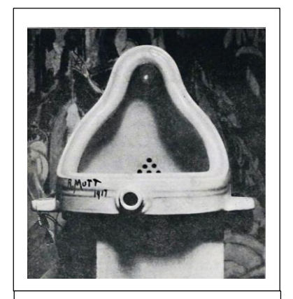
M. Duchamp, Fountain 2017

Readymade art provokes the viewers and engages them in thinking about the meaning of the object and the meaning of art itself. By turning the wheel into a sculpture, Duchamp made it, as in other artworks, e.g., a marble statute, untouchable. Duchamp's selection of a urinal that he signed by the name of "R. Mutt" and titled Fountain , triggered conflicting reactions varying from its function in ordinary life as a "urinal" to the