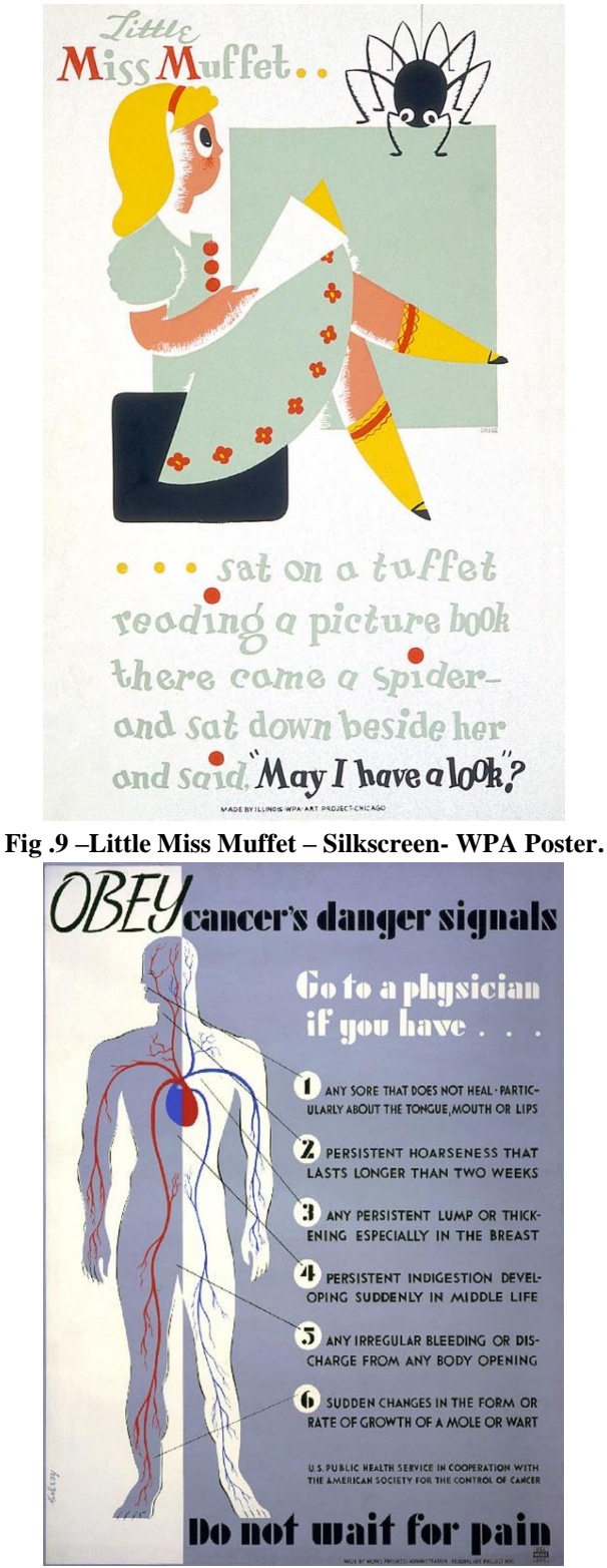
Fig .10 - Cancer Danger Signals- Silkscreen- WPA Poster.