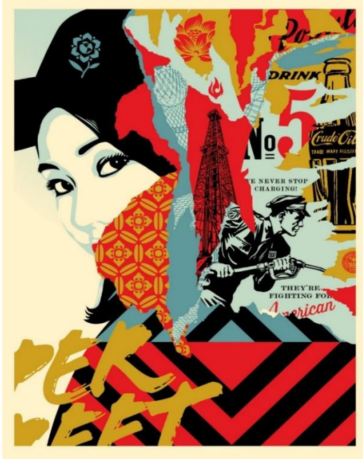
Fig .16. Shepard Fairy – Drink Crude Oil 2 – Silkscreen - 60.96 x 45.72 cm – 2007.

By 2008 Shepard Fairy was one of the main political supporters for the American President Barack Obama, and perhaps he is best known for his Hope (2008) campaign, which portrays a portrait of then-presidential candidate Barack Obama with a challenging facial expression in white, blue and red. That poster is widely considered as a contemporary pop art phenomenon. The (Hope) Silkscreen Poster (Fig. 17), has been utilized as the main Poster of the presidential campaign of Barack Obama, this iconic portrait caught the attention of millions during the historic 2008 presidential campaign.