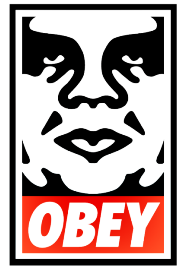
Fig .12- Shepard Fairy – OBEY – Silkscreen on T-shirt - 2001.