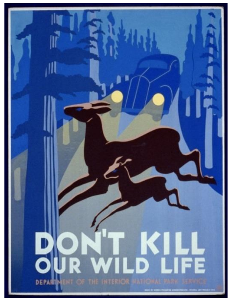
Fig .8 – Don't Kill our Wild Life – Silkscreen -WPA Poster.