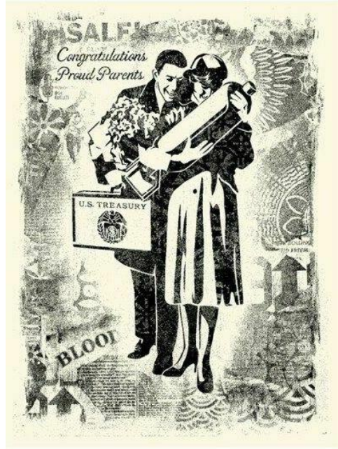
Fig.13- Shepard Fairy – Proud Parents- Lithography-60.96 x 45.72 cm.