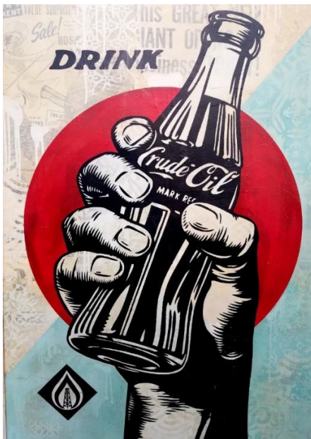
Fig .15- Shepard Fairy – Drink Crude Oil 1 – Silkscreen - 60.96 x 45.72 cm – 2007.