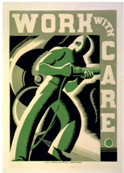
Fig. 2- Work with Care, - Silkscreen-WPA Poster.