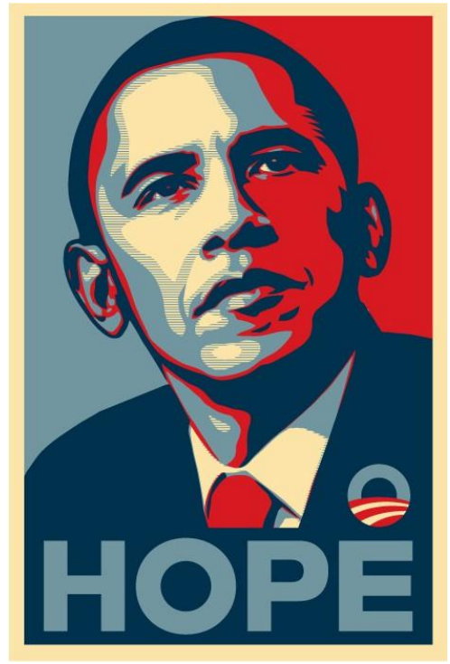
Fig .17. Shepard Fairy – Hope– Silkscreen - 60.96 x 45.72 cm – 2008.

In 2016 after the election of the American president Donald Trump, Shepard Fairy produced his Silkscreen Poster (DEMAGOGUE) (Fig 18), in which he condemns the fear tactics adopted by Trump. The print represents the mouth of Trump during one of his angry speeches. In 2017, the artist created a series of posters featuring portraits of culturally diverse women, again using a red, white, and blue color scheme in response to the racist rhetoric of President-elect Donald Trump. Fairy has also responded to the recent rise of Islamophobia in the United States by producing a silkscreen poster titled (We the People are Greater than Fear) (Fig 19s), in which he depicts an American Muslim woman. The We the People campaign aims to restore hope, imagination, curiosity, and creativity into our country's dialogue. Ridwan Adhami decided to photograph a Muslim woman putting an American flag as a hijab for the fifth anniversary of 9/11. They stood at the site of the World Trade Center, capturing the iconic image. As the Trump administration's Muslim Ban continues to wage a war on Islamic faith, the artwork's message will keep ringing loud and clear. There is no room for fear, only freedom.