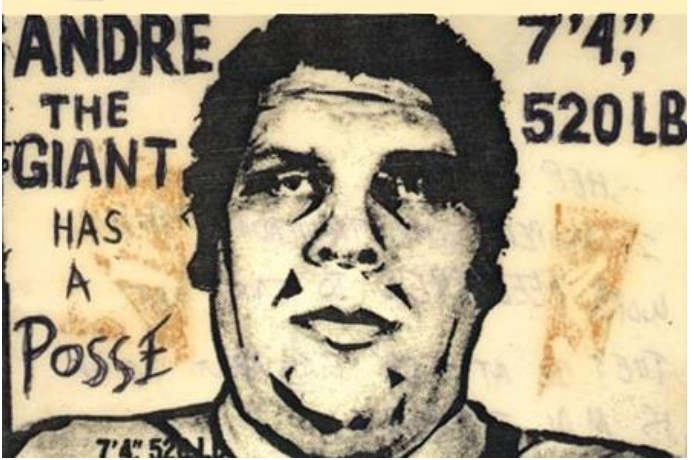
Fig.11. Shepard Fairy – André the Giant Has a Posse– Silkscreen - 60.96 x 45.72 cm – 1998.