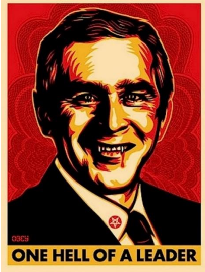
Fig 14. Shepard Fairy – One Hell of a Leader – Silkscreen - 60.96 x 45.72 cm – 2004.