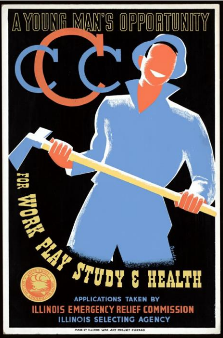
Fig. 3- Work , Play , Study & Health – Silkscreen-WPA Poster.