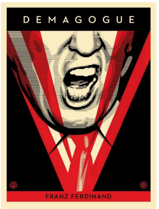
Fig .18. Shepard Fairy – DEMAGOGUE– Silkscreen - 60.96 x 45.72 cm – 2016.