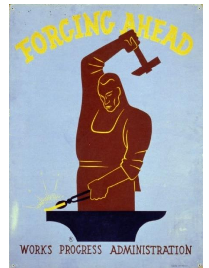
Fig. 4- Forging Ahead – Silkscreen-WPA Poster.