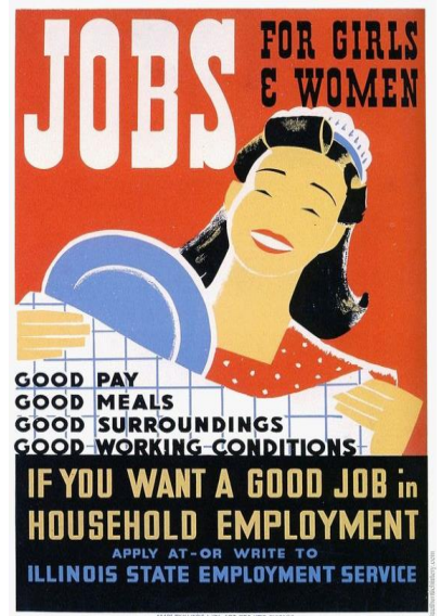
Fig. 1- Work , Play , Jobs for Girls & Women – Silkscreen-WPA Poster.

The WPA project has also opened the doors for the Art Social activism, a continuing movement in contemporary America Art. Nowadays many American Printmaking Artists use their art as a tool to implement social and/or political transformations; one of the most prominent examples of those artists is Shepard Fairy.