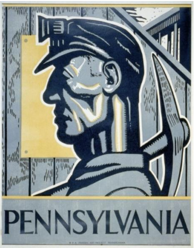
Fig 5. Pennsylvania – Lincocut - WPA Poster.