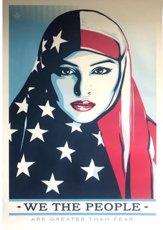
Fig. 19. Shepard Fairy – We the People Are Greater than Fear– Silkscreen - 60.96x45.72 cm –2017.