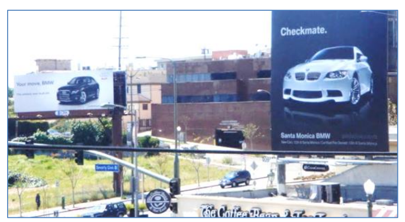
"Figure 5 - Ambush Ad 03 - BMW vs. Audi"

https://www.wordstream.com/blog/ws/2018/04/04/ambush-marketing - (Accessed 16.06.2020)