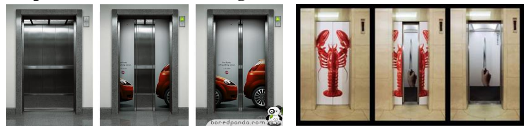
"Figure 22 – Elevator Advertising Strategy"

https://www.boredpanda.com/33-cool-and-creative-ambient-ads/ - (Accessed 15.06.2020)