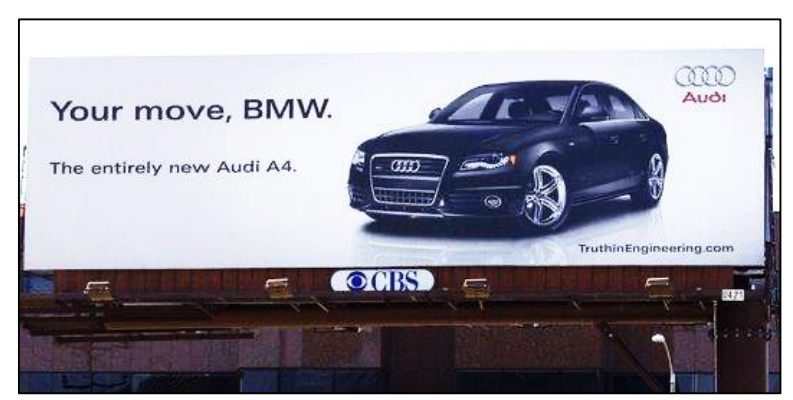
"Figure 4 - Ambush Ad 02 - Audi vs. BMW"

Not long after the billboard above appeared in Santa Monica, Audi doubled down and erected another giant roadside provocation to BMW, while cleverly sticking to BMW's regrettable chess theme: