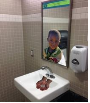
"Figure 23 - Bathroom Advertising"

\frac{https://www.pinterest.com/search/pins/?q=creative\%20bathroom\%20ads\&rs=typed\&term\_meta[]=creative\%7Ctyped\&term\_meta[]=bathroom\%7Ctyped\&term\_meta[]=ads\%7Ctyped - (Accessed 16.06.2020)