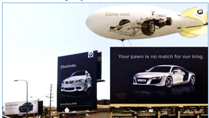
"Figure 6 - Ambush Ad 04 - BMW vs. Audi"

After BMW erected its "Checkmate" billboard response, Audi upped its game again by launching yet another billboard ad with yet another witty chess-related quip. Ultimately, BMW won the day with its final, withering response.