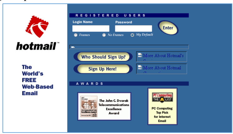
"Figure 9 - Hotmail Viral Marketing"

Hotmail "Figure 9": Hotmail is one of the most classic examples of successful viral marketing. They offered free e-mail to the masses, and simply attached a signature at the bottom of each e-mail message that promoted their free service. Every single e-mail sent by a Hotmail user contained this message, thus spreading it like a virus. Recipients would see the ad, and as a result, they too signed up for Hotmail.