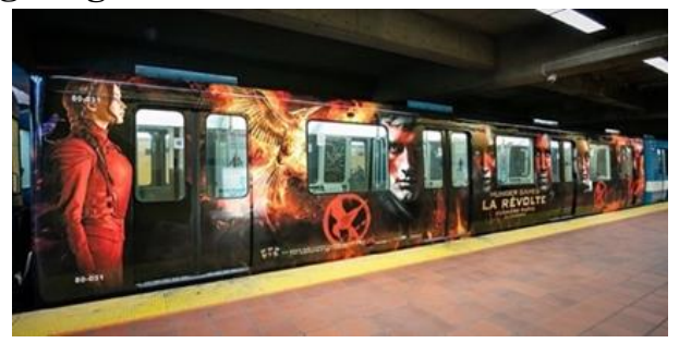
"Figure 24 - Transit Advertising"

http://localadvertisingjournal.com/transit-advertising-need-know-transit-advertising/ - (Accessed 16.06.2020)