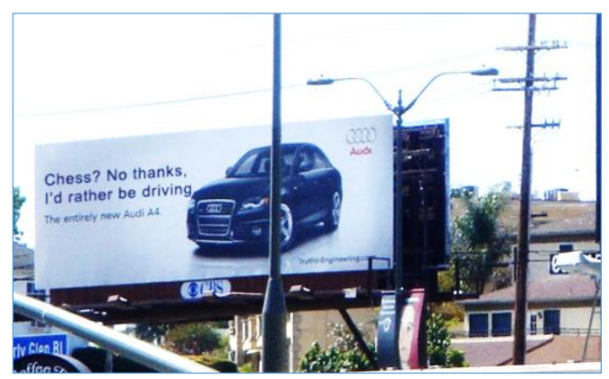
"Figure 3 - Ambush Ad 01 - Audi vs. BMW"

BMW rally with two nearby service centers. What's next, paramedics at a chess tournament?". Audi saw an opportunity to capitalize upon BMW's campaign. In response to BMW's ads, Audi purchased a billboard in Santa Monica advertising its new A4 sedan and mocking BMW's slogan.