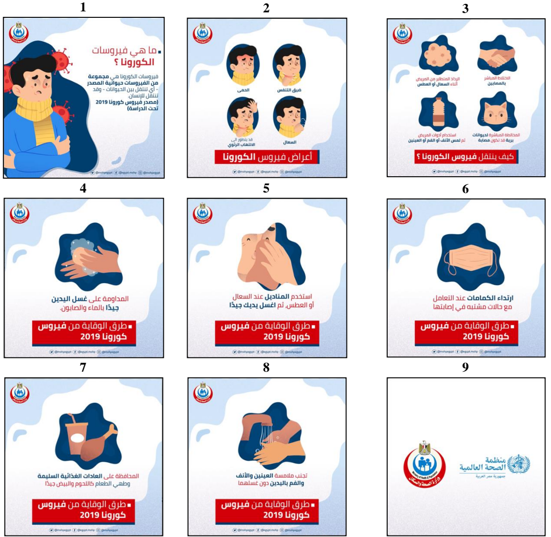
Figure (2) Shows the Motion Infographic for Covid-19 by The Egyptian MoHP

Duration: 53 seconds. Size used: 1080x1080 pixels.