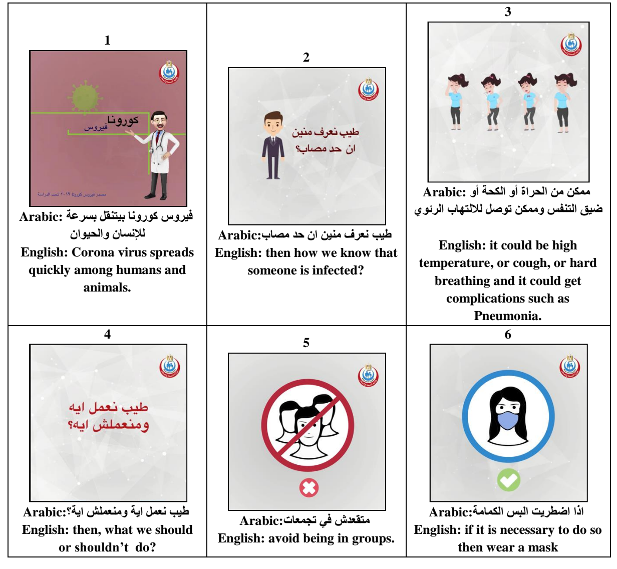
Table (2) Motion Infographic Design for Covid-19

Finally, URL of the Egyptian MoHP webpage and of Egypt care page are written for more information.