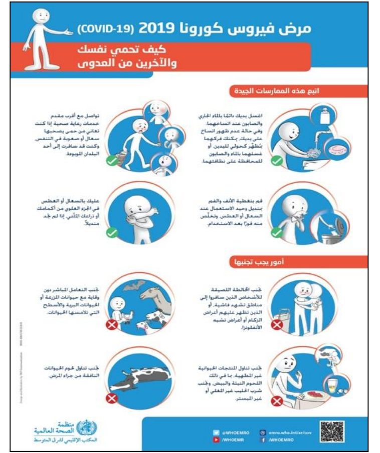
Figure (1) The Static Infographic for Covid-19 by the Egyptian MoHP

In this stage, the topic is awareness content about Covid-19 virus. The researcher has chosen two Infographic ads. one is static and the other is motion Infographic design that has been already on their websites. They have been chosen due to the date of posting them as they are in the first period of the Ministry's health campaign. Also, they contain the same information which is "How could the virus be transmitted?" "What are the symptoms?" "What are the methods of prevention?" And finally, there is a sample to represent two kinds of Infographic that indicates that there aren't any interactive Infographic advs. used on its websites, the Facebook page or on Egypt Cares page; consequently, the research will design one Interactive Infographic.