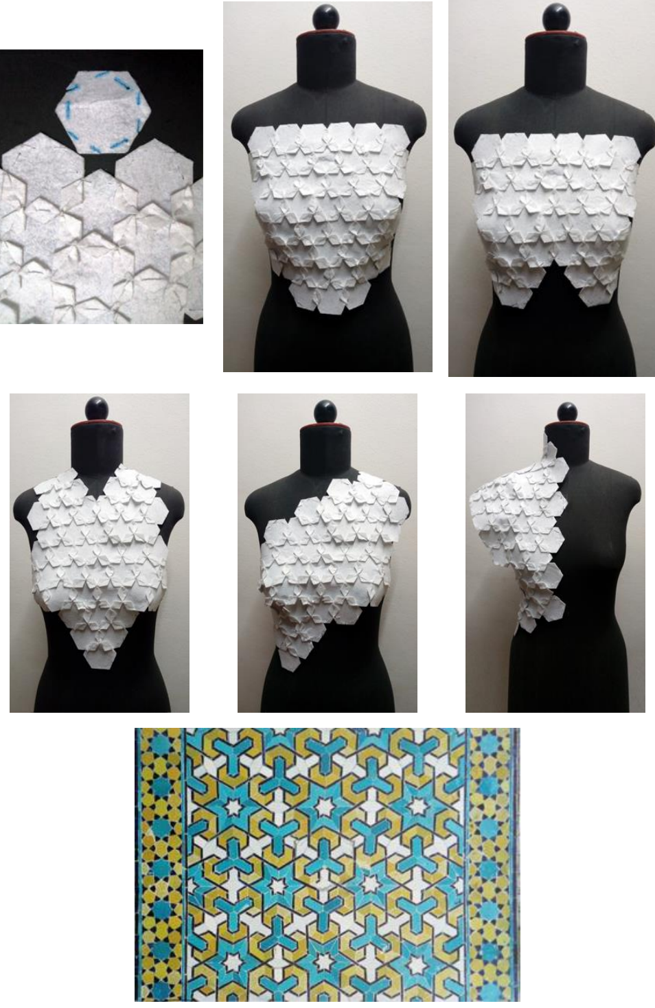
Fig (7): mosaic Madar.Ishah Madrasa, Isfahan (Iran)-1704