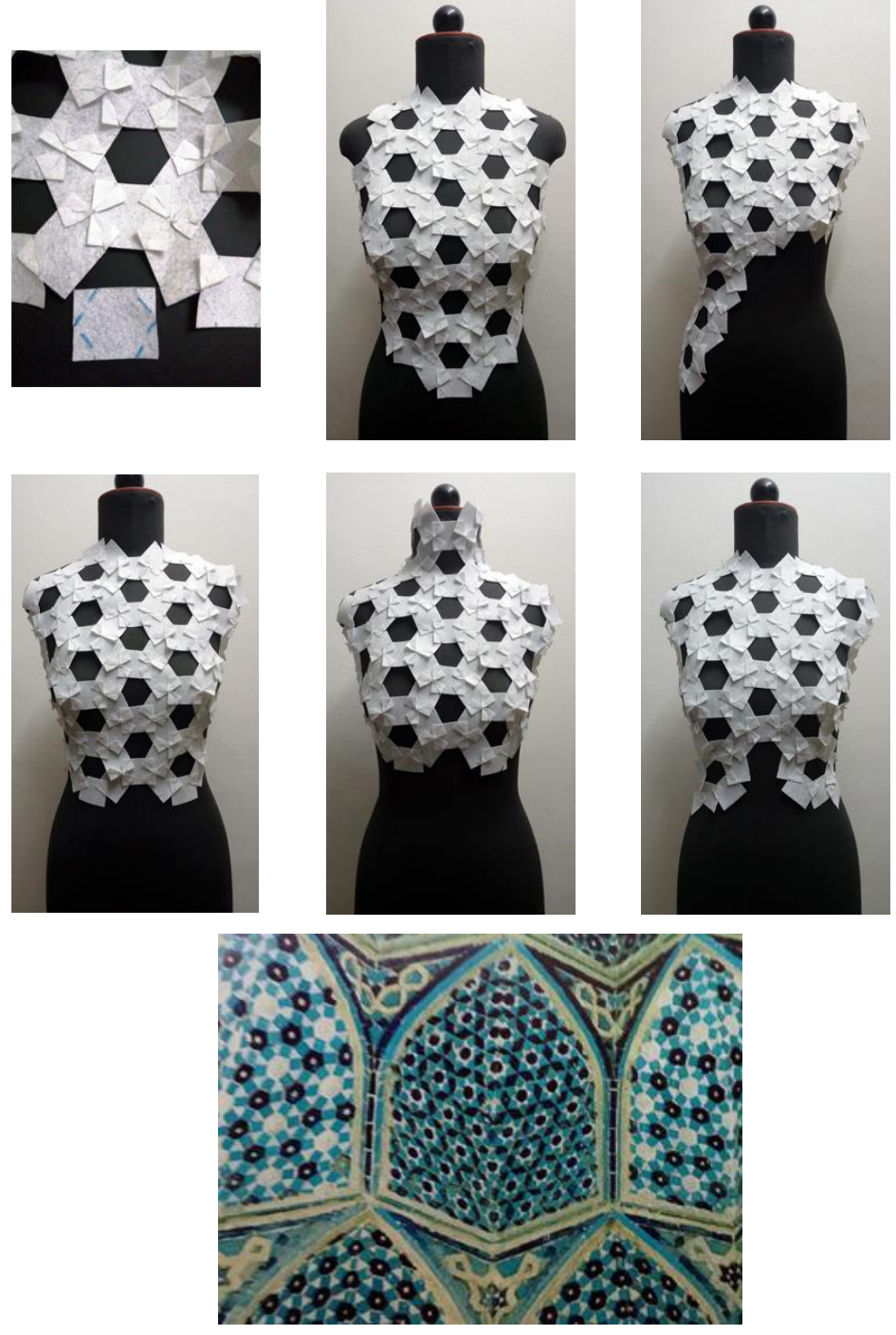
Fig (5): A rhomb bitrihexagonal tiles.