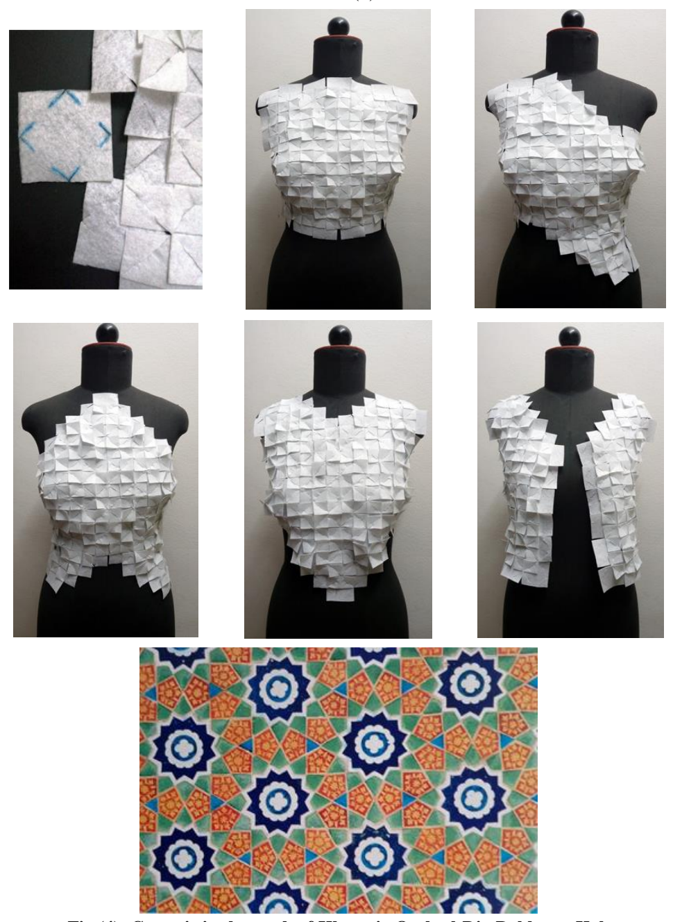
Fig (4): Ceramic in the tomb of Khawaja Qutb-al-Din Bakhtyar Kak

The modular shown in figure (1B) was developed from square (a), the modular units have two slots in two edges and two tabs in another two edges, when (five) modules are interlocked, tabs combined forming/ square unit as second layer of fabric tessellation as (b), as locking process enables the extension of checker board structure (c).