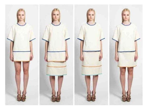
Fig (1): example of modular design consists of multiple pieces.

(2) The garment shape and structure depend on pattern of repeating unit which could be combined to create larger fabrics that can enable the user to use it to become induced in customizing the design of garment as Balgooi and Soeploor's, they have created "fragment textiles" (2009). Fig(2)