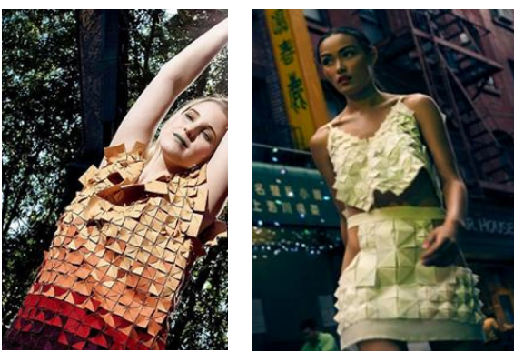
Fig (2): example of fragment textiles.

(2) The garment shape and structure depend on pattern of repeating unit which could be combined to create larger fabrics that can enable the user to use it to become induced in customizing the design of garment as Balgooi and Soeploor's, they have created "fragment textiles" (2009). Fig(2)