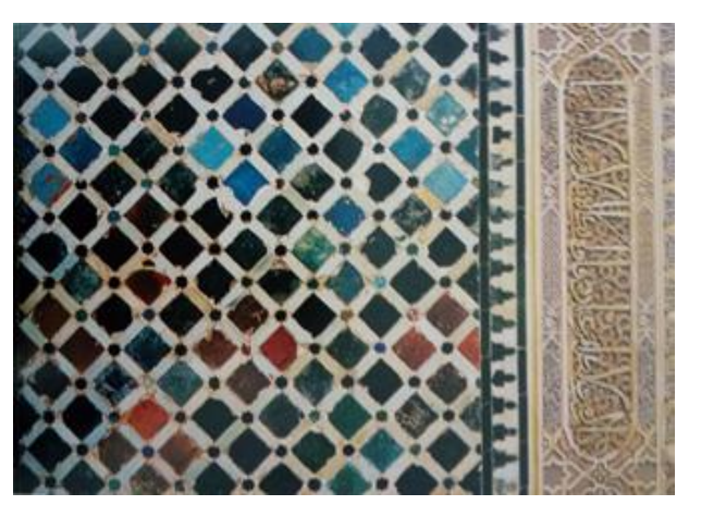
Fig (3): The Alhambra, Granada Spain, checkerboard Zellij wall paneling topped with inscriptional decoration in Stucco. Patio de in Alberca.