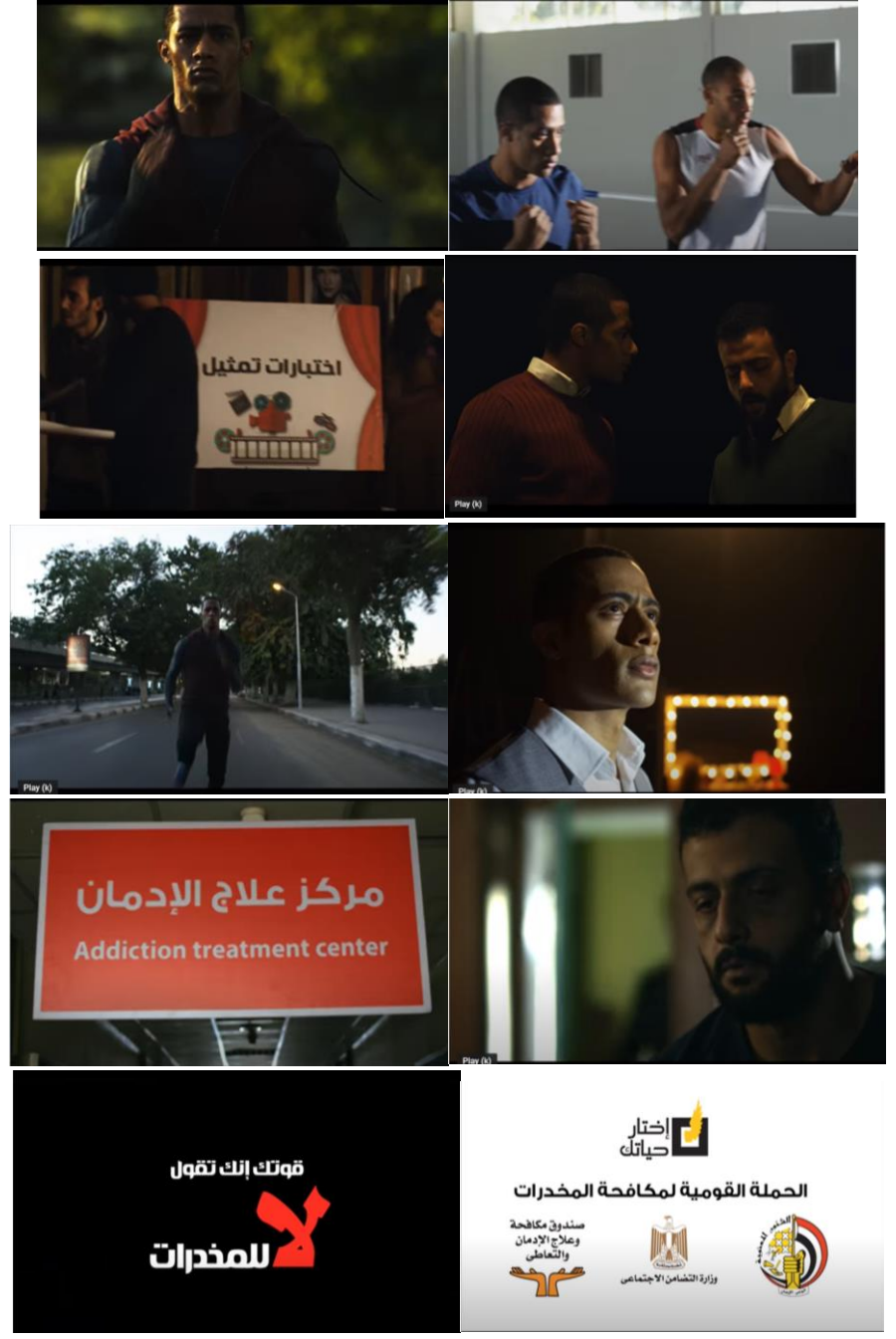
Fig. 3The second advertisement of the campaign "You are stronger than drugs" by Mohamed Ramadan

A survey research design was adopted for the study and a questionnaire- was designed, keeping in view the objective of the study- has been used as a data collection tool.