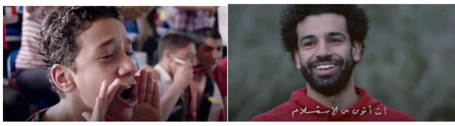
Fig. 2 The first advertisement of the campaign "You are stronger than drugs" by Mohamed Salah