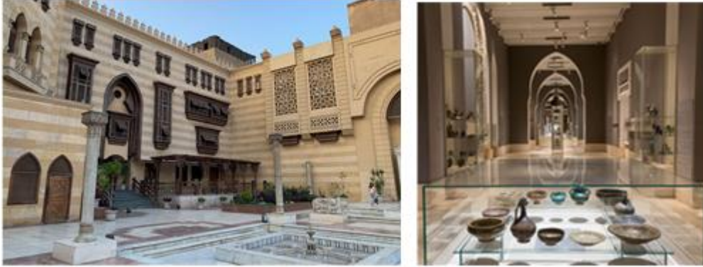
Figure (2): Museum of Islamic Art, Cairo. Inner courtyard and one of the interior halls.

According to the mission and the vision of the museum, it aims to display, preserve and interpret Islamic artifacts, and to reach a maximum number of national and international visitors ( For more details see Museum of Islamic Art, Official website ).