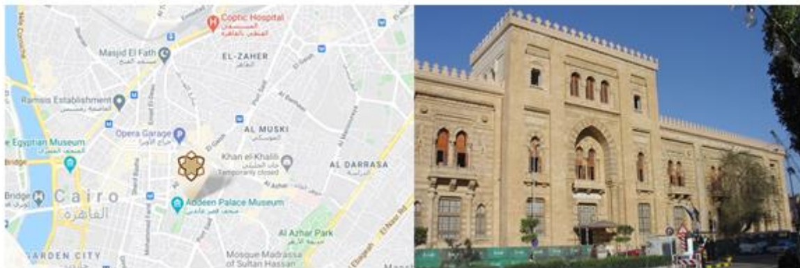
Figure (1): Museum of Islamic Art, Cairo. Location and main façade.