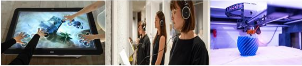
Figure (3): Using tactile exhibitions, audio description and 3D printed copies are developing and enhancing visually impaired visitors' experience.

Indeed, being able to touch museum artifacts is not a new concept (Figure 4). The Victoria and Albert Museum in London (V&A) has been offering tactile sessions for visually impaired visitors since 1985. The museum runs special events throughout the year which cater to this audience. The program changes often and focuses on a variety of the museum's collections. This strategy encourages visual impaired visitors to come back for repeating visits and enjoy new experiences (For more details see, Ginley, 2013).