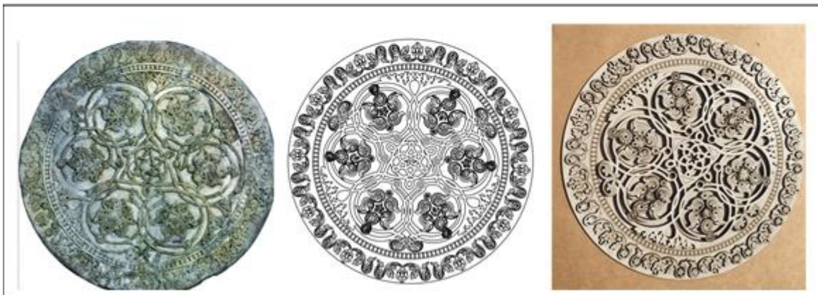
Figures (6), (7) and (8): The original artifacts (to the left side), the digital drawing (in the middle) and the applied copy (To the right side).