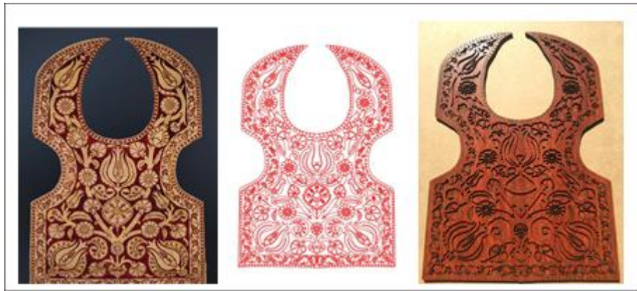
Figure (5): The original artifacts (to the left side), Digital drawing (in the middle) and the applied copy (To the right side).

The project become real and the roles were determined. Dr. Walaa sent to the author pictures of many museum's artifacts and communicated with many for sponsoring. The author selected the most suitable pieces, then presented and discussed the idea with a group of distinguished students who agreed and worked under his supervision on converting the pictures into technical measurable digital drawings that can be dealt with by digital drilling or cutting ... (Figures 5-14). The project was running with the trials of digital drawing (which modified many times), carving and inlaying where the decision of the author (the project supervisor) is to select the flattest surfaces artifacts (2D objects) as a beginning stage then moving to the 3D objects which needs more efforts, trials and costs.