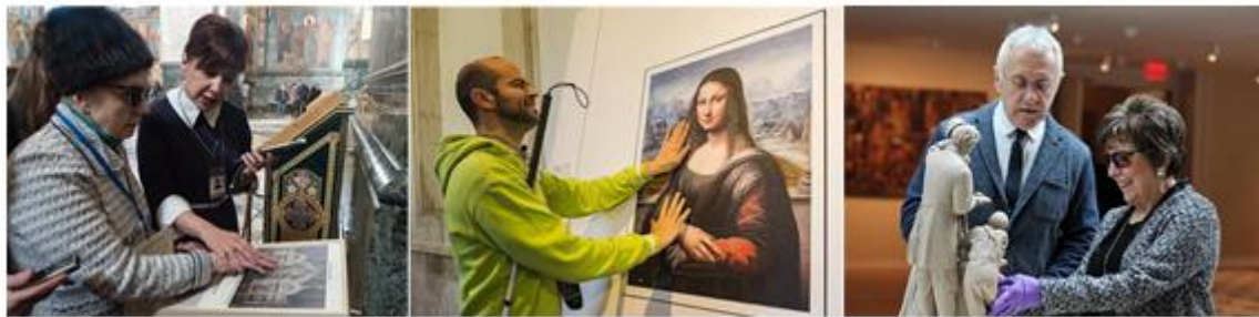
Figure (4): Being able to touch copied artifacts is not a new concept which is applied in many museums worldwide to help visually impaired visitors.

Indeed, being able to touch museum artifacts is not a new concept (Figure 4). The Victoria and Albert Museum in London (V&A) has been offering tactile sessions for visually impaired visitors since 1985. The museum runs special events throughout the year which cater to this audience. The program changes often and focuses on a variety of the museum's collections. This strategy encourages visual impaired visitors to come back for repeating visits and enjoy new experiences (For more details see, Ginley, 2013).