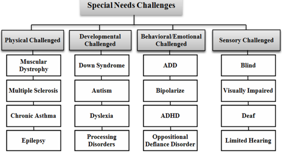
Figure 2, Forms of Special Needs Challenges and their manifestations