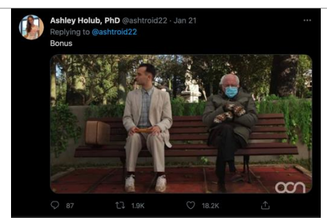
Figure 14 Bernie's image is photoshopped in a master scene of "Forrest Gump" movie [28]