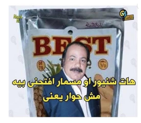
Figure 7 an Internet meme shows how whimsical content look like using a poorly Photoshoped images together, to relate between a certain product (Best Juice) and the experience while using it. [5]

Another group of memetic photos pictures people in the midst of a physical activity such as running or dancing. These photos feature both celebrities and ordinary people, who are captured during an intense movement that is "frozen in time" through photography.