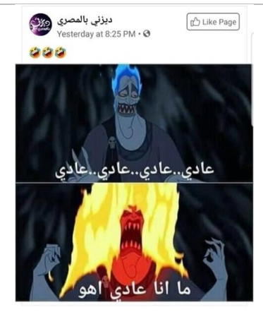
Figure 11, an example using Etisalat's TV commercial and altered it visually [12].

As mentioned previously, the widespread viral piece of content triggers people to alter and make their own copy. The Meme's three main features; fidelity, fecundity, and longevity, are obtained. The virality of the content helped to overcome the contextual knowledge to understand the message in the produced memes.