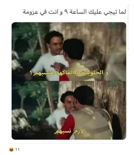
Figure 9 A meme relates to the Lockdown because of coronavirus and Ramadan's Egyptian traditions [25].