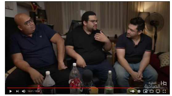
Figure 4 a screen shot from one of Afifi's video on YouTube [11].

It was found that Men were the leading characters in twenty-four out of the thirty videos in Shifman's study [19], while only three videos featured women as protagonists. The men's representation in contemporary mass media genres, particularly the sitcom, responded to society and what so-called crisis of masculinity in society. This "crisis of masculinity" leads to presenting far-from-perfect men, who fail to