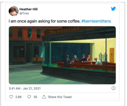
Figure 13 one of the memes that merged Bernie's image with an artwork [27].

The senator's campaign store took advantage of what happen and released a sweatshirt featuring the meme with 100% of proceeds going toward Meals on Wheels Vermont [27].