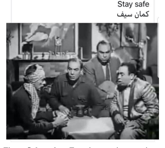
Figure 5 shows how Egyptian uses incongruity to relate between two incongruent elements showed in the pun [21].