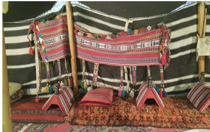
Figure (5): A seating arrangement with a Zoleyah on the floor mattress, a Masnad (pillow), three (3) Shedads (camel saddles) to be used as arm resting cochins, and a wall hanging decoration.