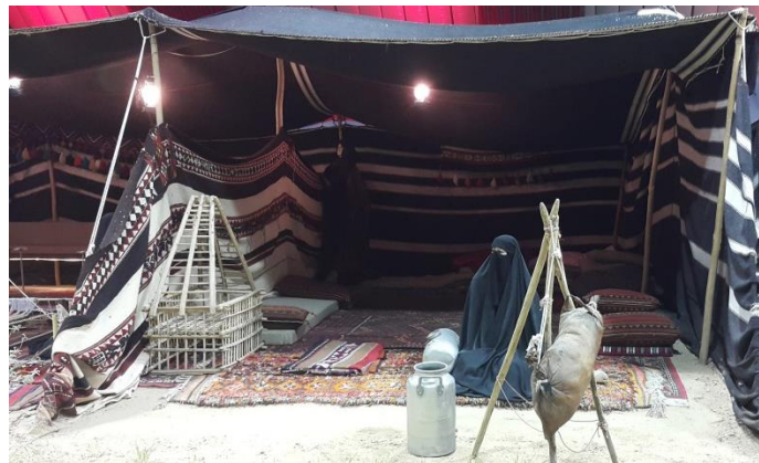
Figure (3): A tent divider “Qatta” is used in Bait-al-Sha'ar to separate the men's quarter from the women's quarter.