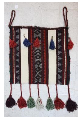
Figure (9): Adel.