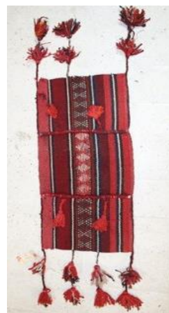
Figure (8): Kharj.