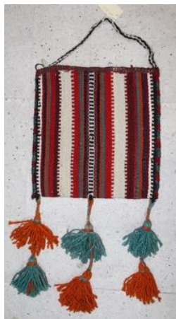
Figure (7): Mezwadah.