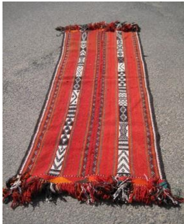
Figure (4): Besat (Runner).

Although the full construction of Bait-al-Sha'ar is not quite complicated, yet, it has its unique construction procedure. After sewing all the different parts of Bait-al-Sha'ar in their proper places, the roof of Bait-al-Sha'ar is laid on the ground and all its ropes are stretched away from the Bait each in its proper direction. One side of the roof