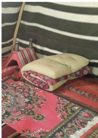
Figure (6): Firash (Mattress).