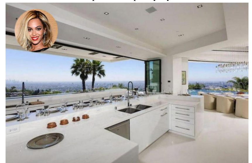
Picture no (15) shows the kitchen of famous Beyoncé based on the thought of ultramodern.

In Jennifer Lopez's Manhattan apartment, the kitchen was designed by the renowned Italian design company Arklenia, without the owner's touches, represented by a green plant. There, the vaults look hidden, while the pair of stainless steel shelves, with two shelves dishes and cups on the island, are converted to the simple contemporary style.