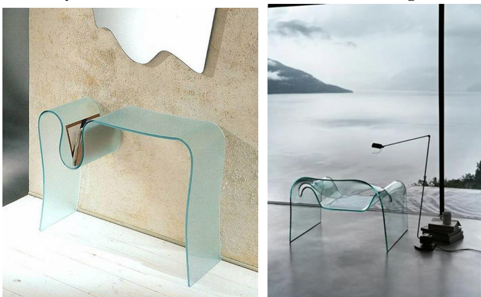
picture (5,6) shows two models of tables designed by Italian designer Bardini It made of glass with the ripple design lines of ultramodern thought