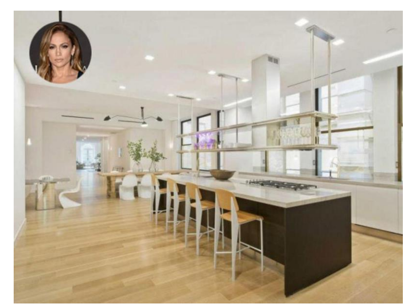
Picture no (14) showing the kitchen of famous actress Jennifer Lopez based on the thought of ultramodern

In Jennifer Lopez's Manhattan apartment, the kitchen was designed by the renowned Italian design company Arklenia, without the owner's touches, represented by a green plant. There, the vaults look hidden, while the pair of stainless steel shelves, with two shelves dishes and cups on the island, are converted to the simple contemporary style.