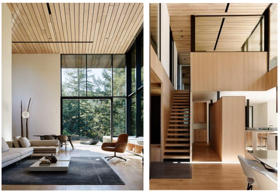
Picture No. (7,8) Emphasis on the visibility of architectural elements and the use of sustainable natural materials, with emphasis on the provision of energy used in expressing the ultramodern though in an Ultra-Modern Home in Orinda, California by Faulkner Architects.