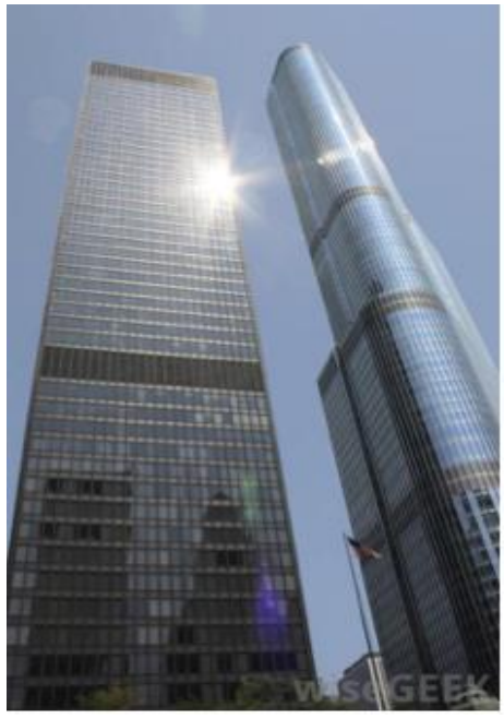
picture no (4) showing the difference between the contemporary architectural style (on the right) and the modern style (on the left)