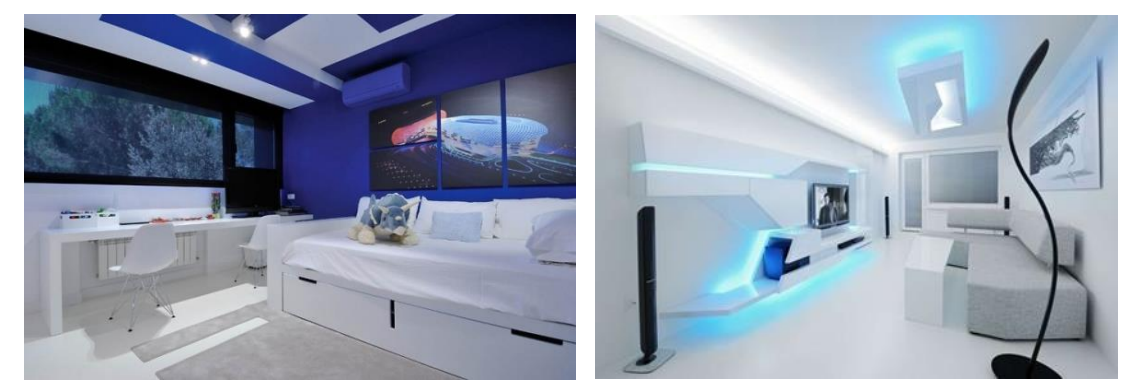
Picture No. (12,13), shows the usage of contrast using (black and white) and (white and blue) and indirect colored lighting in the ultramodern design.