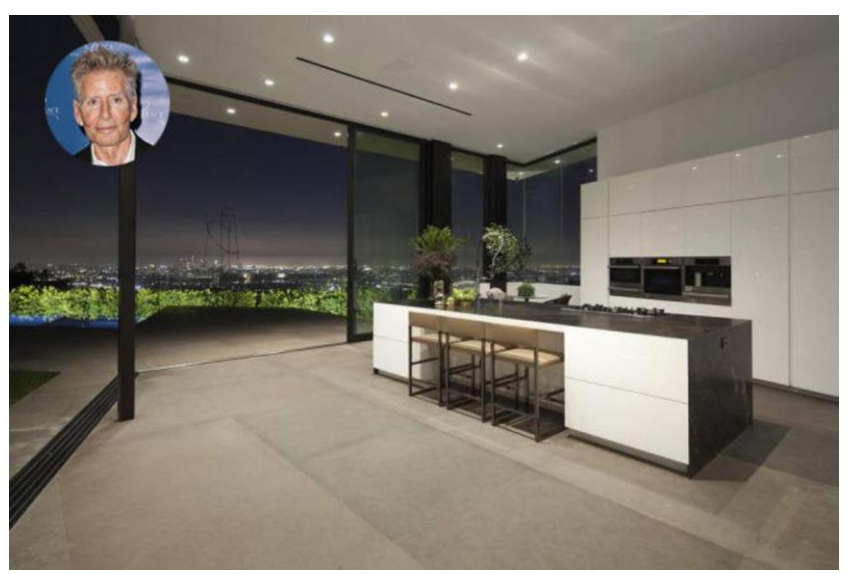
Picture no (16) shows the kitchen of famous Calvin Klein based on the thought of ultramodern

The kitchen is radiating at the home of renowned American fashion designer Calvin Klein in Florida, especially since white controls his shiny lockers. The kitchen has a welcome space, and Isle has a grey surface aligned with electrical tools from the Stainless Steel.