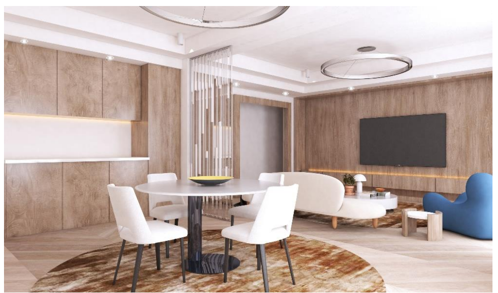
Picture no (17) shows the use of different materials, wood, varnishes, and the most important metals such as stainless

5- The furniture reflects the power and achievements of ultramodern thinking with curved lines, the use of wood, stainless steel, and the installation of interior lighting for some furniture to give them an aesthetic value.