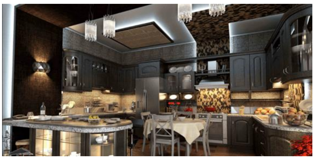
Picture No. (2) shows the most materials which are used contemporary design