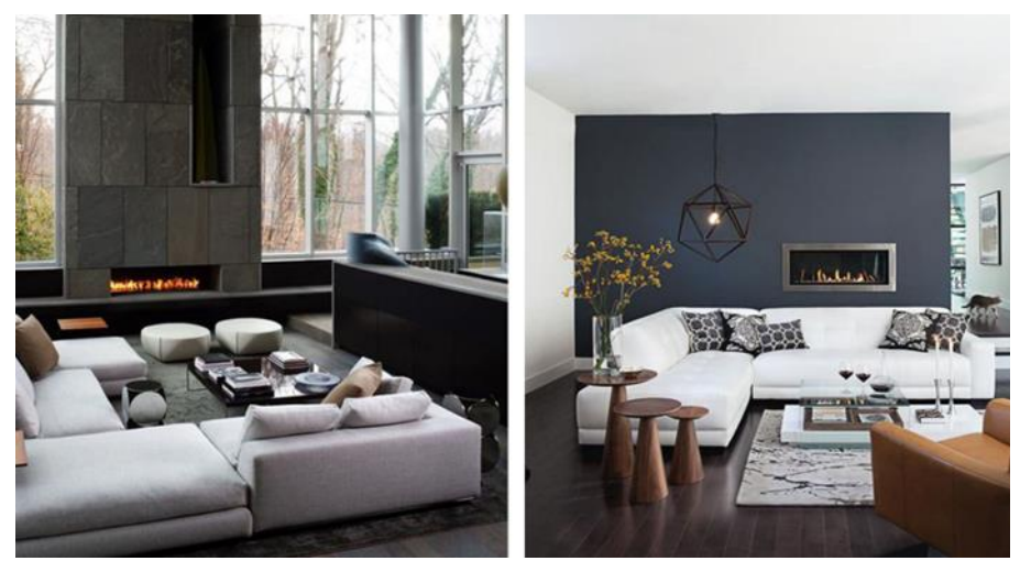
picture No. (3) shows the colors and architectural elements in contemporary design