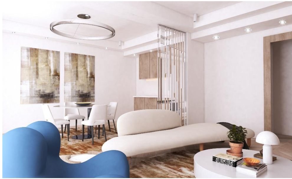
Picture no (18) shows the Use of different colors, white, natural colors of wood, and the addition of touches of blue