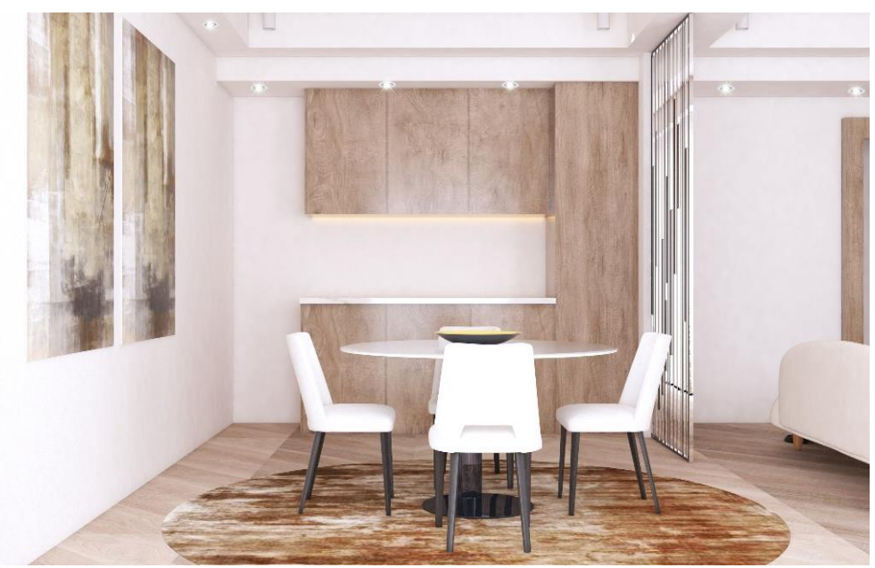
Picture no (19) shows the Curved furniture and optimal use of architectural space.