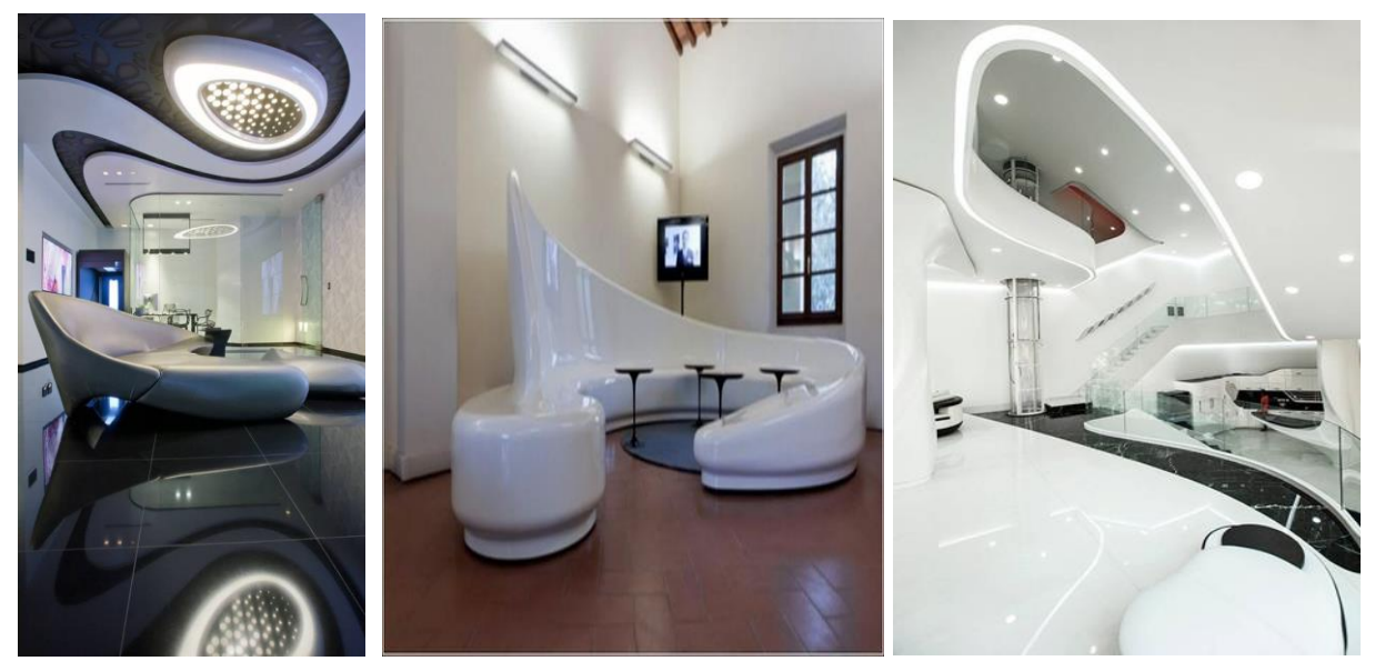
Picture No. (9,10,11) shows the usage of streamlines and modern techniques of materials and indirect lighting with colors to express the design of the ultramodern.