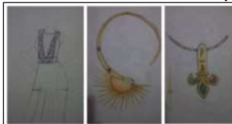
Figure (4) shows some sketches of case study 2

The refinement phase included more work for designs number 3 and 4 on proportions and appearance which is related to material selection and production. Students also continue to produce a 3D models using Rhino software. Figure (4) shows some sketches of case study 2.