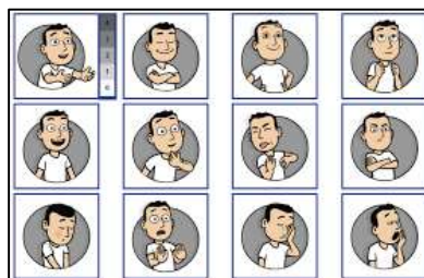
Figure (1) shows the different emotions representations of PrEmo.

Two-dimensional emotion-space (2DES) is a self-report method that measure the emotional reaction. It firstly used with music, then it becomes popular in different domains such as design. 2DES was presented to overcome the limitations of other emotion measurement methods as emotional response can be affected by social and personal experiences or context (Schubert, 1999). This method was used to evaluate products emotionally in many studies such as Desmet (Desmet, 2003), and McDonagh et al. (McDonagh et al., 2002).