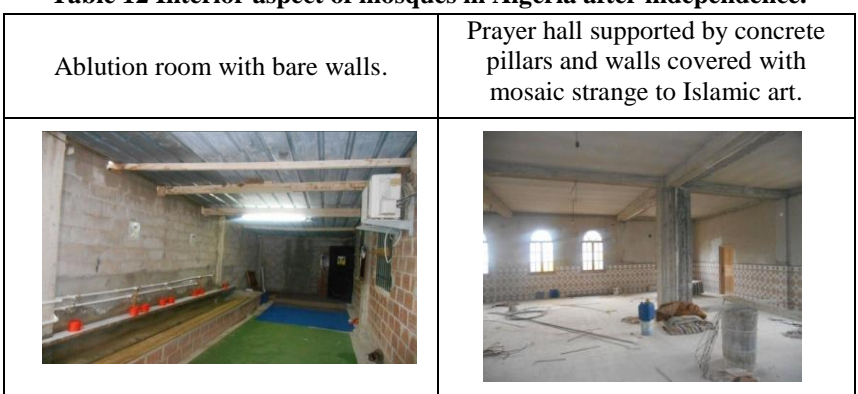
Table 12 Interior aspect of mosques in Algeria after independence.

These mosques do not have neither arcades nor galleries surrounding. And as for the supports of these buildings, they are reduced to concrete pillars always paint of the same color, green or white. Columns covered with marble, are very rare and exist only in a few private mosques whose promoters were able to challenge chronic shortages.