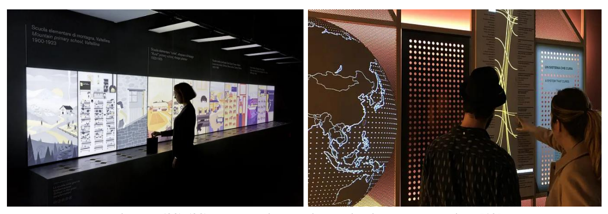
Figures. (32) (33) Illustrate interaction design in museum design. [19]