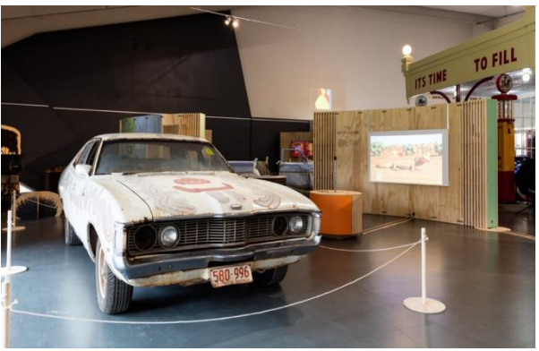
Figures. (3) (4) Illustrate the interior design of the Bush Mechanic exhibition that uses the television program as a means of exploring car accreditation in central Australia. [4]

This exhibition uses a lot of technology, from AV monitors and standard tablet devices, iPad applications for augmented reality, AV monitors manually, video games, and an open car route. The exhibition takes visitors on an overwhelming journey that challenges what it means to be human through seven latitudes. In interior spaces, visitors can explore augmented reality. There is an augmented reality app for iPad on a base on both sides of the car that allows visitors to interact with the board. Augmented reality (AR) brings dreams to life, where every board is moving in turn as visitors listen, allowing delivering the story directly to the visitors themselves (Figures 3,4). [4]