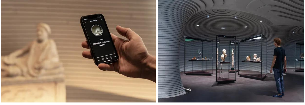
Figures. (12) (13) Illustrate museum aiming to keep visitors interested both before and after their visit, a thoughtfully designed digital approach enhances the personal experience. [9]

Depending on the inputs given by the system before, during, and following the visit, the system reacts to various needs. [9]