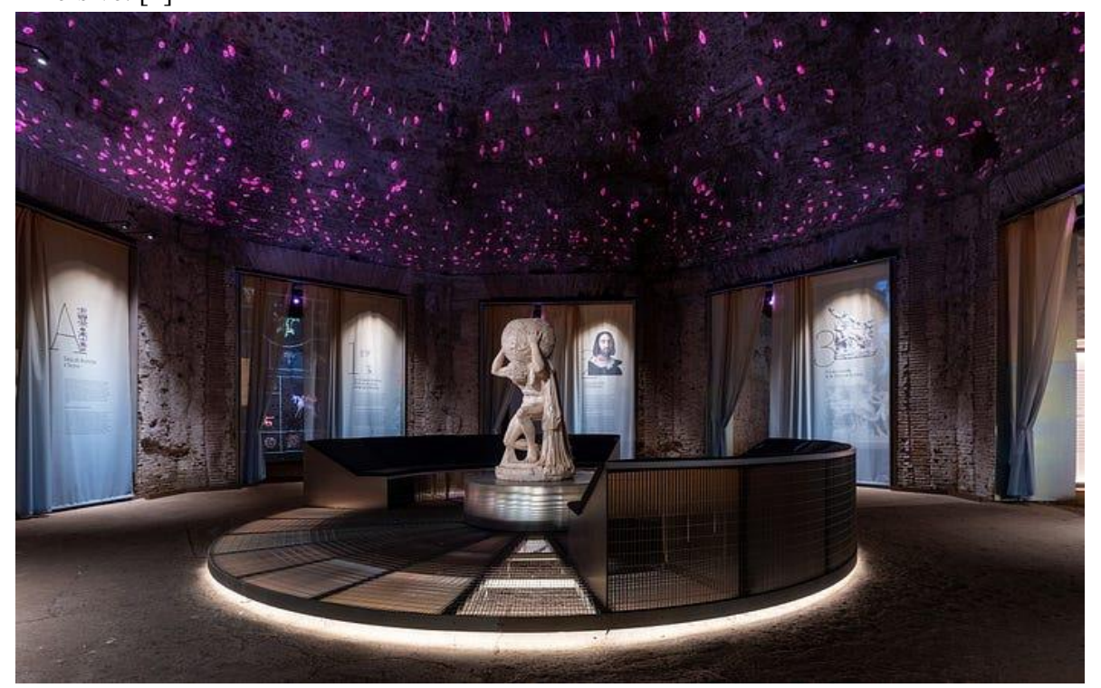
Figure. (18) Illustrates the storytelling design with technology in the museum. [6]

Nonetheless, a variety of strategies might be developed to make museum storytelling more immersive. [1]