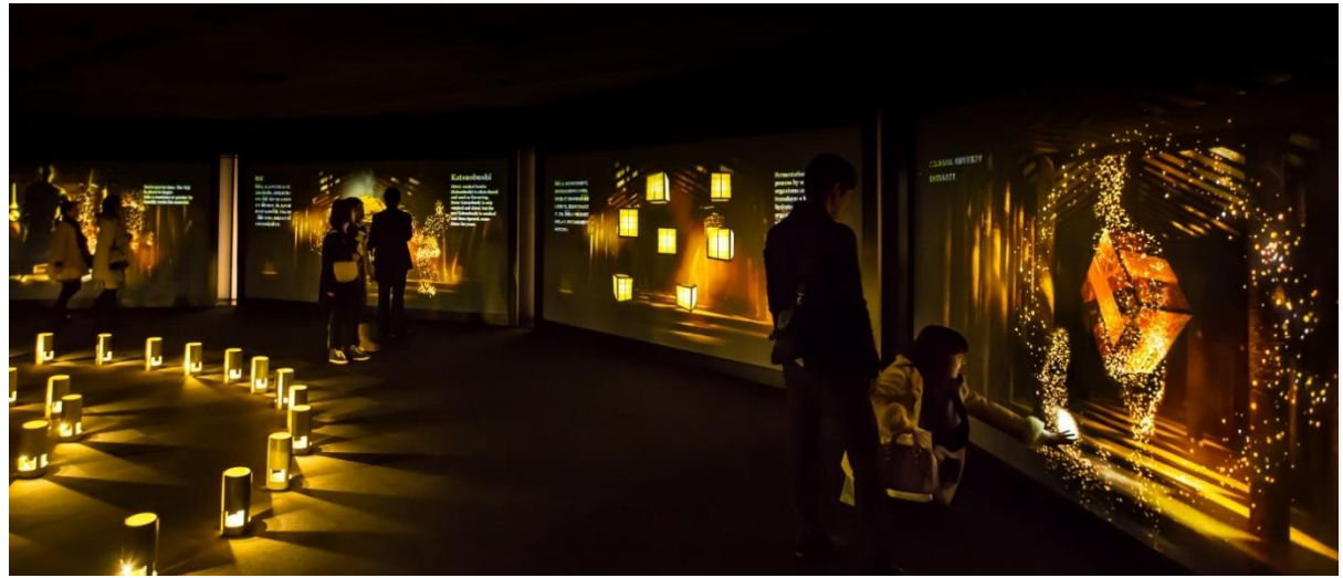
Figure. (1) Illustrates interaction with technology and visitors in story design for display. [3]