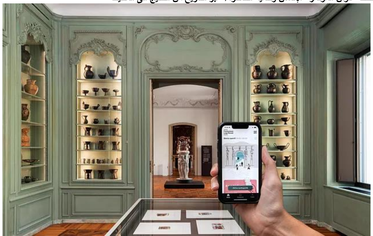
Figures. (14) (15) Illustrate the interior design of a museum that generates solutions by putting people and their needs at the center of the process. [9]