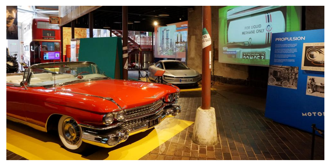
Figures. (24) (25) Illustrate the interior design of the Motor Museum's Motopia exhibition (D J Willrich Ltd). [17]

The seamless integration of technology and storytelling is essential for producing experiences and bringing historical events like the Titanic to a contemporary audience. [17]