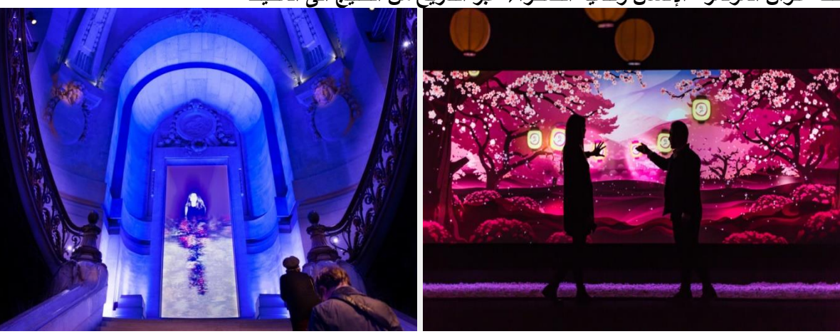
Figures. (5) (6) Illustrate the use of multimedia in the interior design of the museum. [3]