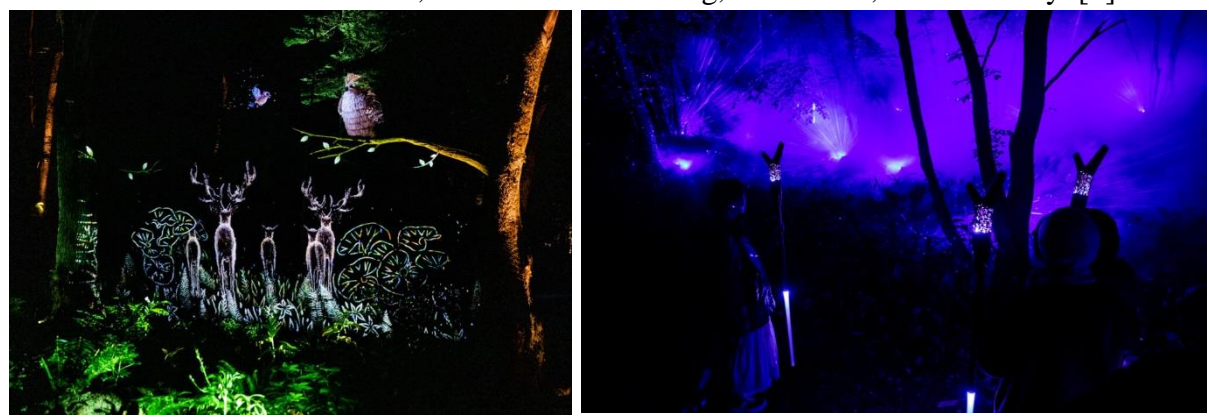
Figures. (19) (20) Illustrate the story of design that visitors play a leading role during the enchanted night walk in Lake Kan, an experience inspired by the tradition of telling stories to a Japanese community. [3]

The people attend museums to get new ideas, and they are searching for new ways to discover ideas. They desire to take a more active part in the process of exchanging knowledge. The research supports the use of storytelling and engagement to evoke strong emotions in visitors. Stories allow us to express global topics in a more personal way. The best approach for people to understand the information is through storytelling experiences that allow them to hear, see, and feel as others do. Furthermore, designers create visitor experiences that are a lot like a movie scene or a novel structure, which fosters learning, meditation, and creativity. [ \Gamma ]