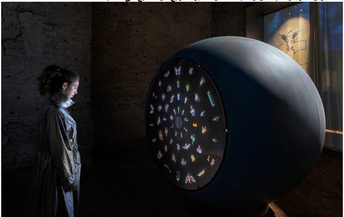
Figure. (2) Illustrates the engaging technology inside the display of museum design. [6]