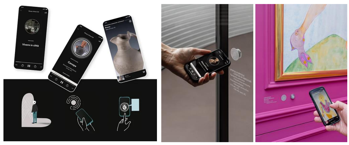
Figures. (16) (17) Illustrate the people-centered approach results in the identification of the visitor's experience, museum management objectives, and guidelines that underpin the design of future creative museums. [9]