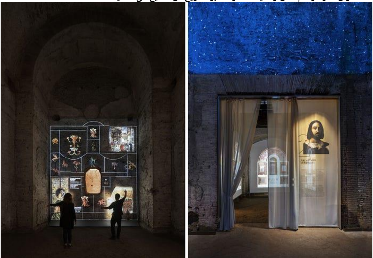
Figures. (10) (11) Illustrate the interior design of the Luigi Rovati Museum Foundation. It is the first comprehensive digital system designed with visitors' and museums' requirements in mind. This offers a visitor experience that can foster a continuing engagement between the public and the museum. [6]