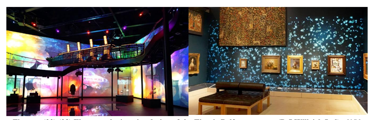
Figures. (22) (23) Illustrate the interior design of the Titanic Belfast museum (D J Willrich Ltd). [17]

This project is the length of touch screens that are several meters long. The visitor must remain close to the screen and continuously run through the entire story by putting his handcuffs against the glowing handprint. This display will alter to reflect each season as it occurs. However, as of right now, films and cartoons depict the events of Codela's current season, which is the rainy season that lasts from July to September. Indigenous observations, dreams, and legends are some other ways that the solar system might be understood and adapted outside of the framework of Western astronomy. Science on a Sphere: Employing these instruments to travel from Earth to outer space while encircled by touch screen panels (Figure 21). [4]