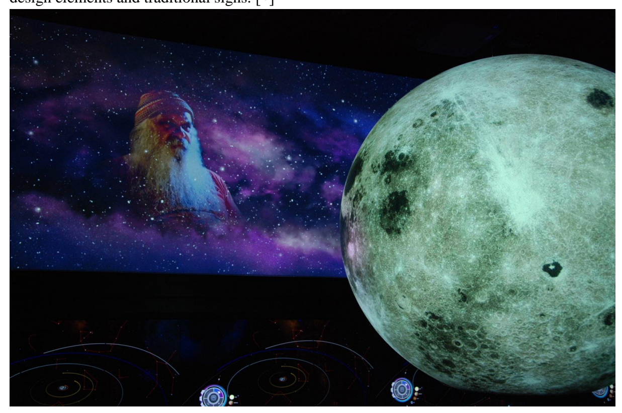
Figure. (21) Illustrates the design of the display in the museum that is based on storytelling and technology to describe the traditions of the stars in Corna. [4]

design elements and traditional signs. [\]