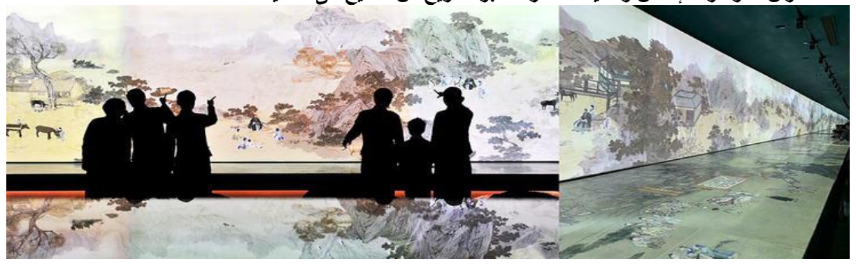
Figures. (26) (27) Illustrate the Confucius Museum's "Drawings of Confucius Saint Deeds" which has an interactive digital fusion scene. [10]