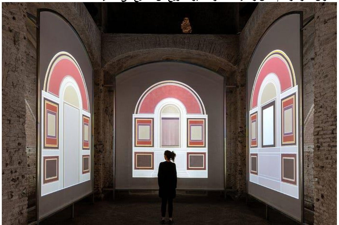
Figure. (7) Illustrates the design experience for visitors in the museum. [6]