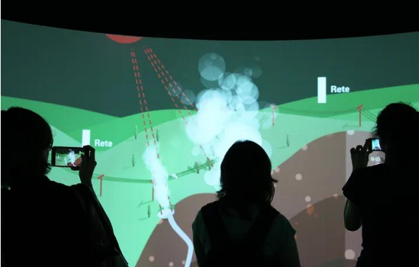
Figures. (30) (31) Illustrate the story of interior design for AR's Aboca experience exhibition through using technology. [18]