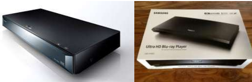
Ultra HD 4K Blu-ray player

A blue laser light beam is narrower than a red laser, which means it can be focused more precisely on a disc surface. Taking advantage of this, the "pits" on the disc where information is stored can be made much smaller. This means more "pits" can be placed onto a Blu-ray disc than a DVD. Increasing the number of pits creates more storage capacity on the disc, which is needed for the additional space required for high definition video (2) .