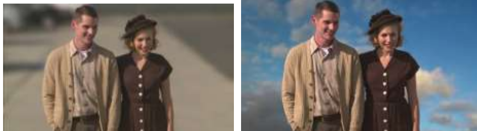
key green screens

A big portion of films today rely heavily on green screen technology to turn studio backlit environments into magical worlds, Lytro tech includes different methods of integrating live action footage and visual effects with functionality like Light Field Camera. Tracking and Lytro Depth Screen , the ability to accurately key green screens for every object and space in the scene without using a green screen which allows filmmakers to capture green screen shots without actually having to place actors in green screen environments (3) .