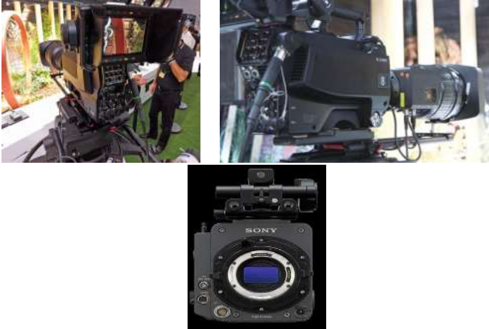
SONY UHC-8300 8K CAMERA

The 8K signal is transmitted via SDI, however the UHC-8300 also supports IP connectivity, ready for today's IP-enabled live production system.