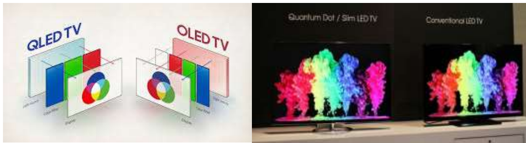
QLED – OLED – LED TVs

In order to create TV screens that can offer a deeper and more cinematic view of the action, some television manufacturers, such as Samsung and LG, offer curved TVs whose edges are slightly bent toward the user. Samsung was the first to curve an OLED , while there was a brief flirtation with curved TV screens in 2016.