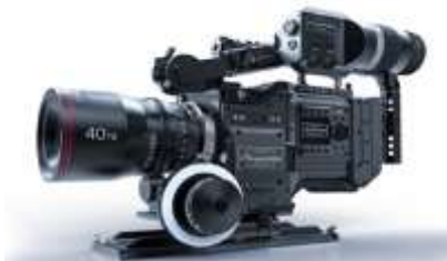
PANAVISION DXL2 8K CAMERA