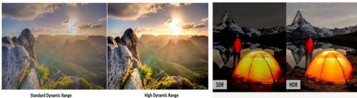
The difference between SDR and HDR image

one of the technological innovation factors in the modern TV image and the newest TV feature is HDR TV which is going to be the biggest qualitative change in TV quality since color, this technology depends on the contrast performance and the number of colors they can display, it means better contrast, greater brightness levels and a wider color palette, it also supports new transfer functions, greater bit depth, and static and/or dynamic metadata (2) .