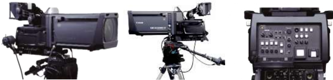
Ikegami UHK-435 camera

The UHK-435 is compatible with Ikegami UNICAM XE series peripherals, such as the CCU-430 camera control unit (1) .