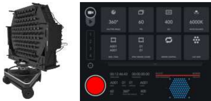
Lytro's Immerge 2.0

Lytro announced a new light-field camera called Immerge 2.0, supposedly a major update to its existing cameras resulting in faster production times and improved quality, Immerge 2.0 is a huge Light Field camera rig consisted of 95 light field cameras, which recorded the geometry of the light striking the image sensor instead of just capturing it straight on, this allowed it to capture lots of individual viewpoints in the scene that seamlessly blends live action and computer graphics (CG) using Light Field data, it was designed with alternating rows of cameras that are pointed at the opposite directions (2) .