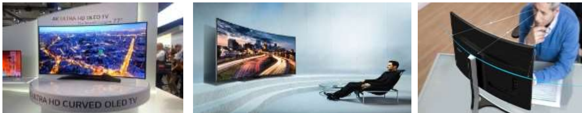
Curve OLED screen

In curving TV screens the image warps to encapsulate more of your vision. Especially if you sit directly in the center. When curved TVs are big and wide enough, the curve can become enough to the point where the image almost seems 3D, even when the source is only 2D. This is because curving the edges of the image towards the viewer enhances the visual perception of depth in what you're watching and there is a large variation between points on the TV (1) .