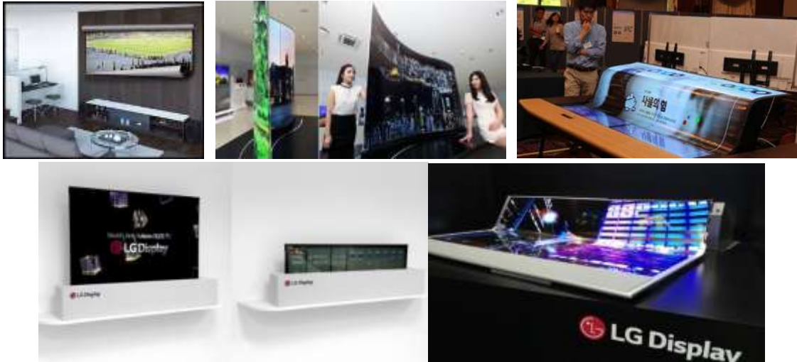
Flexible and rollable OLED TV