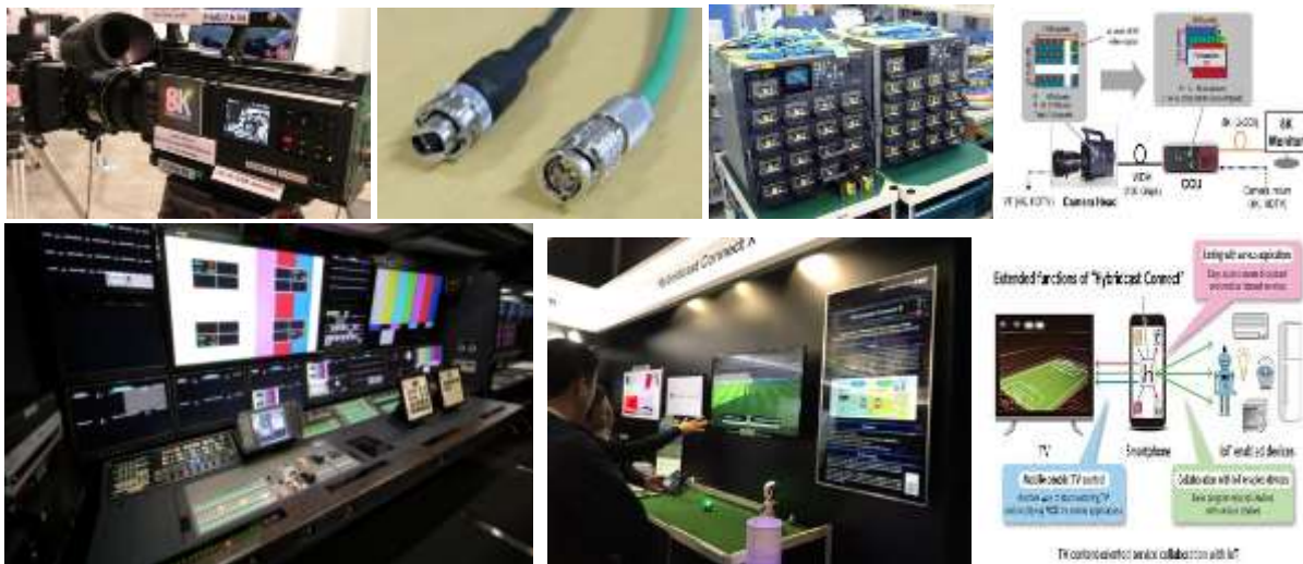
The future of TV image technology

With the proposed application framework from NHK "Hybrid cast Connect X" we can increase the number of touch points of broadcast content like TVs, smartphones, and IoT-enabled devices, IoT means The Internet of Things which is the network of physical devices, vehicles, home appliances, and other items embedded with electronics , software , sensors , actuators , and connectivity which enables these things to connect and exchange data (1) .