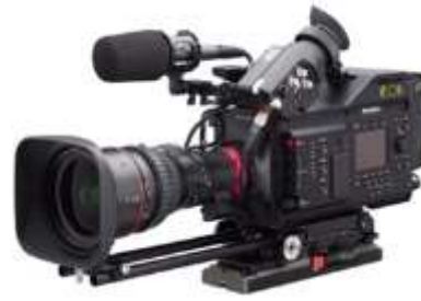
Sharp 8C-B60A 8K camcorder

The 8C-B60A camcorder will most definitely be one of the 8K units used at the Tokyo Olympics in 2020. And it's already equipped for broadcast use as it can transmit 8K uncompressed images while recording.