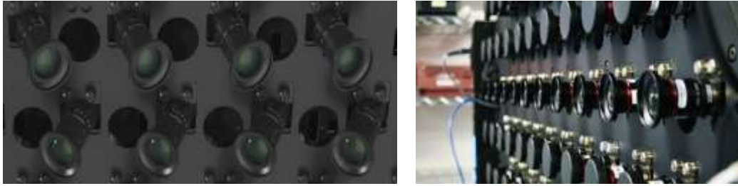
Lytro's Immerge 2.0

The Lytro Cinema camera gathers a truly staggering amount of information on the world around it, at 755 megapixels of RAW 40K resolution and 300fps, the camera boasts the highest resolution video sensor ever designed and captures as much as 400 gigabytes of data per second from the world around it (1) .