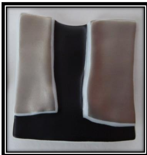
Pic. No (8): black and silver porcelain brooch - width is about 5 cm - Studio Rosenthal 1980 (10)

Model (3): Modern ceramic jewelry produced by ROSENTHAL Studio Germany Rosenthal is a German ceramic manufacturer founded in 1879. Pic. No (8)