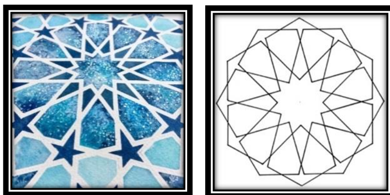
Pic. No (12): Examples for Islamic geometric decorations used in design of modern ceramic jewelry.