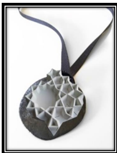
Pic. No (11): A proposal of a piece of ceramic jewelry of a base of a coated porcelain painted with a matte black glass glaze, with a three-dimensional white shape inspired by Islamic geometric decorations.