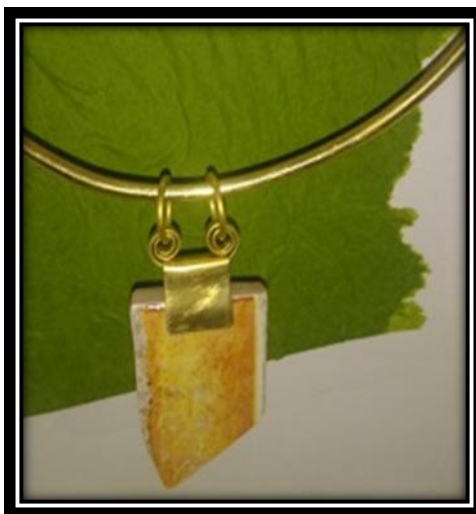
Pic. No (22): Design of a modern ceramic necklace which represents part of the Islamic geometric decoration and is characterized by its strong simple lines and bold colors.