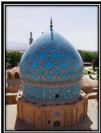
Pic. No (3): Mausoleum of Nematollah Vali Shah in Iran its date goes back to 1431 AD. The blue dome consists of a tile adjacent consisting of sequences of forms with 5, 7, 9, 12, 11, 9, 10 consecutive points. Eleven-side stars are rare in Islamic art.

The adjacency is an example to complex geometrical drawings which scientists call semi-crystal, which was used in the Islamic buildings in the fifteenth century Pic. No (5), modern design yet has symmetry and doesn't repeat itself. Pic. No (4). The West was the first to discover it in the 1970s thanks to the description of British mathematician and physicist Roger Penrose.