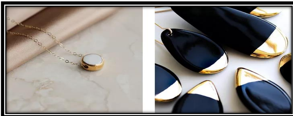
Pic. No (6): Two pictures of handmade ceramic porcelain jewelry painted with black and white glossy glass paint for earrings and pendants with gilding part. Rosenthal Jewelry (8)

Model (1): Modern ceramic jewelry produced by Rosenthal-Latvia, established in 2016. Pic. No (6)