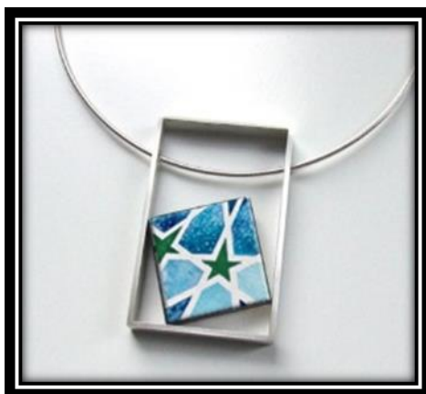
Pic. No (13): Modern necklace consisting of a metal rectangular frame and inside it a square of ceramic and on the surface some colorful geometric decorations inspired from the Islamic star.