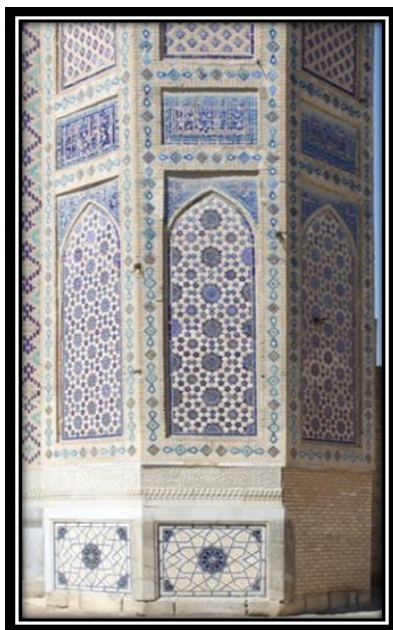
Pic. No (1) :Picture of the minaret base of the Bibi Khanum Mosque in Samarkand, Uzbekistan. The vertical arches are decorated with different geometric motifs including pentad, octet, tenth stars. (2)

from all sides with other identical units to form the overall shape for this area. This way helped in enlarging and minimizing the decoration layouts easily, based on the relative relationship among the geometric shapes.