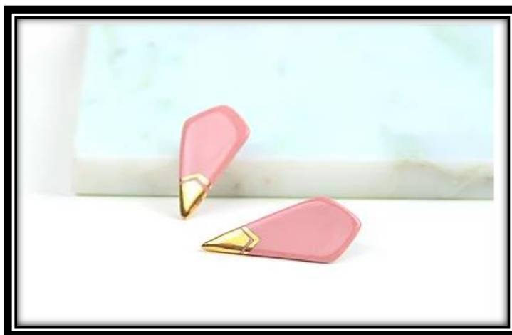
Pic. No (7): Picture of a porcelain earrings made of porcelain painted with a glossy pink glass with a gilding part of it - and the design is shown in a geometrical way - and it is characterized by its Lightweight which varies from 2-3 g, with dimensions of 3.5 cm * 1.8 cm Rosenthal Jewelry (9)

Model (2): Modern ceramic jewelry produced by Rosenthal-Latvia, established in 2016. Pic. No (7)