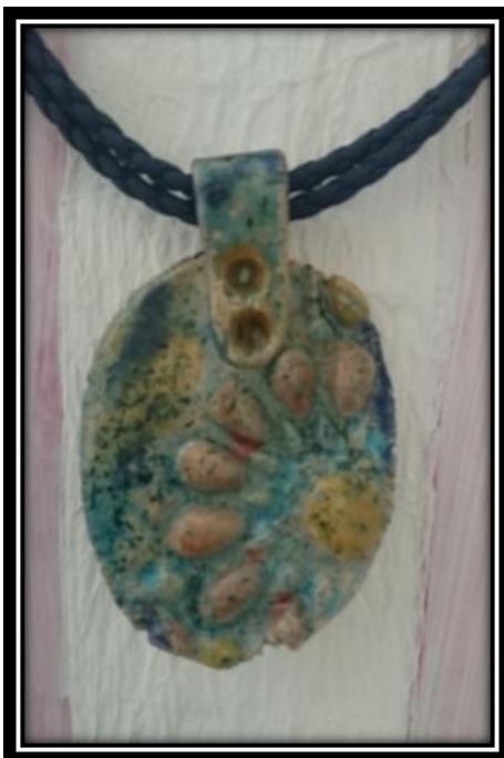
Pic. No (21): Design of a piece of ceramic jewelry from white clay in a simple handmade formation and on the surface there are decorations inspired from the Islamic star, besides adding colors to highlight the decorations which connects the Islamic civilizations with modern fashion.