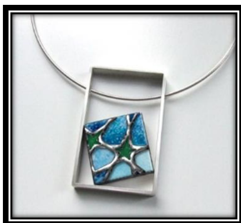
Pic. No (14): Design for the same piece with adding protrusion to the intersected lines and covering it with platen.