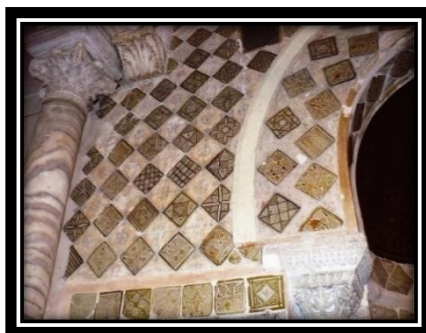
Pic. No (2): Simple geometric motifs at Oqba Ben Nafi Mosque, Tunis. (1)

It is octagons and rhombuses that include squares inside them in the Mosque of Uqba ibn Nafi in Tunisia Pic. No (2), they are considered of the oldest geometric shapes in the Islamic art which goes back to 221 AH / 836 AD. then started another phase in the development of Islamic geometric decorations by spreading the sextet and octal stars after their appearance in 265 AH / 879 CE in Ahmed bin Tulun mosque in Cairo, and in the year 478 AH / 1086 AD, the adjacent Sextuple and tenth motifs appeared in the mosque of Isfahan, and then the tenth spread in the Islamic world except Andalusia, then the nine-eleven and thirteen sides appeared in Isfahan Pic. No (3), also in year 490 AH / 1098 CE, but it was rarely used outside Persia and Central Asia. In the year 617 AH / 1220 AD, the eight and twelve side decorations appeared, then the sixteen decorations appeared in the Hassan Sadaka Mosque in Cairo in 715 AH / 1321 AD and in Sultan Hassan Mosque in 764 AH / 1363 AD, and in the Alhambra Palace in Andalusia in the 8th century. Hijri. Finally, the fourteen-side decorations appeared in the mosque at Fatehpur Sikri Mosque in India at the end of the 16th century.