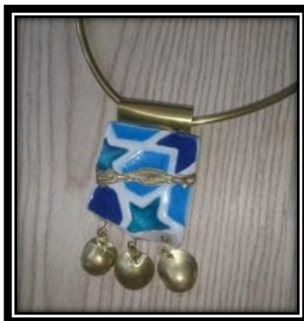
Pic. No (17): Design of a ceramic necklace inspired by the Islamic geometric decorations on ceramic tiles with interpenetration of copper as a substitute to gold.