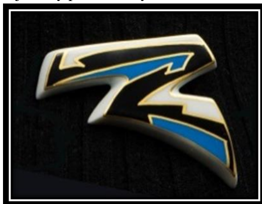
Pic. No (9): Zigzag Porcelain Brooch painted in Glossy White Paint with Black and Blue Geometric Shapes Surrounded by Gold Stripes - Made by Rosenthal Germany - 1987 (11)

Model (4): Modern ceramic jewelry produced by the German Rosenthal Studio. Pic. No (9)