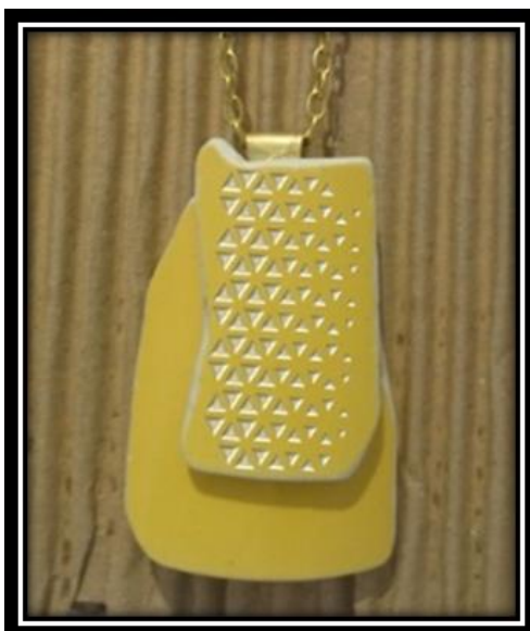
Pic. No (19): Design of a piece of ceramic jewelry inspired by the Islamic geometric decorations, porcelain is coated with yellow glass, the surface is covered with geometric decoration that depends on repetition with the change of size.