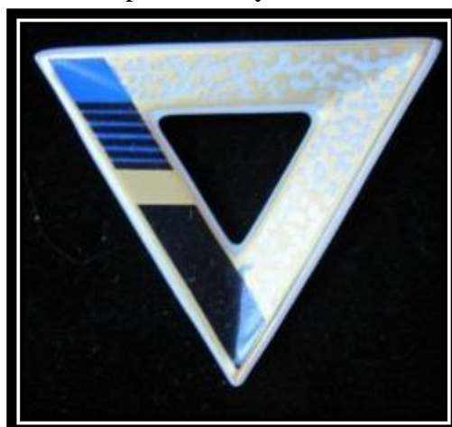
Pic. No (10): Triangle porcelain brooch decorated with geometric motifs in black, blue and gold with random gilding on the sides of the triangle, with a hollow triangle in the middle - Rosenthal Germany (12)

Model (5): Modern ceramic costume produced by Studio Rosenthal Germany. Pic. No (10)