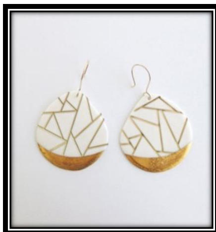
Pic. No (16): Using intersected straight lines with golden color inspired by the Islamic geometric decorations in the design of porcelain earrings coated with white glass paint.