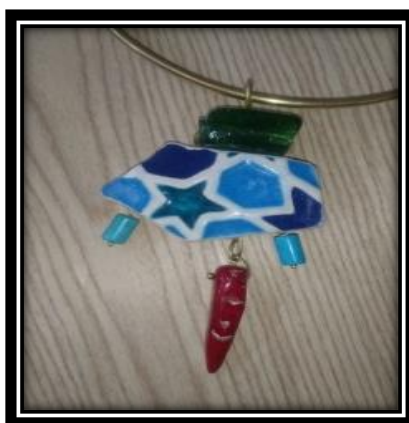
Pic. No (18): Design of a ceramic necklace inspired by the Islamic geometric decorations on ceramic tiles with interpenetration of glass and stones.