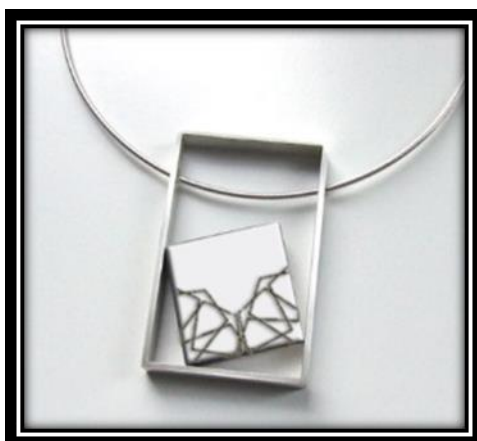
Pic. No (15): Design for the same piece using the black geometric lines over the ceramic white base.