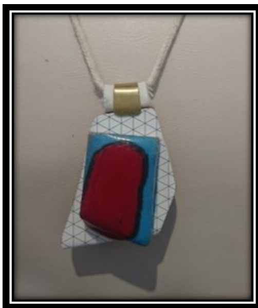
Pic. No (20): Design of a piece of ceramic jewelry inspired by the Islamic geometric decorations that depends on overlapping two pieces of ceramic one is white with geometric motifs on the surface, resulted from the intersection with lines in the black color, above it ceramic piece of molten red glass whose edges merge with the blue glass paint which is similar to the lines that define the Islamic geometric decorations.