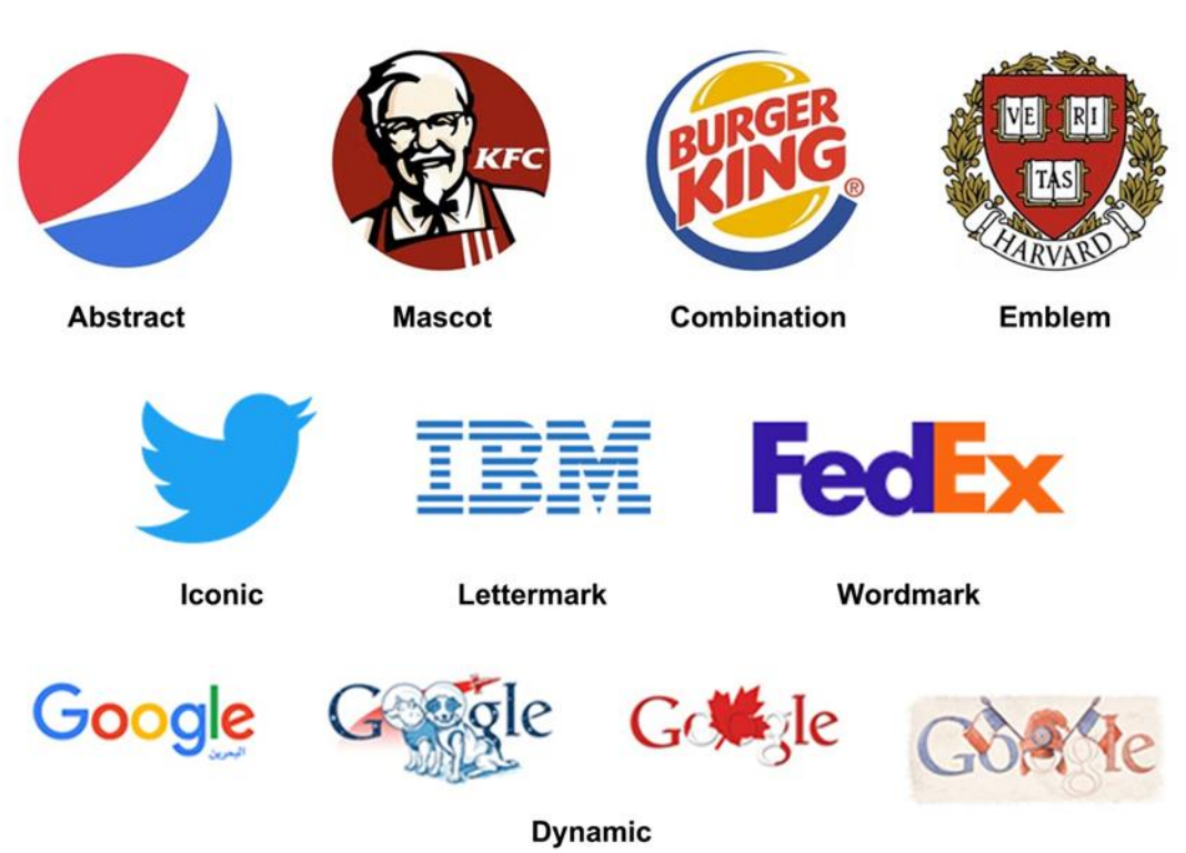
Figure (1) shows the types of logos for the most famous trademarks.

There are many logos and each type has a different character, and the following figure (1) shows the types of logos for the different most famous Wordmark Logos.