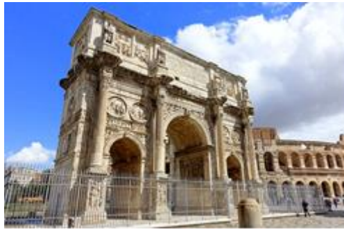
Figure No. (3)

(3), then the researcher determined the sizes as in Figure (4) with Maintaining the same proportions, taking into account the space and proportions of the place and the final shape that was implemented in Figure No. (5)