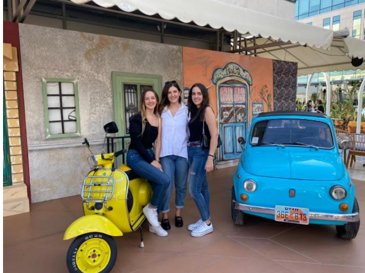
Figures (12,13,14,15,16 pictures of the audience gathering in front of the decoration during the celebrations