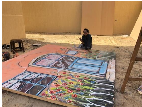
Figures (10), (11)

In the end, the day of the celebration came, when the goal was achieved by gathering the audience in front of the decoration, which used the techniques of theatrical decoration and photography in front of it, as if they were in one of the alleys in Italy, and the following pictures of some of the scenes after the implementation and on the day of the celebration and the audience took places for photography and forms from the researcher's photography Figure (12, 13,14,15,16).