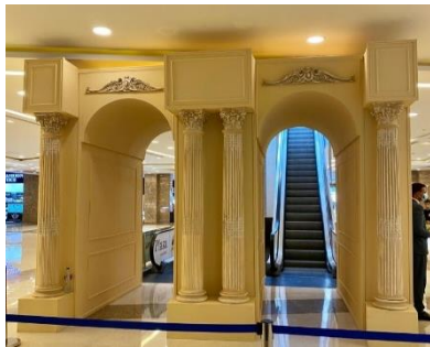
Figure No. (4)