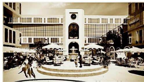
Figure (1, 2): The place designated for placing the lane before execution

It was agreed with the staff to create a large Roman gate that gives a sense of Roman history. The ancient Romans accomplished so much throughout the life of their amazing empire, and of course the Romans were always eager to build a memorial for their achievements. They built triumphal arches in every Roman province as a means of embellishing the achievements of Roman emperors and recognizing new territorial gains. Rome itself contains a huge number of such Roman triumphal arches, such as the Arch of Titus and the Arch of Constantine, and it was chosen to make a gate through which the invitees pass at the entrance to the commercial center to move them from modernity to that ancient era in the streets of Rome. The researcher was inspired by one of the pictures as shown in Figure