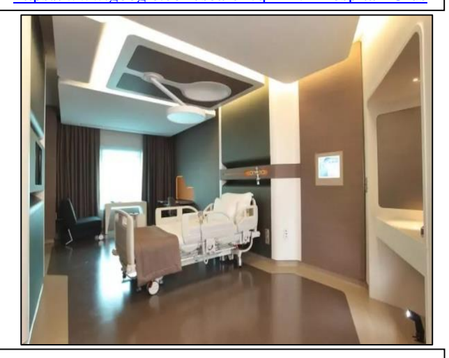
Fig (5): Liv ulus Hospital Patient Rooms <a href="https://www.google.com/search?q=bedroom+for+liv+h">https://www.google.com/search?q=bedroom+for+liv+h</a>