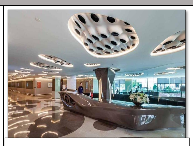
Fig (4): LIV Ulus Hospital from the inside https://www.google.com/search?q=LIV+Hospital+Ulus

Self-cleaning and easy-to-clean nanodyronic paints, the use of air purifier paints, resistance to bacteria and pollutants, good ventilation of the internal vacuum and deodorant, fire resistance paints, scratch resistance, friction, corrosion and fingerprint resistance were used, thermal and acoustic insulation materials were used that achieved the highest thermal and acoustic efficiency and thus rationalize energy consumption, as well nanoscale, ceramic and acrylic nano panels, which are aesthetically strong, easy to clean, as well as nano-resistant curtains. For stains, liquids, UV rays and fire resistance. As shown in the form of 4.5.