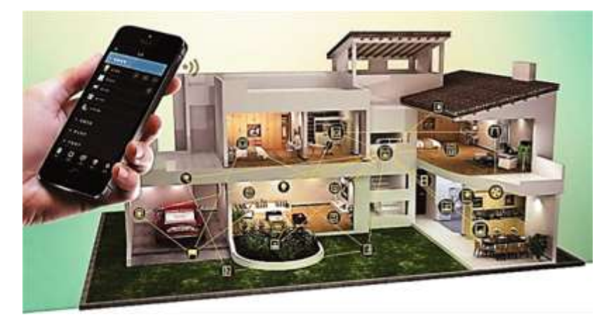
(Figure 2) shows the connection of smart home devices to the remote control