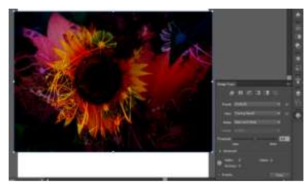
Figure (6): opening the design in Illustrator and preparing Image trace tool

1-13 Choosing the suitable mode of Image Trace tool, which is Reduction to 16 Colors, noting that we can choose a number of colors that corresponds to the number used in the rug to be produced, as illustrated in figure (7).