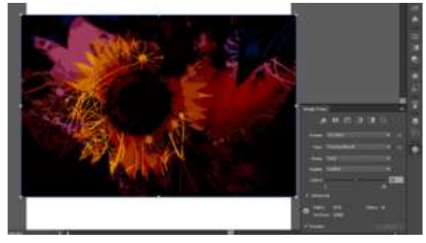
Figure (7): the design after reducing to 16 colors

1-14 The final form of the design after the reduction process appears in figure (8).