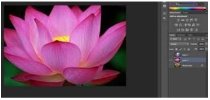
Figure (3): the picture used in the second layer