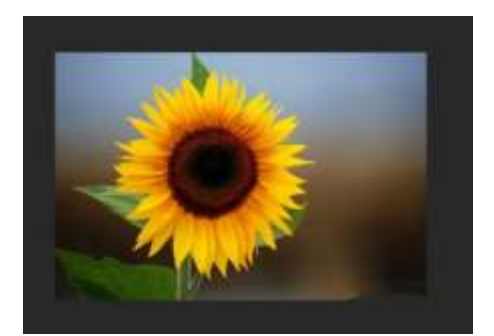
Figure (2): using picture (2) as a background