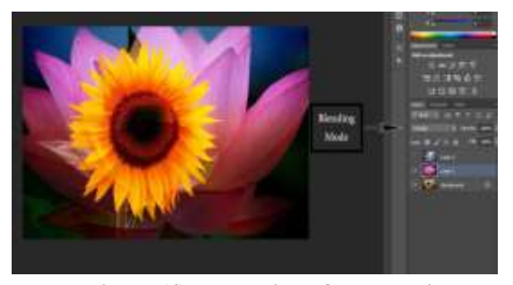
Figure (4): the design after changing the second layer blend mode