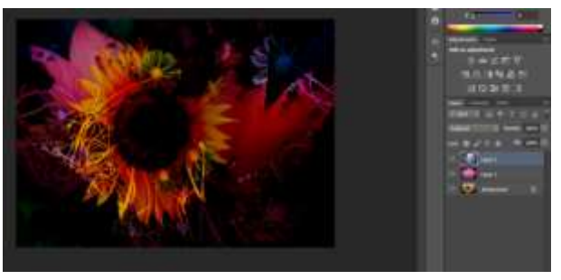
Figure (5): the design after changing the third layer blend mode