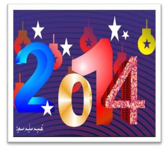
Designed by Illustrator