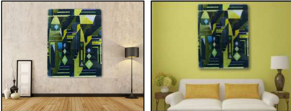
Design Model (3)