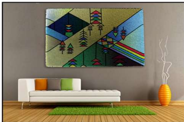
Design Model (2)