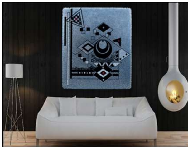
Design Model (1)