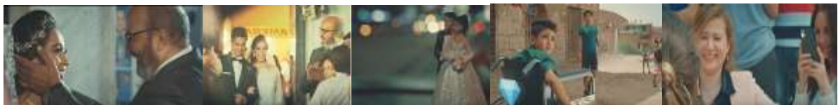
Shape No. (34)

He expressed freedom, starting and courage through outdated expressive dance moves and reaching the highest point.