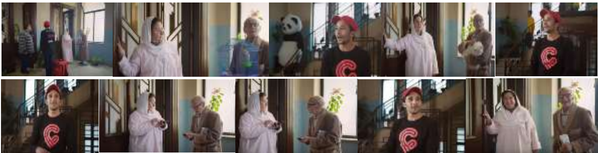
Shape No. (8)

The dialogue is joined by a young sportsman who wonders about healthy foods in reference to the diversity of services provided by the application.