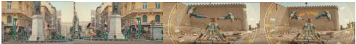
Shape No. (33)

Browsing the historical places (pyramids, sphinxes, castle and palm with its head to the sky) accompanied by young people with a modern sporting appearance open as a sign of the proud son of Egypt with its civilization and history and keeping up with the developments of the current stage. Accompanied by enthusiastic words (Son of Egypt, my heart is an eagle against the fracture, raising my head to the top) stimulates determination and overcoming obstacles to achieve goals.