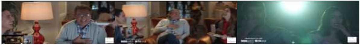
Shape No. (19)

A scene of a child who will come out on the stage to sing feeling scared to face the audience and is being reassured by his coach «Freeze your heart» and then they pull the children's group with a dramatic lyric coupé with an angelic voice” I lived with you for years and I am complementary”