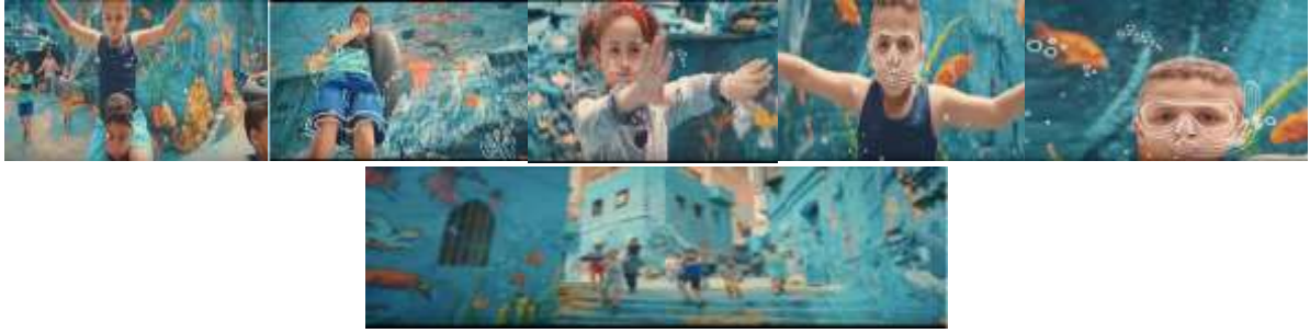
Shape No. (35)

The director crossed at the end of the announcement with a creative dramatic panel presented by a group of children who represent hope for tomorrow and that the road is difficult and needs to dive deep and swim against the current, also cooperation and solidarity to achieve their dreams and overcome obstacles to reach their goals. Metaphorical cooperation and help of others and support of all, teamwork through team and watching risks in an atmosphere full of warmth and tenderness and fun and bear responsibility and honesty, the cheerful colors in this dramatic painting reduced the difficulties they face, life is beautiful and worth fighting for and reaching Success is great.