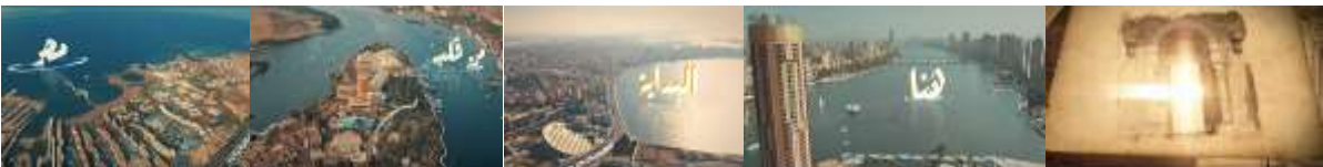
Shape No. (23)

View some documents for the companies he founded and let the designer innovate by adding animated graphic effects to the fixed elements in a sign of the continuity of the bid to date.