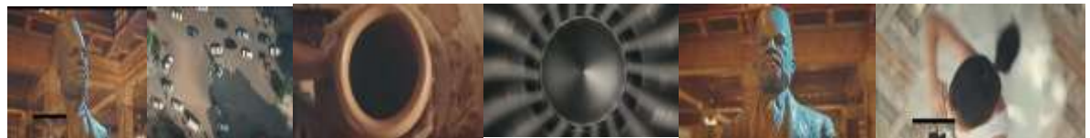
Shape No. (27)

Focusing on rowing is a sign that success and achievements can only be achieved through solidarity, cooperation, team work and community spirit and responsibility.