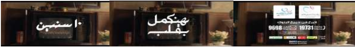
Shape No. (20)

And a scene for a couple watching a tragic movie and crying from the extreme impact «my heart hurts me» and then a scene of a warm family gathering full of fun «my heart made me laugh».