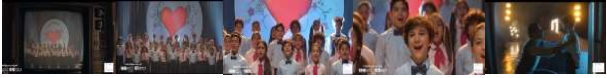
Shape No. (18)

girl consoled her friend via mobile phone «My heart is there». Then a famous comedy scene for an old play «you are the big heart».