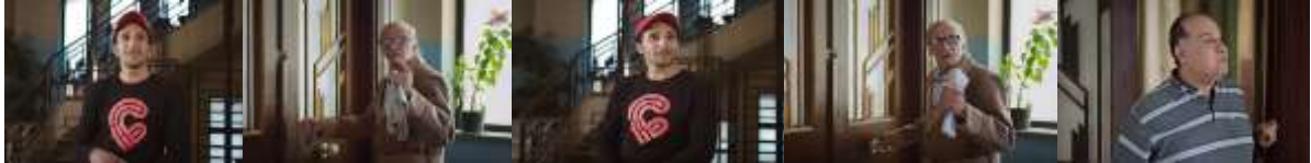
Shape No. (6)