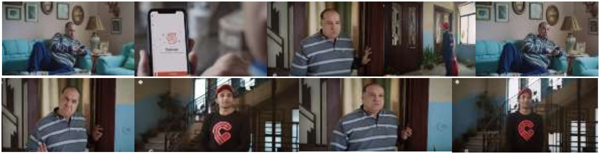
Shape No. (4)

The company seeks to create marketing campaigns continuously to propose new ideas about marketing, and the site is characterized by maintaining the safety of food from the exit of the restaurant until delivery to the customer, but also the choice of delivery staff carefully and accurately, because it represents the company in style, as the application is characterized by the easy use of it. Different from food delivery applications and other foods' apps. It aims to change the user experience by increasing the options and expand the delivery areas to include grocery products, flowers, medicines allowed to be delivered and cosmetics. This was confirmed by the ad message in the context of the declaration. The ad lasts for two minutes.