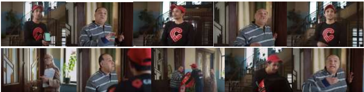
Shape No. (5)

The ad begins with the presentation of the main character in the ad, a middle-aged man with Egyptian features, sitting in a classic living room, the classic quiet backgrounds of the living room, neutral colors and comfortable furniture with the person's seating position in the ad that evokes impressions of relaxation, lazing and comforting to stay at home, he uses his mobile phone to order a meal through the Carriage application, and as soon as the request is finished, the doorbell rings and opens the door to be surprised by the delegate delivering orders in front of him, and deplores his arrival so quickly.