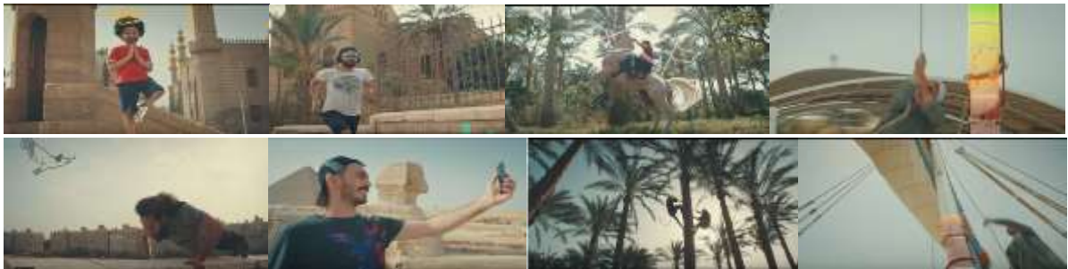
Shape No. (31)

The use of modern fun youth icons such as emotion and GBS marks on Google Maps and employment of animated effects and graphics with the presentation of popular professions or old crafts with respect to artistic talents to connect the past and the present with an effective youth methodology with motivation to Overcoming difficulties, overcoming obstacles, also giving life to the ad and sending doses of positive energy and drawing a smile.