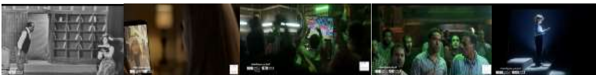
Shape No. (17)

And the flash back scene brings together Dr. Magdi Yaacoub with the late artist Omar Sharif, and he narrates his testimony about his friendship with him after undergoing surgery with an inspirational phrase «Entered my heart as a friend and entered it when you caught it between your hands».