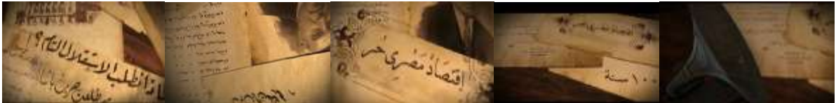
Shape No. (21)

lighting director, director of photography... The director who leads the team and chooses the best innovative means to express new creative ideas that are the basis of the success of the ad, and classifies the announcement of Bank of Egypt as a song-based advertisement, this song was produced specifically for advertising, the lyrics of the song adopted many concepts that expressed the situation of the Egyptian citizen who defies the difficulties and overcomes obstacles, and stresses the need to instill hope inside their souls. Three singers participated in the performance of the song who belong to different age groups and social segments as a sign of diversity and that the Bank of Egypt is the son of Egypt for all Egypt, for a long time now. The announcement duration is two minutes and 58 seconds.