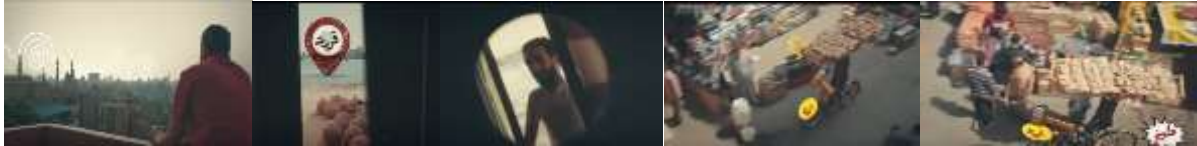
Shape No. (29)