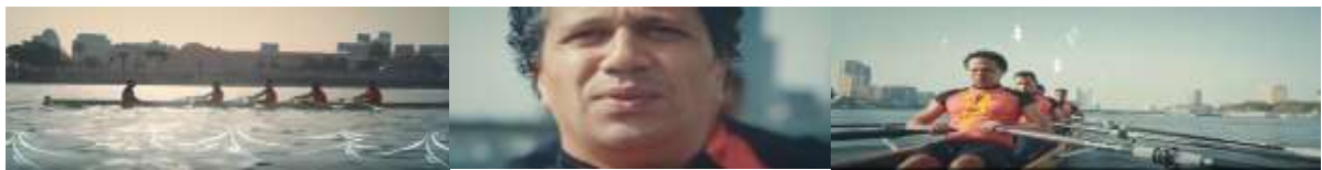
Shape No. (26)

The declaration also emphasized the role of women in a society and their struggle in all fields, and sent messages that reinforce some new societal concepts that concern women such as driving a scooter or working as a bus driver and describing them as strong, brave and active at work and taking responsibility for the family besides their work and strength the Egyptian, defying the odds.