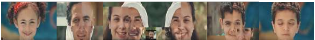
Shape No. (24)

Then the announcement began with the next bright light at the opening of the bank door, a reference to the hope achieved with the opening of the Bank of Egypt and that the beginning of success will be from the land of Egypt and confirmed this concept in writing and chose the kind of font of the simple popular line in referring to that who makes success is the normal citizen.