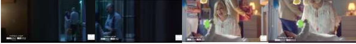
Shape No. (12)

And the answer comes through the use of the word «my heart» in several social situations repeated in life events of the society; a scene of a couple waiting for the arrival of the baby «My heart feels», the other scene of a worried mother for her son not replying to her trials to contact him «My heart fell».