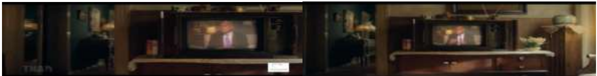
Shape No. (10)

Social solidarity is an important requirement and in Egypt alone we have the privilege of the prevalence of this beautiful human phenomenon. Philanthropy is also a humanitarian issue (industry) that cannot be sustained without advertisements that ensure the flow of appropriate resources for the permanence of this type of work, and advertisements for charitable work exist in many countries but are presented in a more professional and sensitive manner, without Exploiting the weakness and suffering of people in fundraising and successive charitable donations announcements on Egyptian channels, the most prominent of which was the announcement «I am my heart, Aish Lake» for the benefit of Dr. Magdi Yacoub Heart Hospital. The duration of the announcement is one minute and fifty-eight seconds.