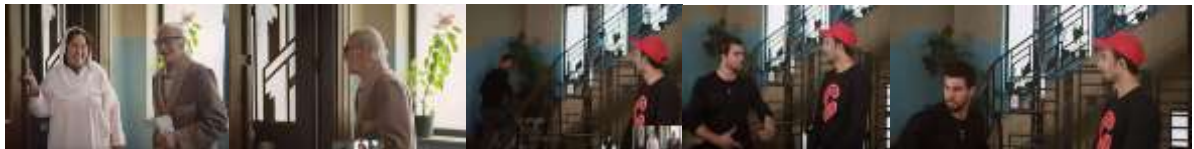
Shape No. (7)

It begins with asking questions and comparing the possibilities available to the two generations with the services provided by technology to this generation and their strong admiration for the application and its advantages. The choice of the personality of the delivery representative who represents the company and employment (his clothes, manner of performance, spontaneity his participation in the dialogue, his graceful appearance, the style of his answer to all inquiries with confidence and without exaggeration, his tolerant smile, a reassuring and funny grain figure close to the heart) reflects the personality of the company and confirm the mentality of it that attracts audience.