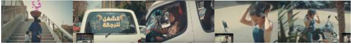
Shape No. (25)

not limited to a specific age or social category or sex, followed by the rest of the faces that are fun and warm with hope and trust.