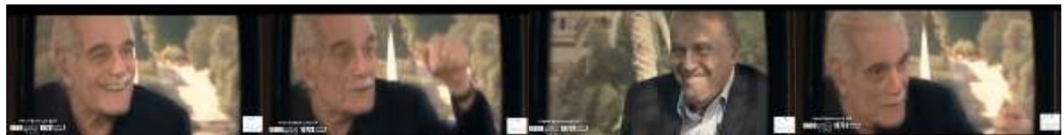
Shape No. (16)

The following scene brings together a couple in the fall of life dancing together to the tune of the song «My Heart Guide» in a fun atmosphere followed by a moving scene of a young girl who remembers her dead grandmother in a tragic scene «You're in my heart», my grandmother.