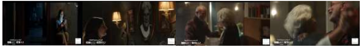
Shape No. (15)

Another scene for mother and daughter who tells her you know where «The mother's heart, my soul», Followed by another scene of a young man reconciling his fiancée «These two words are not from my heart».