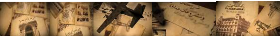
Shape No. (22)

The announcement began to accurately reflect the history of Bank of Egypt, accompanied by the musical background issued by the "Graphics" issued by the (phonograph) and the presentation of historical documents of the bank and the classical atmosphere of writings and drawings that reflect the period that accompanied the beginning of the establishment of The Bank of Egypt.