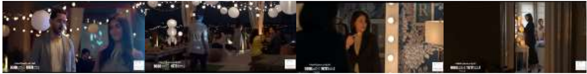
Shape No. (14)

«The spirit of my heart is inside» a beloved phrase from a grandmother to her grandson in a family scene, followed by a mysterious scene of a wife preventing her husband from going out because she worries about him «My heart says don't go».