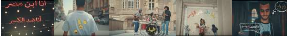
Shape No. (30)

The use of modern fun youth icons such as emotion and GBS marks on Google Maps and employment of animated effects and graphics with the presentation of popular professions or old crafts with respect to artistic talents to connect the past and the present with an effective youth methodology with motivation to Overcoming difficulties, overcoming obstacles, also giving life to the ad and sending doses of positive energy and drawing a smile.