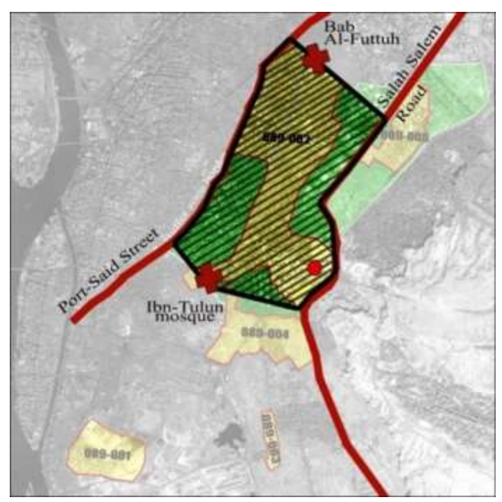
Figure 6. Boundaries of Historic Cairo as defined by Historic Cairo Centre: Source: (Kamel, Ehab, p.83

However the Historic Cairo Improvement Project (HCDP), once again, was cornered to imaginary place of making conservation as a result of its initial phases of paperwork; The task was solely distressed regarding gathering information and data of structures: buildings limitations, inter-relations in between buildings, structures coordinates, structural standing, preparation related to subject area orthogonal sketches, work details, soil technicians, sub-soil drink level, moreover as foundations, framework stability, structures, materials moreover as their subject area properties, and structures photographic documentation with regards to assembling repair (SCA, 2002, pp. 31,34).