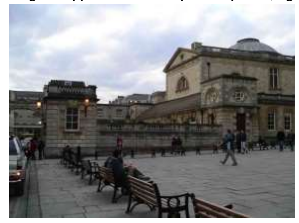
Bath, UK, source: www.law.missouri.edu

public areas which are commons, For instance, no costs or compensated tickets are needed for entrance, Nongovernment-owned department stores are types of 'private space' which are using the appearance to be 'public space' (Figure 3).