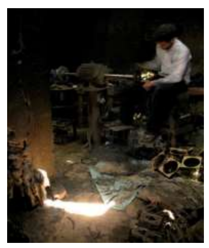
Figure 15. The craft of cooper "Nahaseen" in Gamalia in HC, source: (URHC report 2012, p.87)