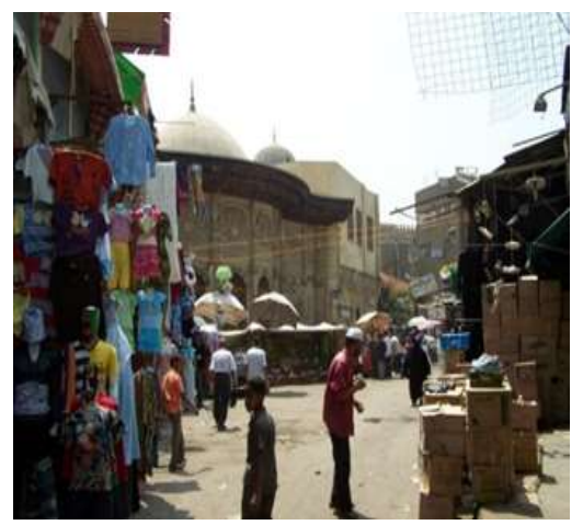
Figure 14. The daily needs come before the appreciation of monuments in HC, source: eprints.nottingham.ac.uk