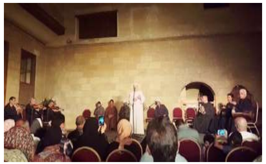
Figure 13. sample of some events that are being held in Al-Mu'izz St in HC, source: \underline{www.albawabhnews.com}