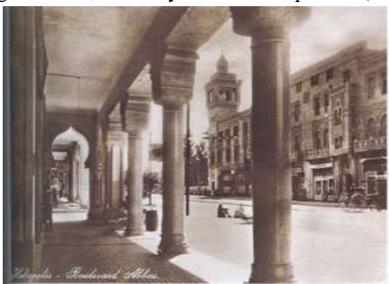
Figure 10. Korbas arcades, a sample of the architectural impacts of HC appears clearly in the early twentieth century.

Additionally, there are additional current up to date forms of reflective HC"s nature onto spanking new study tasks, in Cairo, is visible within the actual design from the children's social park near Ibn-Tulun musjid and additionally the Azhar Recreation space, that tend to be next to the written heritage website, similarly the new campus for (AUC) in Cairo .