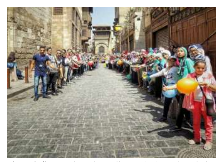
Figure 2. School trip to Al-Mu'izz Ladin Allah AlFatimi st