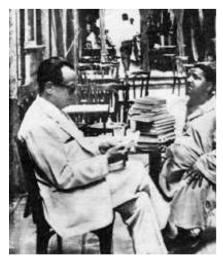
Figure 12. Nobel Prize winner Naguib Mahfouz on Elfishawi Maqqha in HC. Very good sample that shows how much the open spaces in Historical areas affect directly the social life and for sure cultural sense for Egyptians.