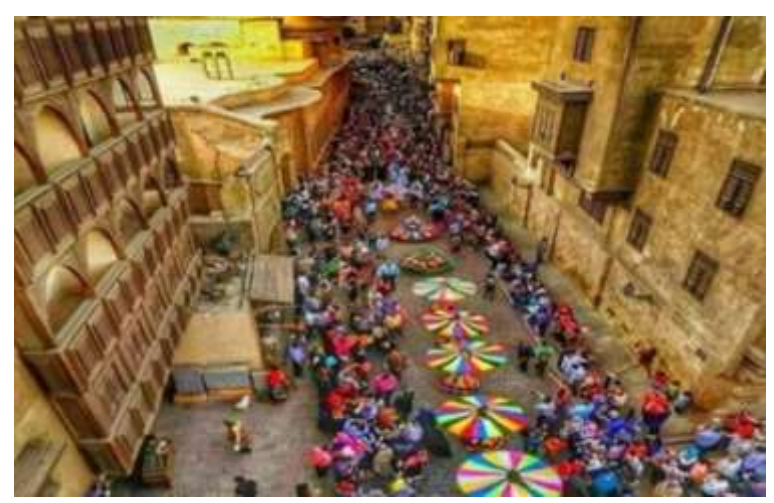
Figure 1. sample of events in historical sites in Egypt, Festival of drums in Al-Mu'izz Ladin Allah Al Fatimi st.