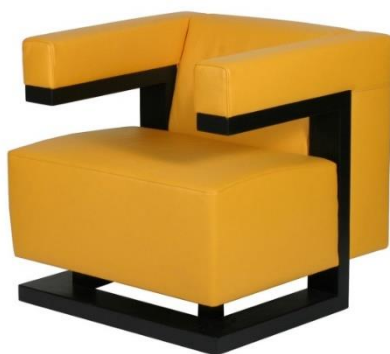
Walter Gropius Image Number 1 shows the design of one of the seats designed by

Due to the importance of Bauhaus to the unity between visual arts, architecture and industrial design, the Bauhaus were not a model as much as a new way of life, and in the field of furniture design the Bauhaus was interested in the call to invent new forms and designs and learn modern techniques, and stay away from decorations and reject All that is traditional, attention to the functional and economic aspects and maintain unity in the design of furniture and harmony furniture with the modern house and suitable for the narrow spaces of modern residential buildings and ease of care and the design of lightweight multifunctional furniture. Walter Gropius's designs were also characterized by the standardization required by the method of quantitative production to contribute to the economic dimension, and his ideas were followed later by many furniture factories in applying the method of product analysis for its elementary elements, whether on the functional or formal side as well as on a level The material for the design of funky furniture, and the ideal artist from the point of view of The Gropius Walter Gropius who has the ability to deal with the material as much as he knows the design theories. (1- p. 8).