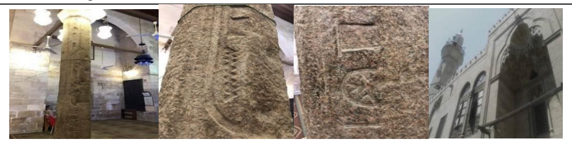
(Figure 5): Archaeological and artistic features of the Mosque and Madrasa of Al-Suwaidi, Cairo, Egypt, where the pillars include Hieroglyphic inscriptions. (By the researcher)

The phenomenon of plagiarism along with exaction and procedural conversions along with reuse became clear through the architectural elements brought from older constructions, which can be seen in the Mosque and Madrasa of Al-Suwaidi (u) [76], which is located in the street of Al-Suwaidi in Cairo and registered in the Islamic Antiquities with No. 318. It was built about 834 AH/1430 AD by Badr Al-Din Hassan bin Suwaid, who lived at the time of Sultan Al-Ashraf Sayf-ad-Din Barsbay. The Mosque and Madrasa of Al-Suwaidi had evidences of the phenomenon of plagiarism, where there is a manifestation of reuse to some of the old architectural elements such as the pillars which include Hieroglyphic inscriptions, this is proof that these pillars were brought or imported from ancient archaeological constructions (Fig.5)