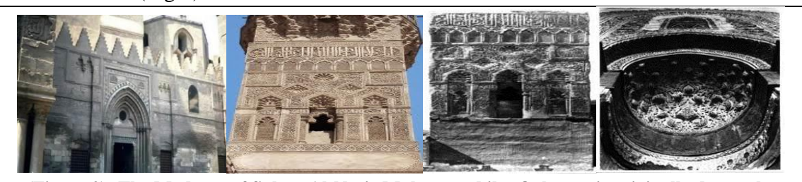
(Figure 2): The Madrasa of Sultan Al-Nasir Muhammad ibn Qalawun is originally due to the reign of Sultan Al-Adil Kitbugha.

foundational text on the facade almost in 695 AH/1295 AD (0-p) [41, 58]. Moreover, he constructed it on the ruins of an old bathroom or Hammam which previously existed in its current location, but when Sultan Al-Nasir Muhammad ibn Qalawun ruled Egypt for the second time, he deposed Sultan Kitbugha, and then Sultan Al-Nasir continued the construction of the Madrassa almost in 703 AH/1303 AD. Furthermore, he built a dome in it, and moved the remains of his mother's corpse in order to bury corpse into Madrassa, he also buried his brother Prince Anuk [41, 58-59]. Also, the most important features of the phenomenon of plagiarism are evident through the marble door with the Gothic style which was taken from the Church of Saint George in Acre, Sultan Al-Ashraf Khalil brought the marble door to Egypt, and then Sultan Kitbugha used that entrance in construction of the Madrassa. Thereafter, Sultan Al-Nasir built a square minaret over the entrance of the Madrassa, this minaret was full of many plaster decorations with its Andalusian style; these decorations are known as Dantilla [42-47, 49-54, 60]. It is worth mentioning that the foundational texts at this Madrassa didn't mention the name of Sultan Kitbugha, although there are remarks and indications for texts registered on the façade of the construction, which dated back to 695 AH/1295 AD (o-p) (Fig.2).