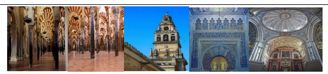
(Figure 6): Archaeological and artistic features of the Great Mosque of Cordoba. After: UNESCO, World Heritage Centre, Historic Centre of Cordoba on Website: <a href="http://www.unesco.org/">http://www.unesco.org/</a> (Access date: 14/11/2017); and After: Lamprakos, 2016.

Mosque to the Cathedral, known as Cathedral of Santa Maria the Greater. From this time, the old architectural features and artistic values had changed step by step until the general character represented in the Gothic style [82-83] (Figs.6-7).