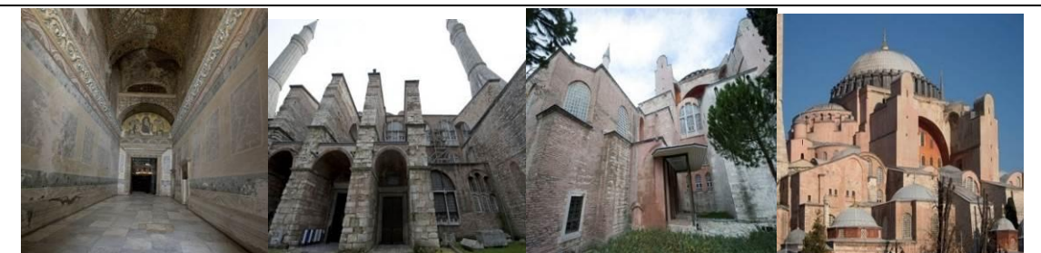
(Figure 11): The architectural features, developments and functional purposes of Hagia Sophia. After: <a href="http://www.pbase.com/dosseman/istanbul_aya_sofia">http://www.pbase.com/dosseman/istanbul_aya_sofia</a> http://www.pbase.com/dosseman/istanbul_aya_sofia&page=all (Access date: 16/2/2018)

four Minarets added in different eras, which were some of the most important additions to the geometrical planning and architectural style for the Cathedral before converting it into a Mosque and then into a Museum [108-112] (Fig.11).