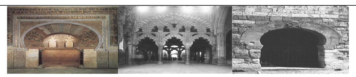
(Figure 7): On the left side, the Mihrab, Mosaics and Sanctuary of the Great Mosque of Cordoba. On the right side, the Portal of the Church of San Juan de Banos, erected in the Seventh Century. (After: Dodds, 1992)