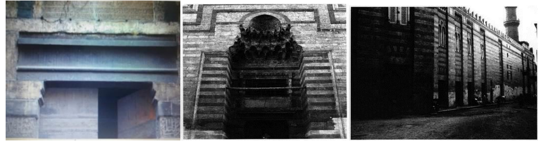
(Figure 4): On the left side, the architrave of the main entrance and then the facade of the khanqah of Amir Shaykhu, Cairo. (By the researcher and After: The Creswell Archive, Ashmolean Museum, http://www.ashmol.ox.ac.uk/ (Access date: 17/4/2017)