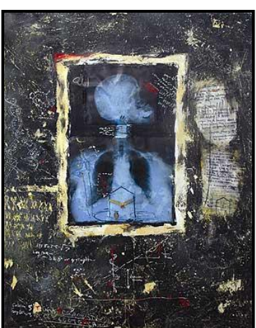
(Genetically Modified Emotions) using X-ray -2003 /135 ×105cm

stages that were reflected on his art. We covered (12) artistic work of the most prominent works of the artist Ahmed Mater in which he used the X.ray with remarks. Among these works in 2008 he produced (lighting 1, 2), (lighting talisman 1, 2) and (X.ray derive). In 2009 he produced (lighting 9), (Mehrab- lighting), (cardio- lighting) and (Wakef- lighting3). In 2010 he produced (lighting- Ottoman Wakef), (Mehrab- lighting 2), (Surah- lighting) and (Human Evolution).