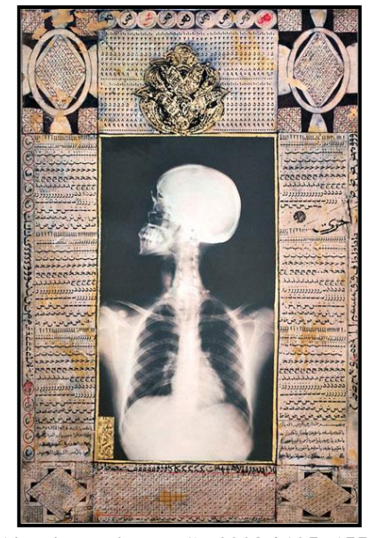
(lighting talisman 1)- 2008 / 105×155cm