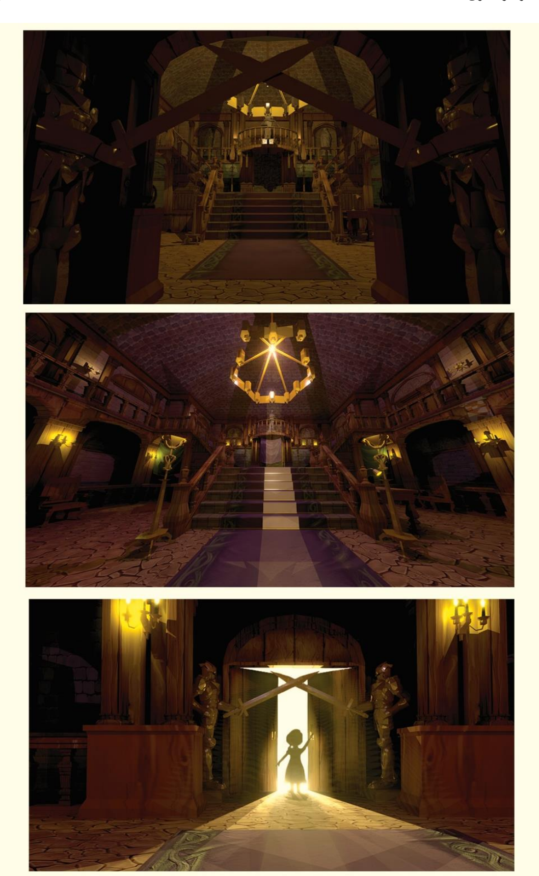
\label{proposed scene} \mbox{Experiment (2): The researchers added a third dimension and depth to the proposed scene of ''backgrounds'' dramatically