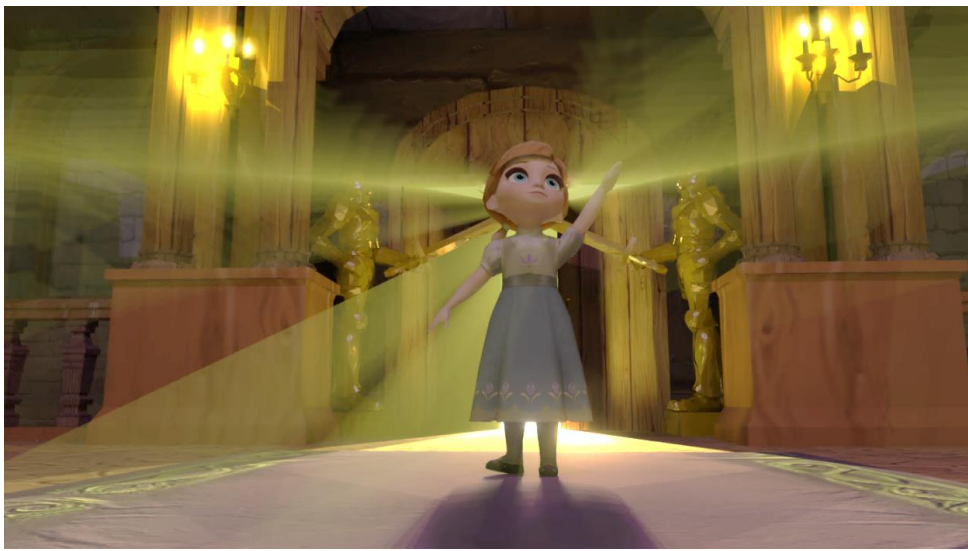
Experiment (4): The two researchers presented the background of several angles, and the external lighting and its reflection on the character dramatically