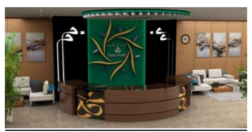
Prespective for design of a hotel's reception