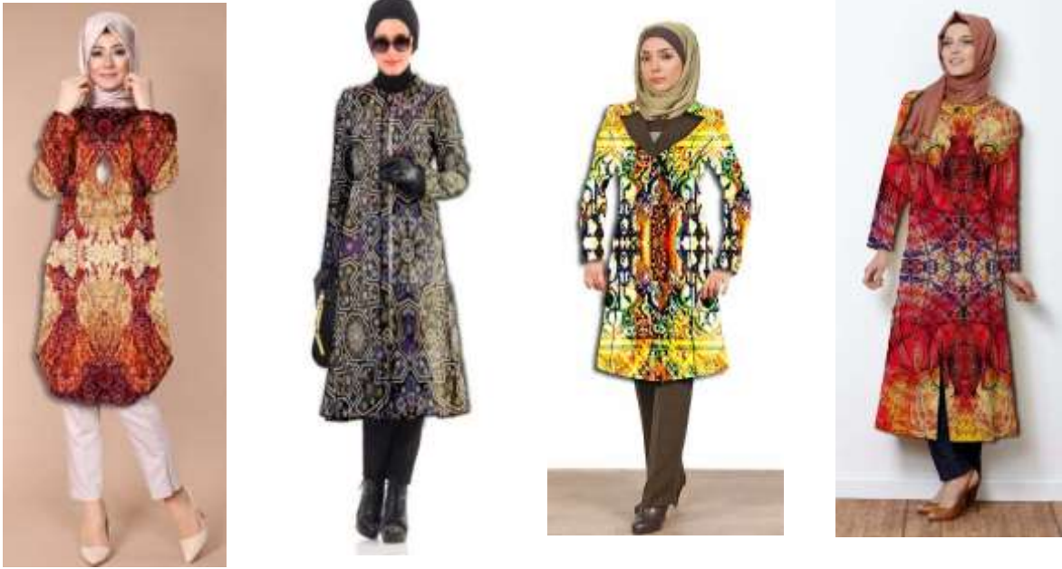
Proposed staffing ideas for redundancy designs