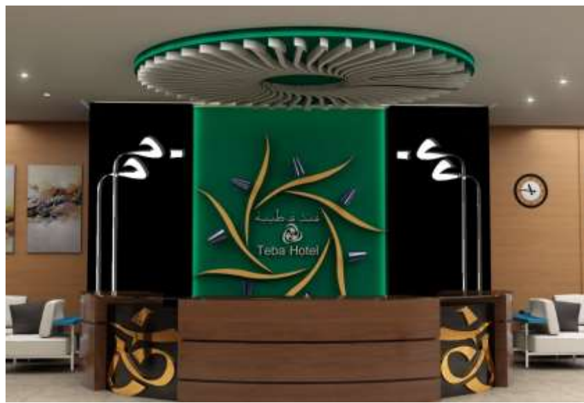
A wall within a hotel's reception with the design of Sufi thought of Jalal ad Din Rumi carries a philosophy