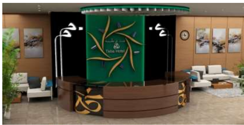
Perspective for design of a hotel's reception