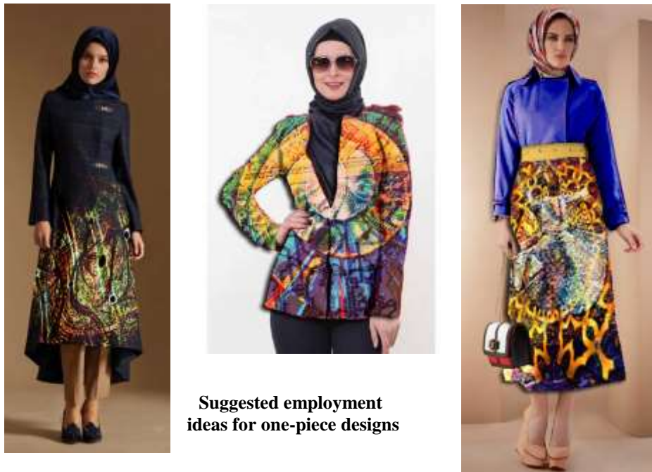
Suggested employment ideas for one-piece designs