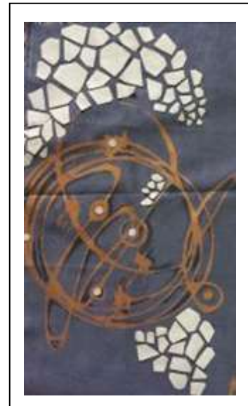
The designer adopted the design of the raw surface on the integration of laser cutting technique and the technique of printing in the style of painting and painting, emphasizing the link of decorative design performing the structural lines of the uniform and create an innovative and innovative relationship to the uniform.