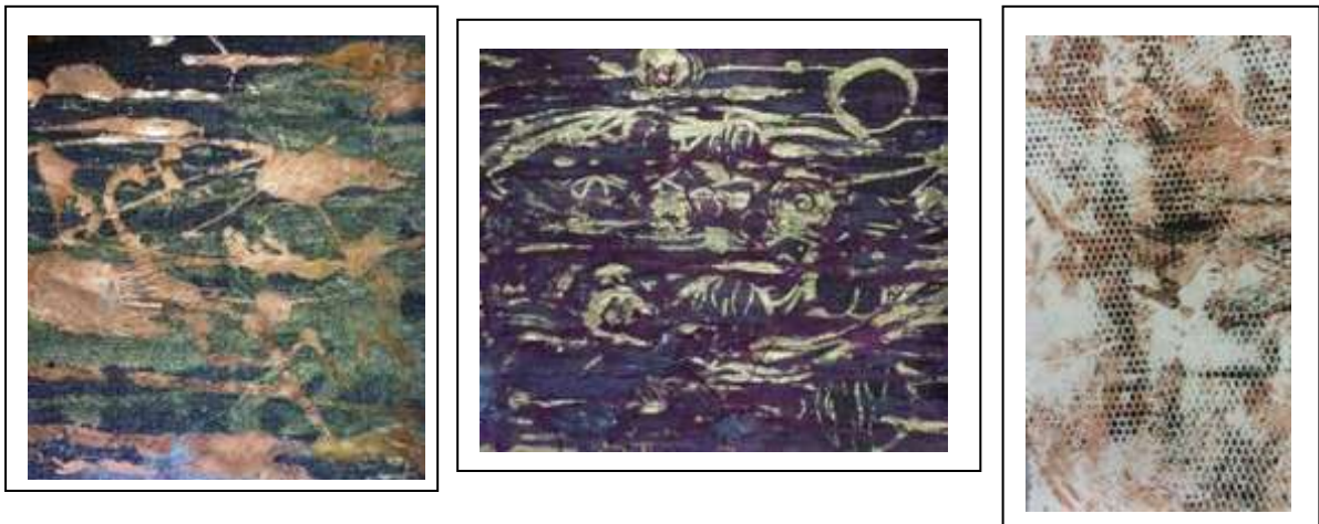
Experiments on the formation of the raw material using printing techniques using monoprint and foil printing