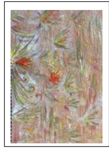
Experiments on the formation of the raw surface using printing techniques with monoprint and embroidery techniques