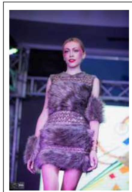
The designer relied on the formation of the raw surface through the structural design of the laser cutting in the raw fur through the horizontal lines emphasizing the texture element