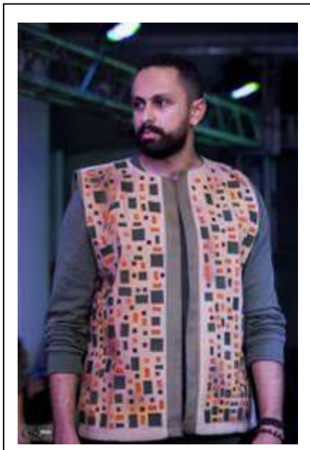
The design relied on the formation of raw surface on the printing of monobrint in the floor and then distributed pieces of geometric shapes cut by laser technology to link the decorative and structural design of the uniform.