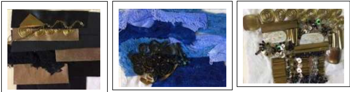
Surface formation experiments are carried out using different materials such as copper, beads, leather and various materials of fabrics