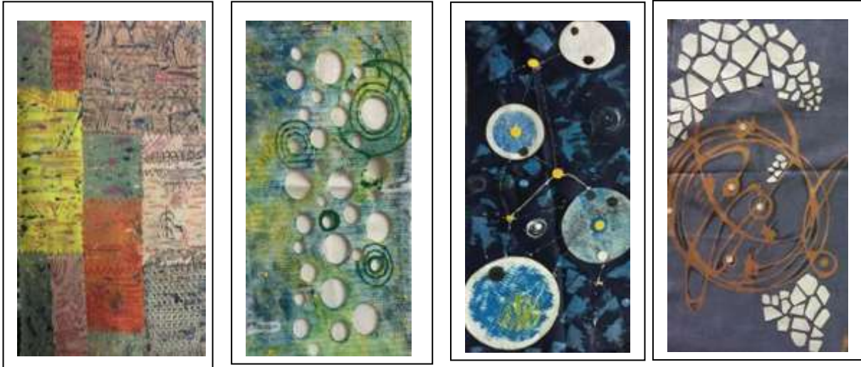
Surface formation experiments are carried out using the collage method, laser cutting, monoprint printing techniques and Silk screen printing

Innovative ideas illustrate the surface treatment of raw material from students' work