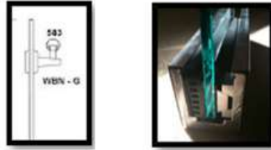
Figure (1) Method of installation of the units in the ground and the way of fitting the handrail

sketches were made for the three trends and two units of the first trend were selected figure (2) and their method of installing figure (1).