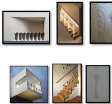
Figure (2) The two units and their places on the stairs and balconies