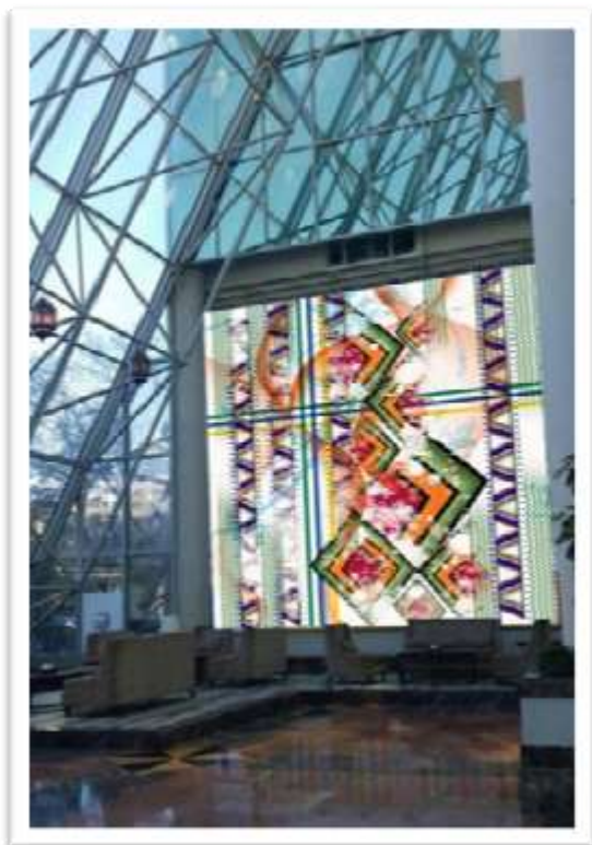
Design Idea 1 Innovative Printed Textile Hanging