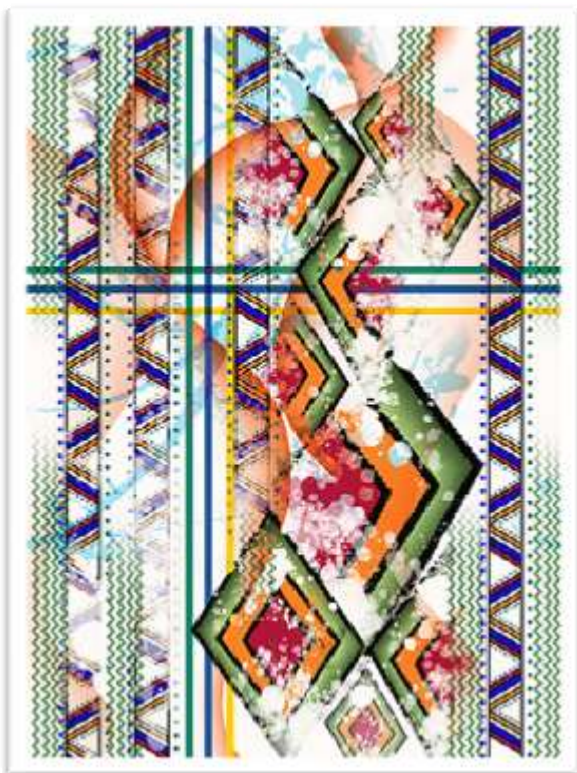
Proposed employment for one of the exterior facades of hotels