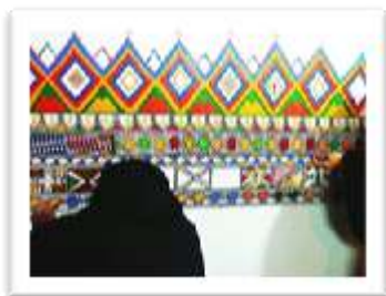
The motive (Inspiration source)

The base of this idea are shapes and lines, which are the basic elements of color bands (high horizontal lines, thick horizontal lines, broken horizontal lines, saw teeth, vertical horizontal lines, geometric shapes, etc.) Al-Assiri was used to develop a printed textile hanging.