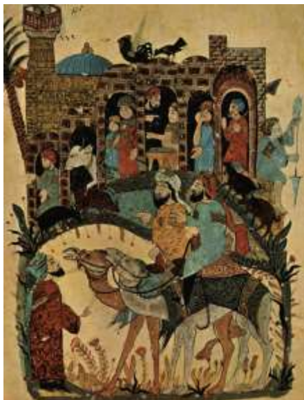
Figure (1) Al-Wasiti - a dialogue near the village of Makamat Hariri - - the twelfth century AD - AH - National Library B

1-The necessity of taking care to deepen the awareness and thought about the Islamic artistic heritage and the holding of monetary dialogues and include the curricula of the students of the technical colleges on the vocabulary of the Islamic heritage, which contributes to the development of the vision of the contemporary artist and .work to confirm his Arab and Islamic identity