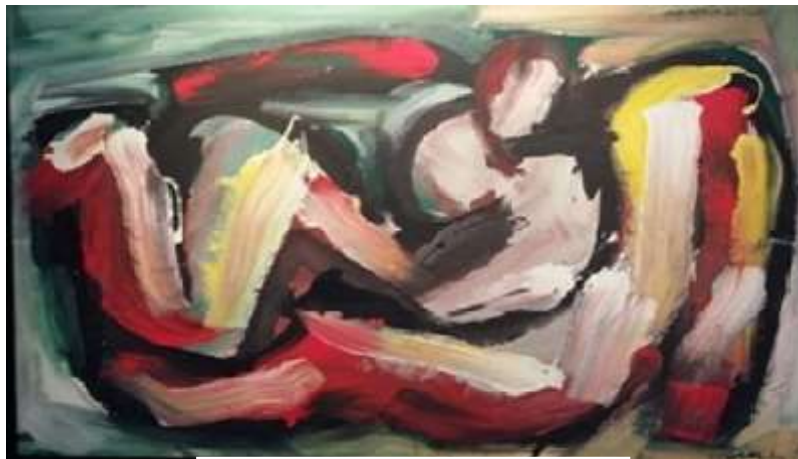
Figure (6) Hamid Abdullah - Abstract - Acrylic on paper pulp