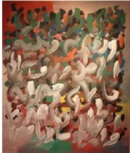
Figure (4) Hamed Abdullah - Arabic letters - Acrylic on paper pulp