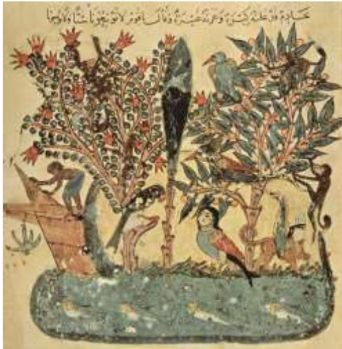
Figure (3) Yehia Ben Mahmoud Al Wasti - Makamat Hariri of the famous version copy «Scheffer» preserved in the National Library in Paris - Baghdad in 634 AH1237