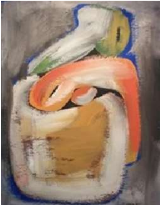
Figure 5 Hamed Abdullah - Arabic letters - Acrylic on paper pulp