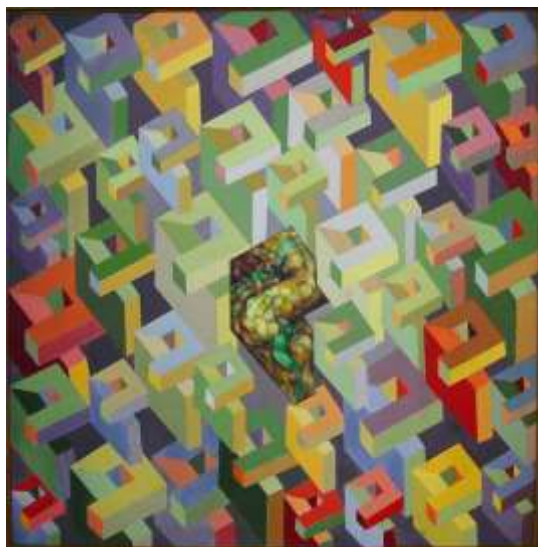
Figure (8) Abdul Rahman Al-Nashar - organic-engineering relations - oil on a tree fixed on a tree