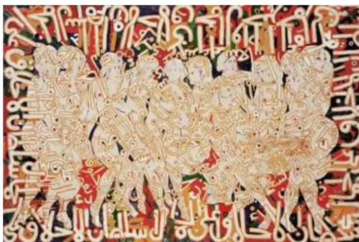
Form No. (12) Yousef Sidah - Abstract organic forms with Arabic letters - Oil on the Tawal