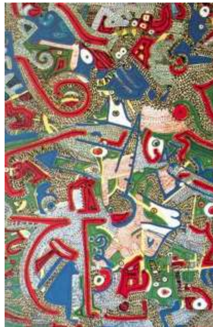
Fig. (10) Yousef Siddh - Tjrid - Tredd - multiple moles