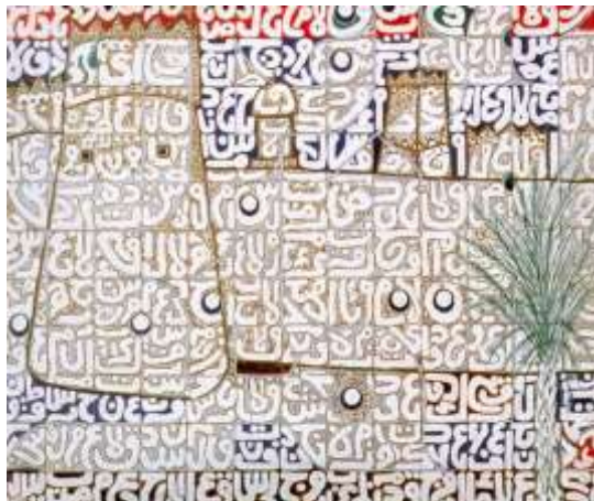
Form No. (11) Yousef Sidah - Abstract Arabic letters - Oil on Twal