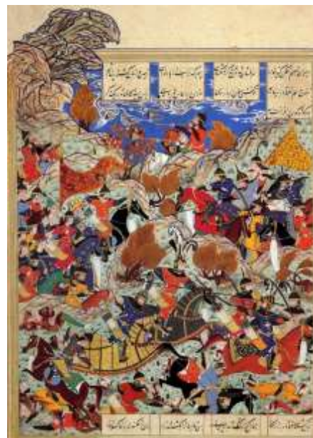
Figure (2) battle between Tamerlane and Sultan of Egypt drawings of Behzad