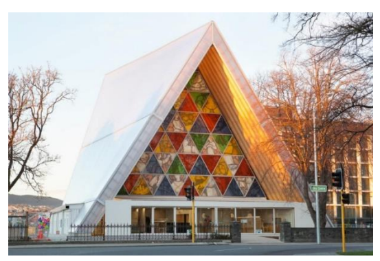
(FIG.5) CARDBOARD CATHEDRAL FROM OUTSIDE

The historical direction appeared in the structural structure of the new building, which was designed in the form of a triangle that was inspired by the triangle truss of the old cathedral of the city that was demolished, also the use of stained glass pieces - with drawings of angels and saints brought from the stellar round window that decorated the main façade of the old cathedral - in a different artistic approach at the facade of the new cathedral, which brings us to some influences of the spirit and character of the