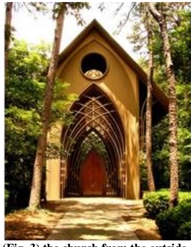
(Fig. 3) the church from the outside http://beautifulbellavista.com/chapel.htm

This historical trend was chosen to revive the Gothic style and draw inspiration from it because of its enduring