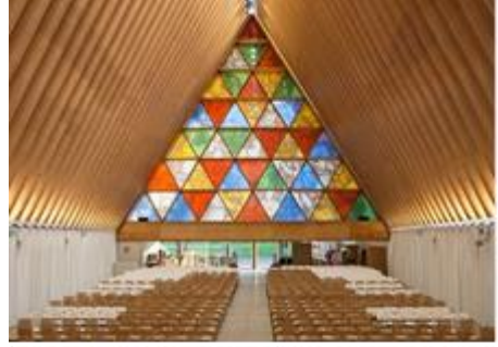
(Fig.6) The Western Wall & The Stained Glass Effect On It

As for the interior design of the church, it is a simple design devoid of decorations and delicate architectural details, and the structural structure of the ceiling appears from the cardboard tubes with the LED lights shining on these tubes from below to create a light and chromatic gradation that gives a lot of beauty (Figure 6). As for the eastern wall above the altar, it is empty except for a large cross that is suspended in the middle and is also made of cardboard tubes. (Figure 7)