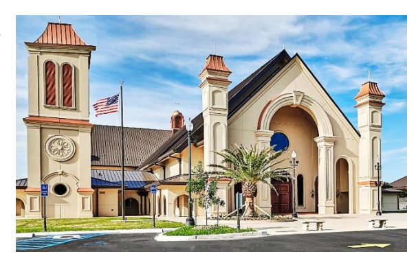
(fig.10) The church from the outside https://jbmouton.com/portfolio-item/st-piuschurch/

The interior of the church is simple and elegant, inspired by the vocabulary of ancient Roman architecture. Perhaps the most important characteristic of the interior design of the church is the frequent use of the contracts, whether they are circular in the ceilings, entrances and the door of the temple, or they are arched by columns in the Roman Tuscan style among the