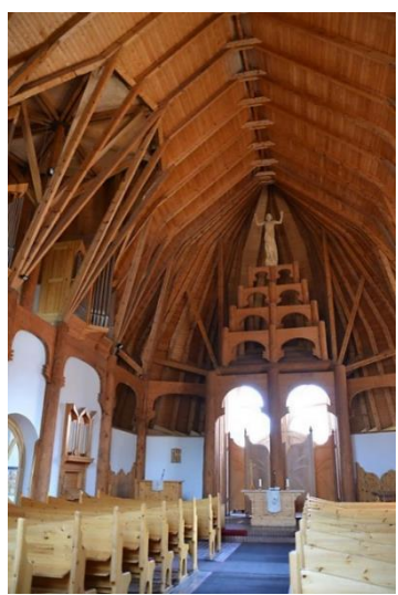
(fig.9) The church interior architecture https://www.tripadvisor.com/Attr action

to infer the shape as their imaginations suggest. The new local trend appears in the reuse of the traditional local buildings in Hungary .