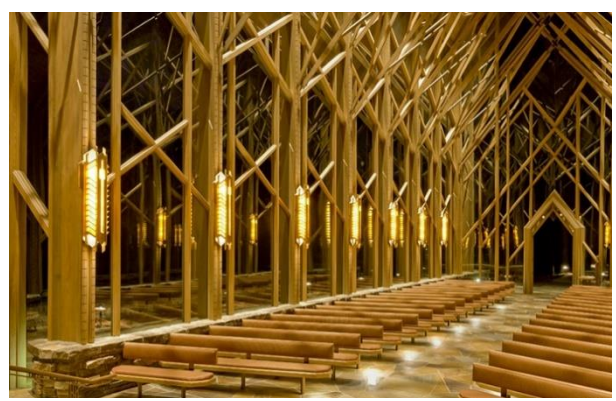
(FIG.2) A PERSPECTIVE VIEW OF THE CHURCH FROM THE INSIDE Https://Www.Baldwinshell.Com/Projects/Item/47-Anthony-Chapel-At-Garvan-Gardens

The church was also affected by the local environmental trend of postmodernism in terms of the exterior design of the cottage, and the use of local wood at a high altitude in the general structure of the church, similar to the trees intertwined with the surrounding forest and emphasizes the general sense of the area as well as the use of natural stones in the floors, and glass walls that makes the external spaces as if they are an extension of the church space and greatly benefit from natural lighting.