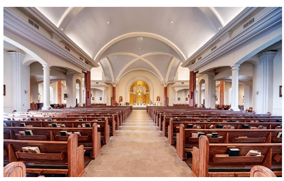
(fig.11) The church interior architecture https://jbmouton.com/portfolio-item/st-pius-church/

It is worth noting that modern technologies blended with classical elements in the internal and external church architecture, as the entire church building was constructed with the latest constructional methods of metal structures in trusses, arches, central pillars, beams, walls, and ceilings. and