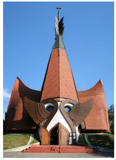
(fig.8) The church from the outside

The church is distinguished by its architecture, which mixes the trend of departing from the familiar and the new local trend, where the direction of departing from the familiar appears at the front of the church entrance from which the shape of two large wings looking like angel's wings for protection, or perhaps they inspire the recipient as they are forming a huge owl, and the tower comes as an eight-sided conical - shaped like a hat over the head of this owl (figure 8), the architect left the choice to the recipients