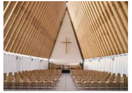
(fig.7) The eastern wall

https://www.theverge.com/2013/8/15/4624914/christchurch-cardboard-cathedralopens-in-new-zealand