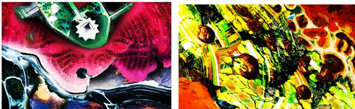
Figure (5): design ideas