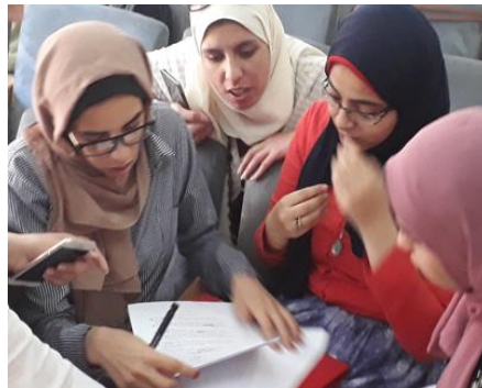
Picture No. (1) and (2) for student during the first and second stage of the infographic