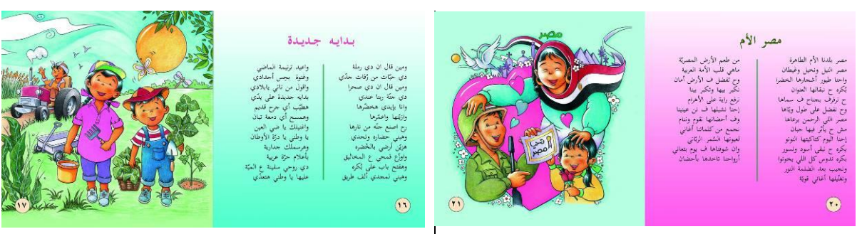
Figure No. (6)