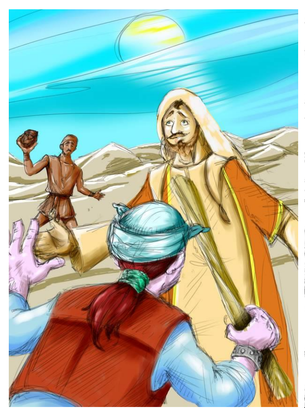
Figure No. (14), page 40 of the book (Habiba - A Novel for Young Women), Ministry of Culture, National Center for Child Culture, Egypt, 2019 AD, authored by "Shehab Sultan" and drawings by "The Researcher."