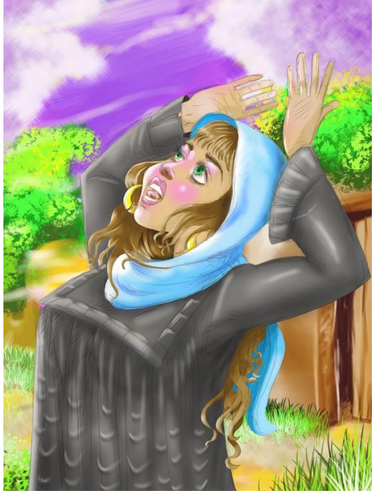
Figure No. (12), page 3 of the book (Habiba - A Novel for Young Women), Ministry of Culture, National Center for Child Culture, Egypt, 2019 AD, authored by "Shehab Sultan" and drawings by "The Researcher"