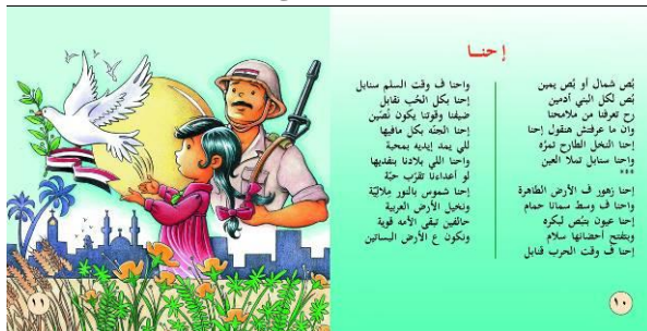
Figure No. (4)