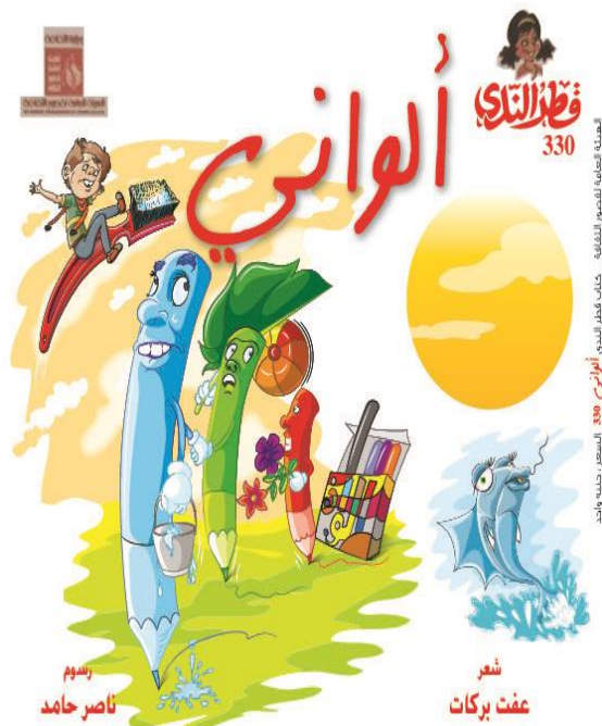
Figure No. (9) cover of the book (Colors) issued from the book series Qatar Al Nada, the Egyptian General Book Authority, 2018 AD, number 330, poetry of Barakat", drawings by "the researcher"