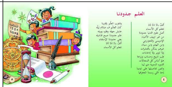
Figure No. (3)