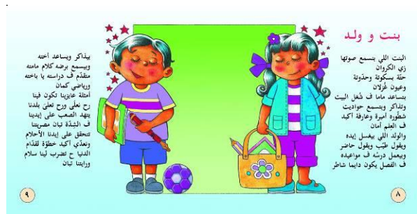
Figure No. (1)