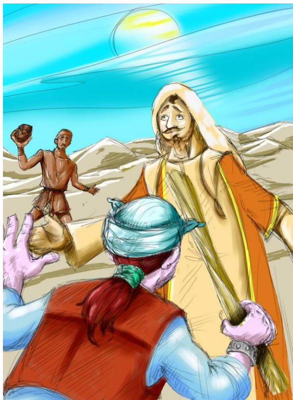
Figure No. (14), page 40 of the book (Habiba - A Novel for Young Women), Ministry of Culture, National Center for Child Culture, Egypt, 2019 AD, authored by "Shehab Sultan" and drawings by "The Researcher."