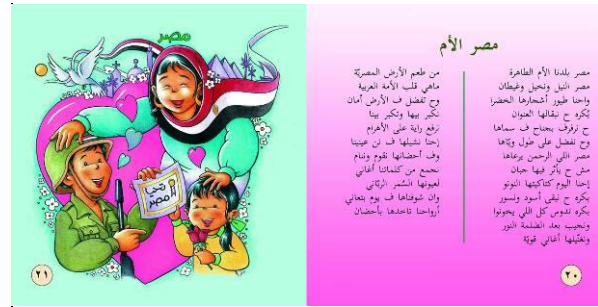
Figure No. (5)

(Figures 1: 6) from the book “Hana Gouda” Poetry, by Abdul Majeed Sharif (Hands on Hands - Songs for Children), Ministry of Culture, National Center for Child Culture, 2017