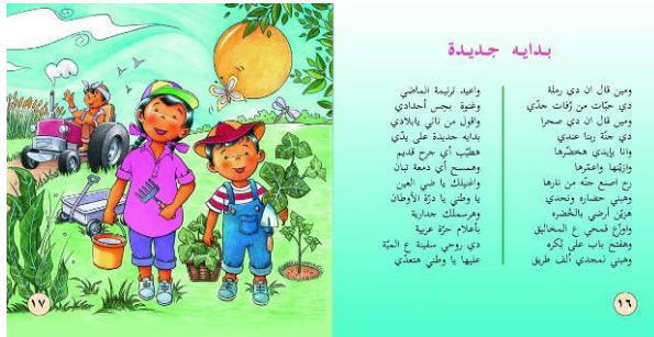
Figure No. (6)