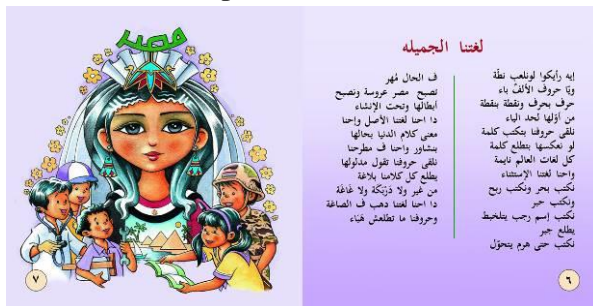
Figure No. (2)

The poems of children depend on the rhyme, which is the last word in the poetic house, and the sea is the rhythm of repeated activations and is known by the methods. it means melody, and it is called the complete house.