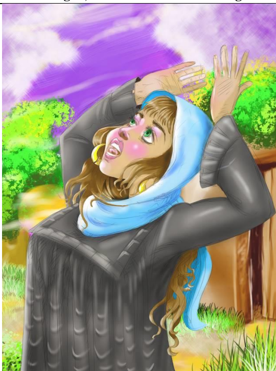
Figure No. (12), page 3 of the book (Habiba - A Novel for Young Women), Ministry of Culture, National Center for Child Culture, Egypt, 2019 AD, authored by "Shehab Sultan" and drawings by "The Researcher"