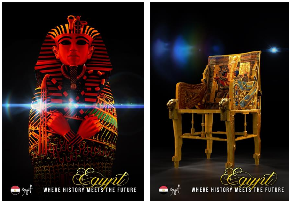
Figure (2) Traditional condition (First ad and Second Ad)

The participants completed the questionnaires attached to the two experiments for the declarations (Appendix 1) which included several procedures and elements for determining their attitudes towards each announcement. They were then asked to send the questionnaires and were thanked for their time and effort.