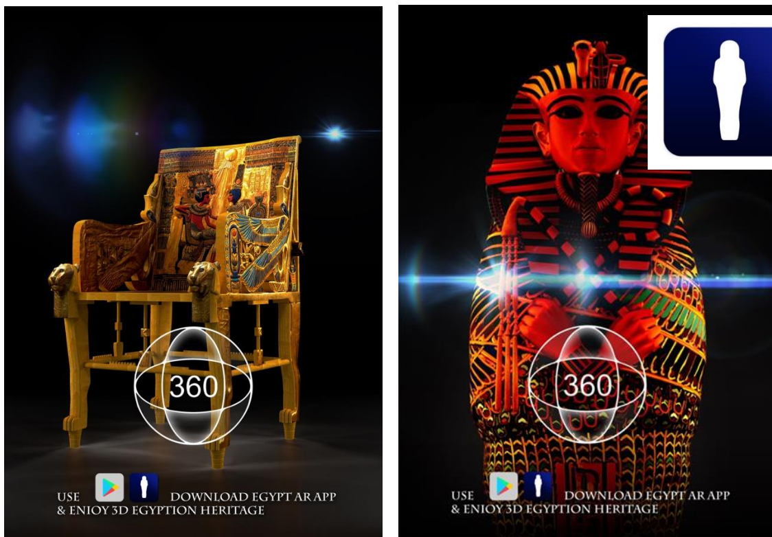
Figure (1) Augmented realty condition (First ad, Second Ad and the app Icon design)

It also provided the application with adequate information about each model through a special information icon and access to the Internet to search for more information. A user could save images of the model taken on his smartphone at any angle, zoom in and out as well as roll and zoom in and zoom out which enabled free interactions with both models.