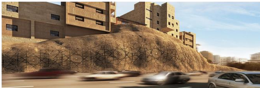
shape no. (2)- EL-Mualla- mural- Makkah

1- Ahmed el-Badawy designed this mural in Makkah and he got inspired from the natural shape of the rock, he used tiles to give the geometrical shapes of Islamic patterns.