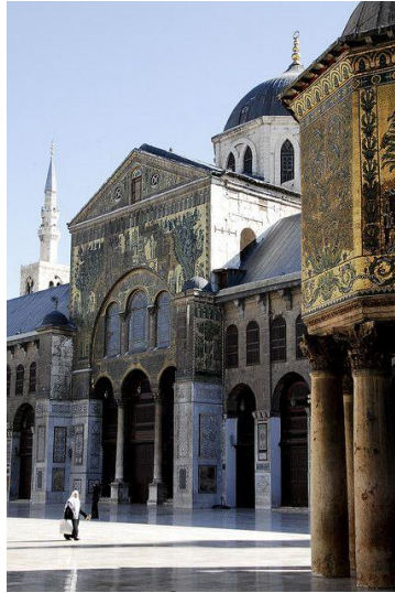
Shape no. (1)- The façade of the Umayyad mosque –Syria

mural painting like the great one which belongs to the Umayyad era in Damascus, Syria, this mural was made of mosaic which was affected with roman designs, shape no. (1)