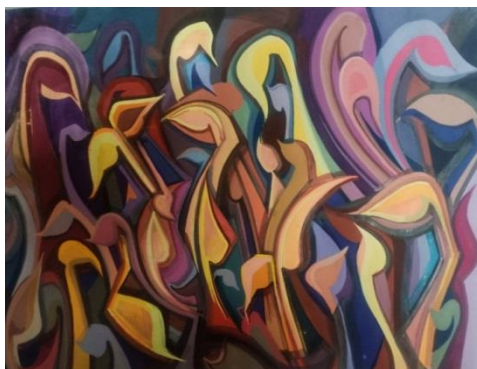
Example no. (3)- Gouache on paper.