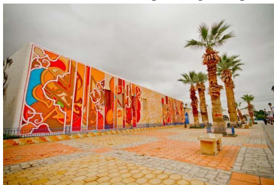
shape no. (3)- El seed mural- Kairouan-Tunisia

El –Seed was an artist who used geometrical and floral patterns merged with calligraphy to paint on walls like graffiti art ,haw was aware of environment and architecture ,he repeated the Islamic pattern on his treatment to make a mural painting ,(shape no.3).