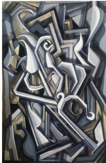
Example no. (1)- Gouache and ink on paper.

The researcher tried to find solutions for implying Islamic patterns (geometric and floral), architectural fundamentals and the surface characteristics to produce an Islamic mural painting.