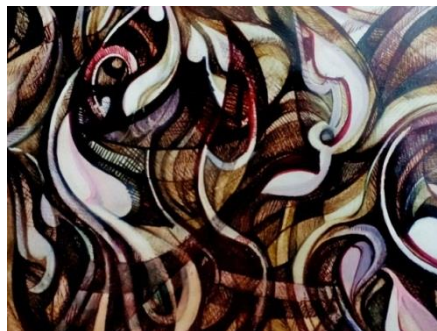
Example no. (2)- Colored pencils on paper.